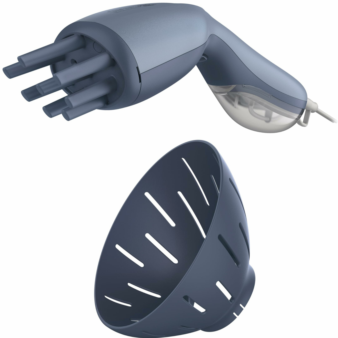
Figure 1: Infiniti PRO by CONAIR Steam Therapy Hair Steamer with its components.