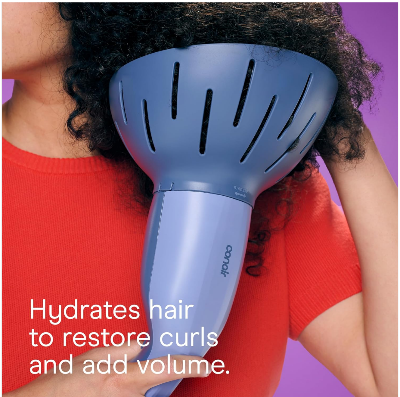
Figure 4: Using the diffuser attachment for overall hydration and curl definition.