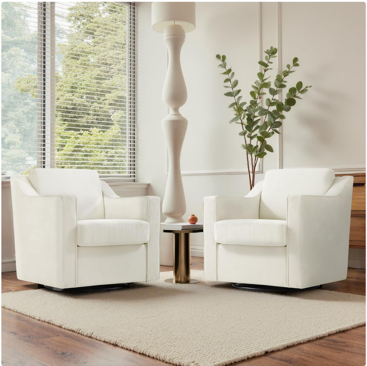
Image 2.1: Two UIXE Swivel Accent Chairs in a cream beige color, showcasing their design in a living room setting.