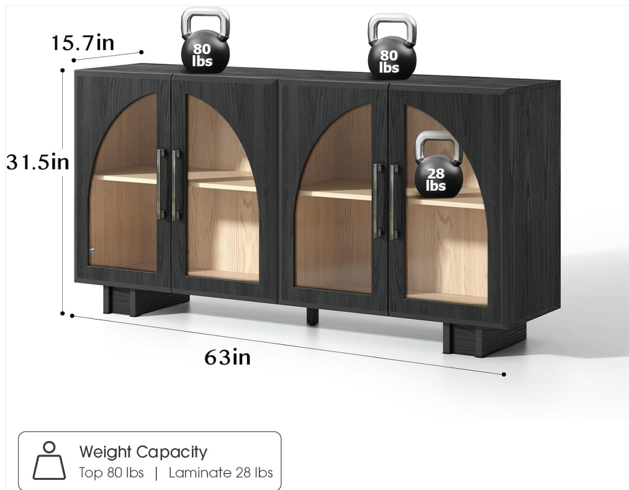
Image: A visual representation of the cabinet's dimensions (15.7"D x 63"W x 31.5"H) and its weight capacity, indicating 80 lbs for the top surface and 28 lbs for each laminate shelf.