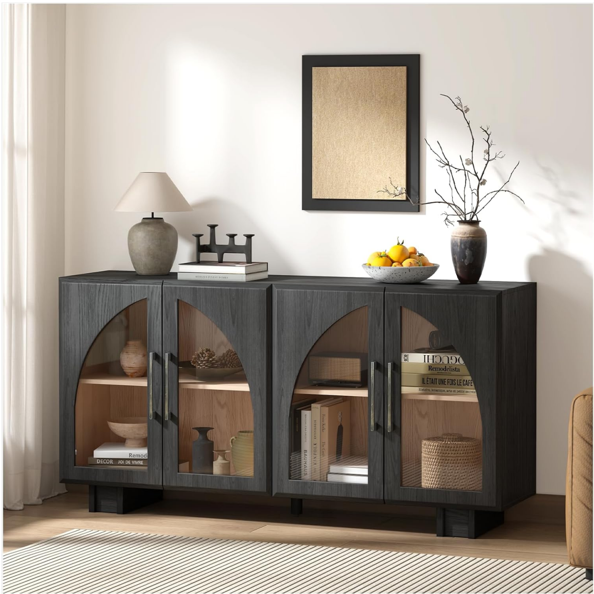
Image: The JOINICE 63-inch Wide Sideboard Buffet Cabinet, showcasing its modern design with arched glass doors and wood grain black finish, positioned in a living room.