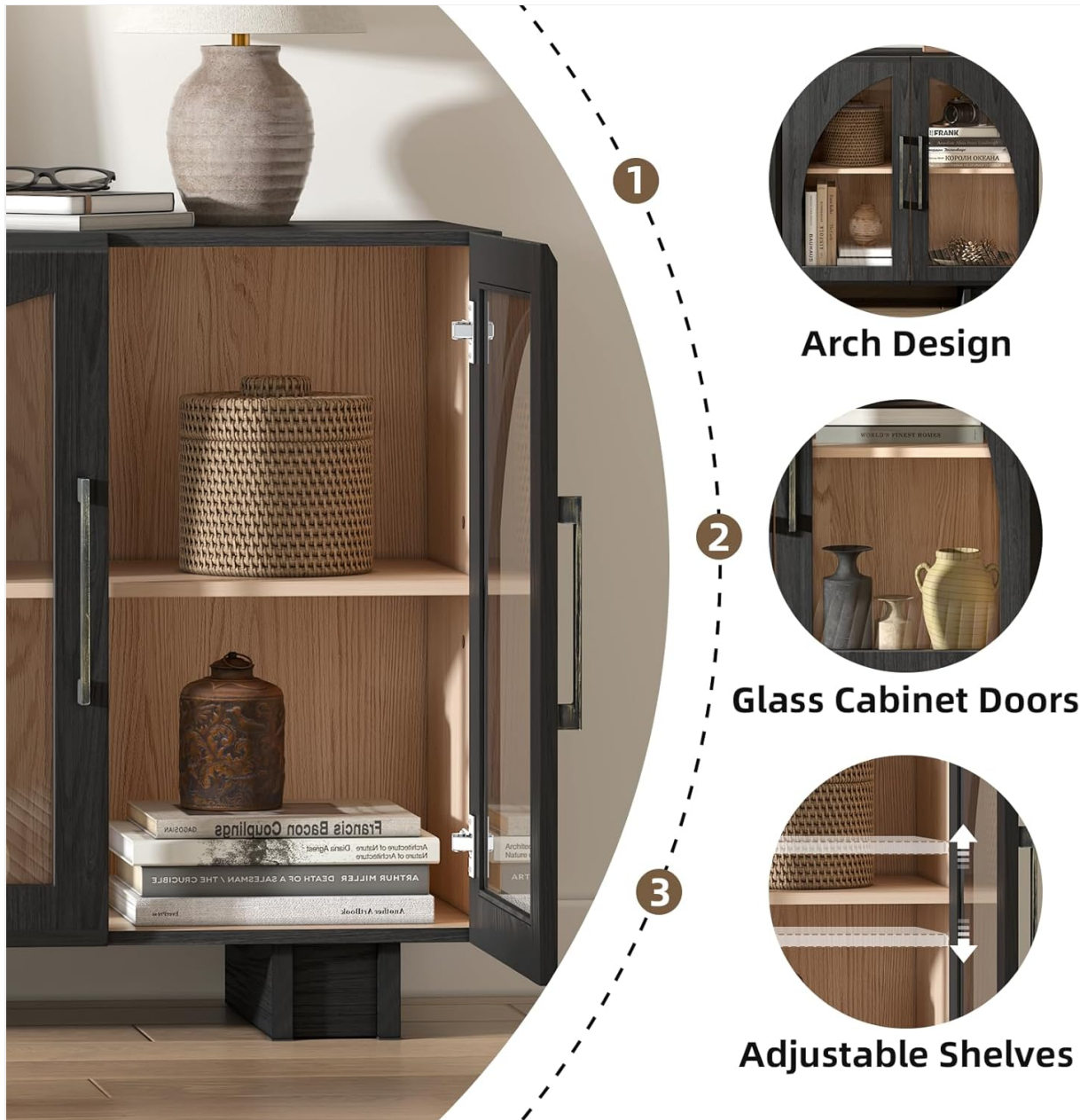
Image: Close-up details highlighting the cabinet's arched glass door design, the transparency of the glass doors, and the mechanism for adjusting shelf height within the cabinet compartments.