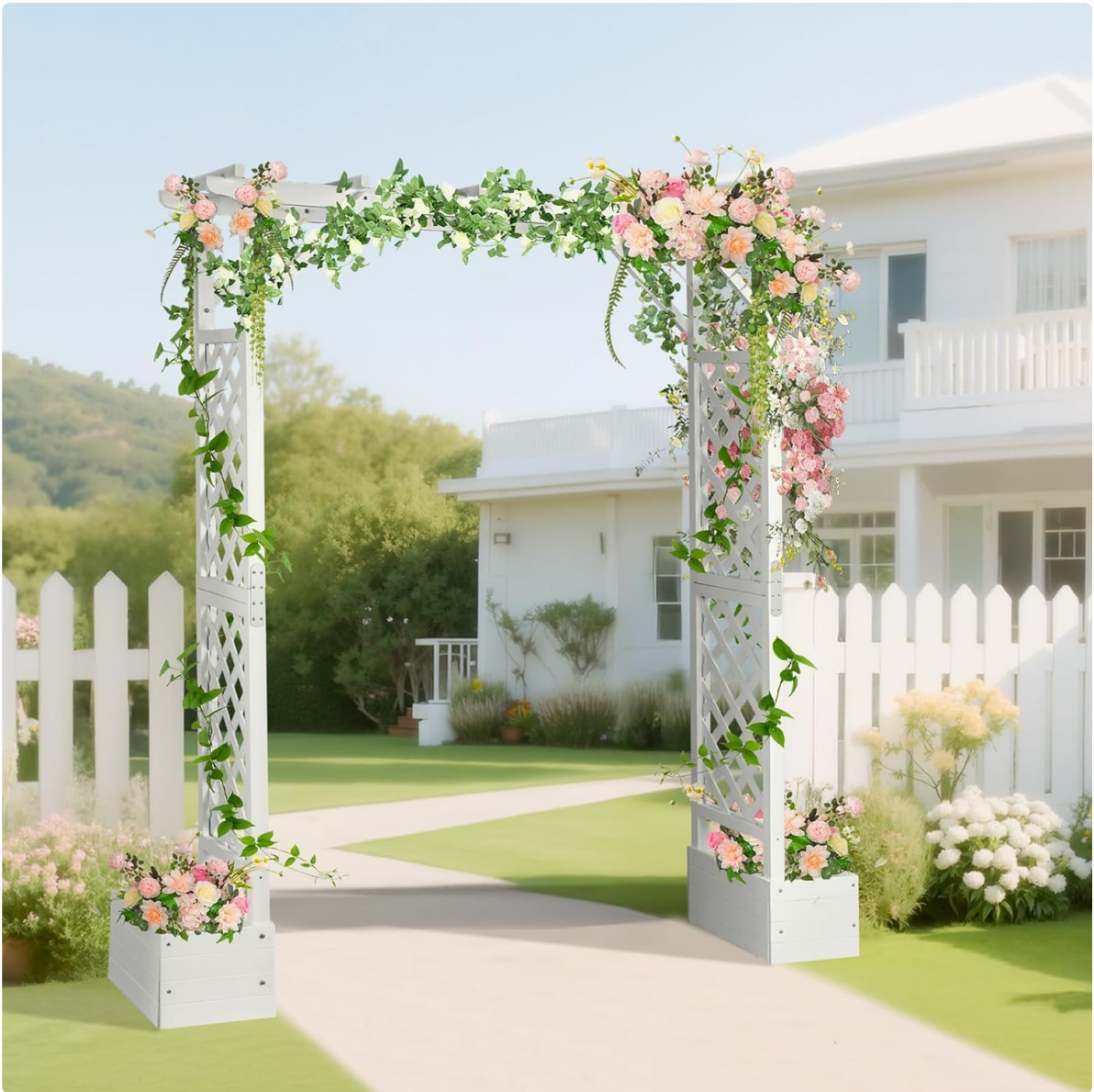
Image: The VINGLI Wooden Garden Arbor with Planter, decorated with flowers and greenery, positioned in a lush garden pathway.