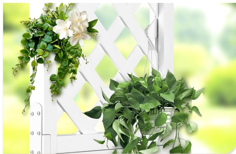
Image: A detailed view of the arbor's wide arch top, suitable for various decorations, and the trellis design for climbing plants.