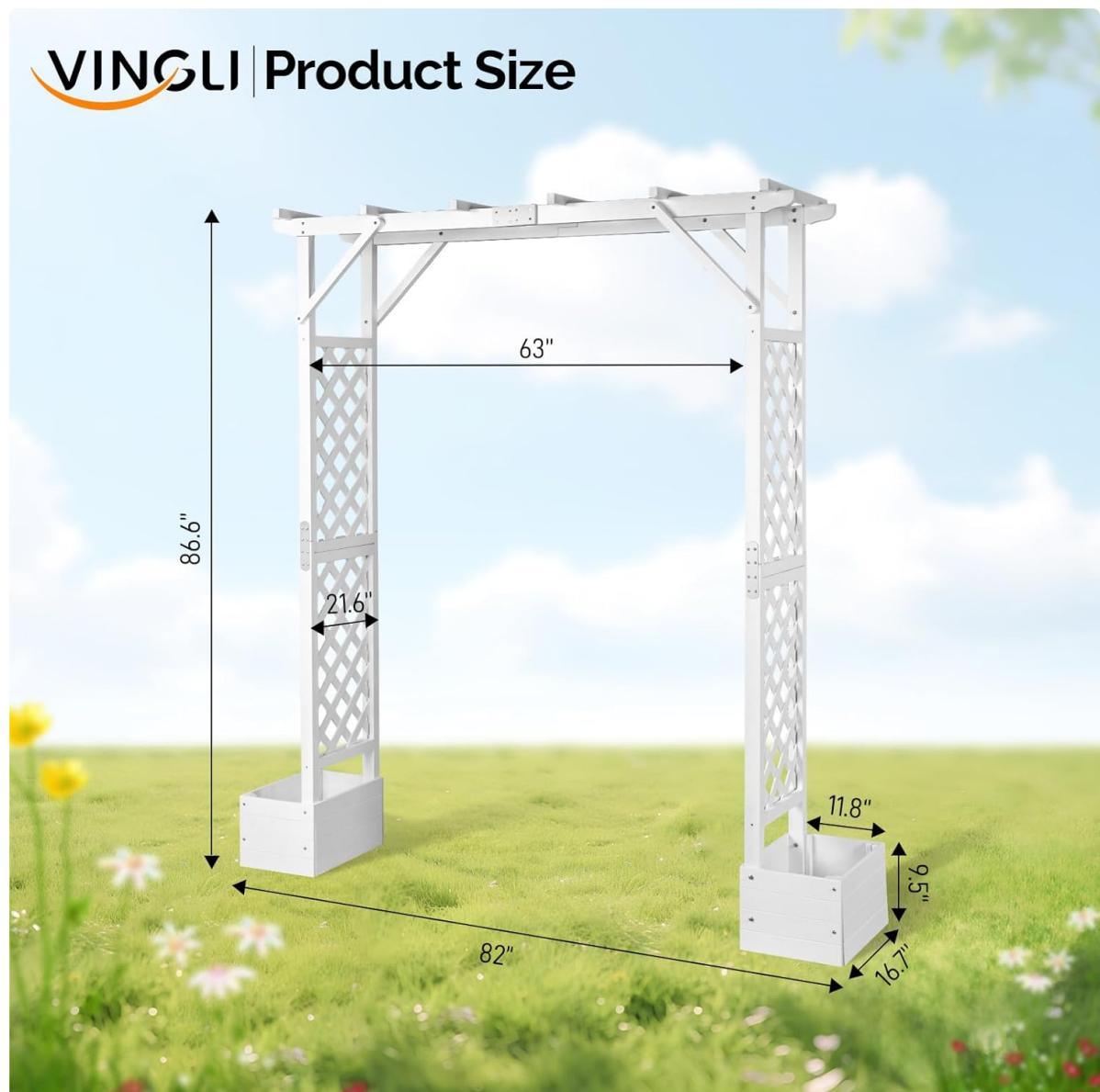
Image: A diagram illustrating the overall dimensions of the VINGLI Wooden Garden Arbor, including height, width, and planter box measurements.