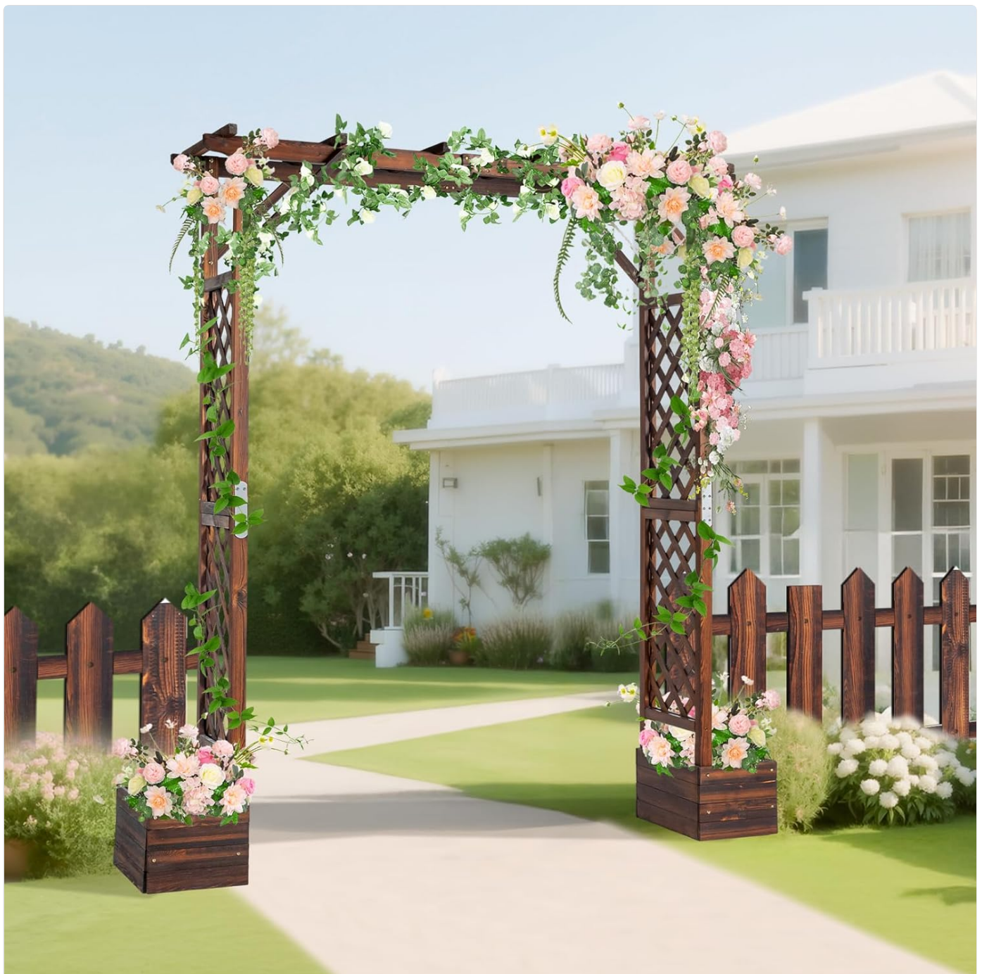
Image 5.3: The arbor positioned as a charming entrance to a garden path, enhancing the landscape.