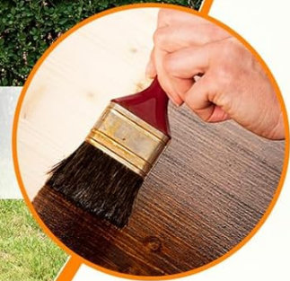
Image 6.1: The arbor is crafted from solid wood, which is sanded, carbonized, and varnished for durability and weather resistance.