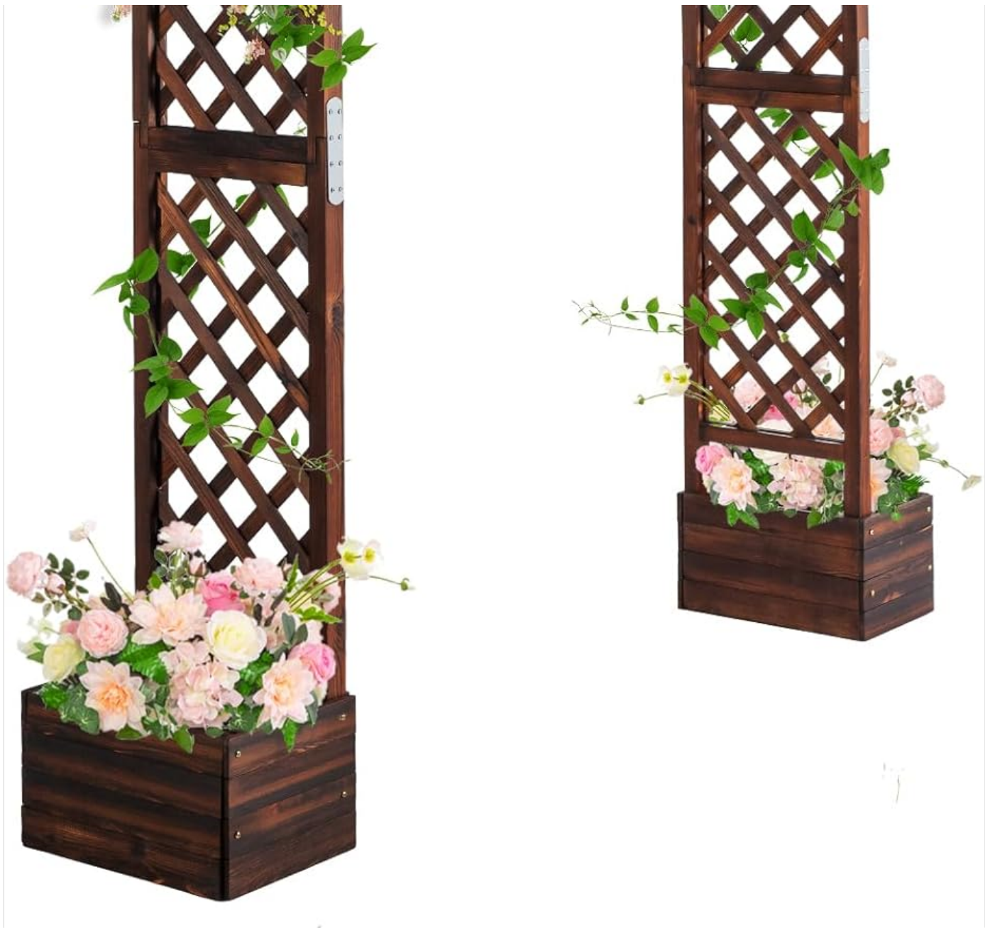
Image 1.1: The VINGLI Wooden Garden Arbor with integrated planter boxes, suitable for various outdoor settings.