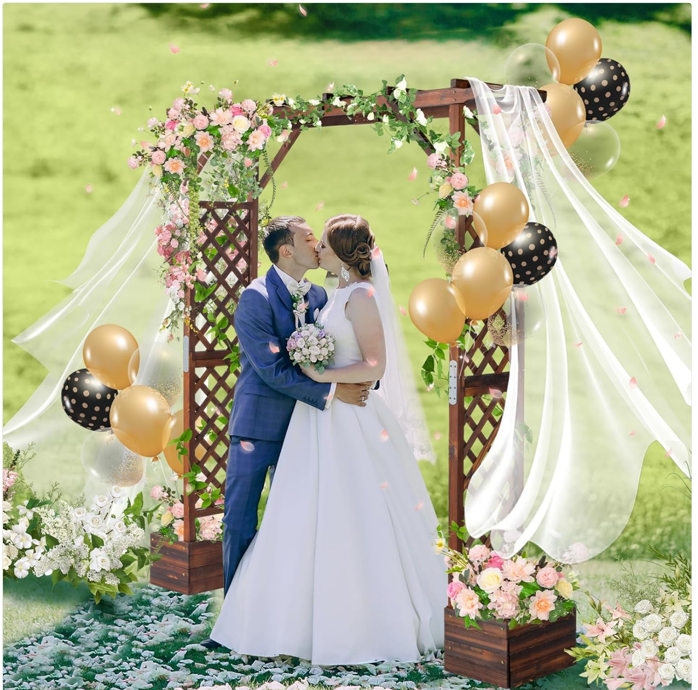
Image 5.2: The arbor can be adorned with flowers and fabric to create an elegant setting for special events like weddings.