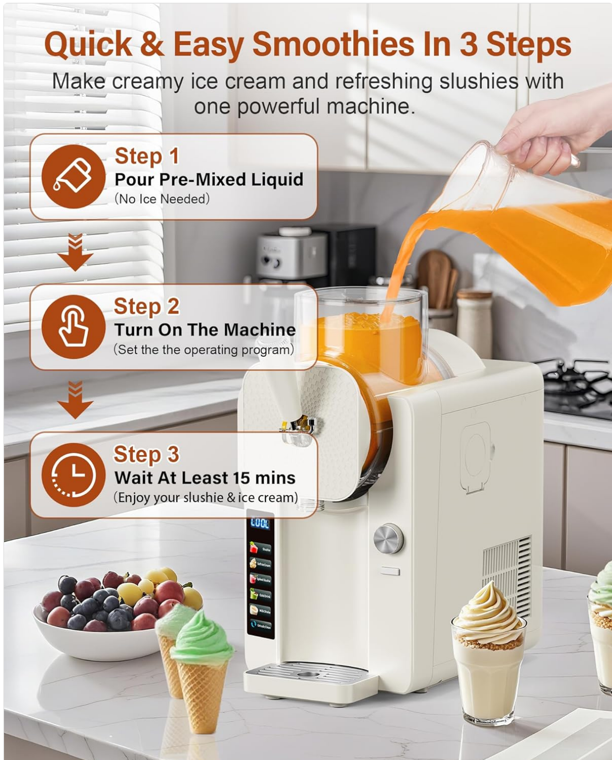
Figure 3.1: Quick and easy steps for preparing your frozen treats.