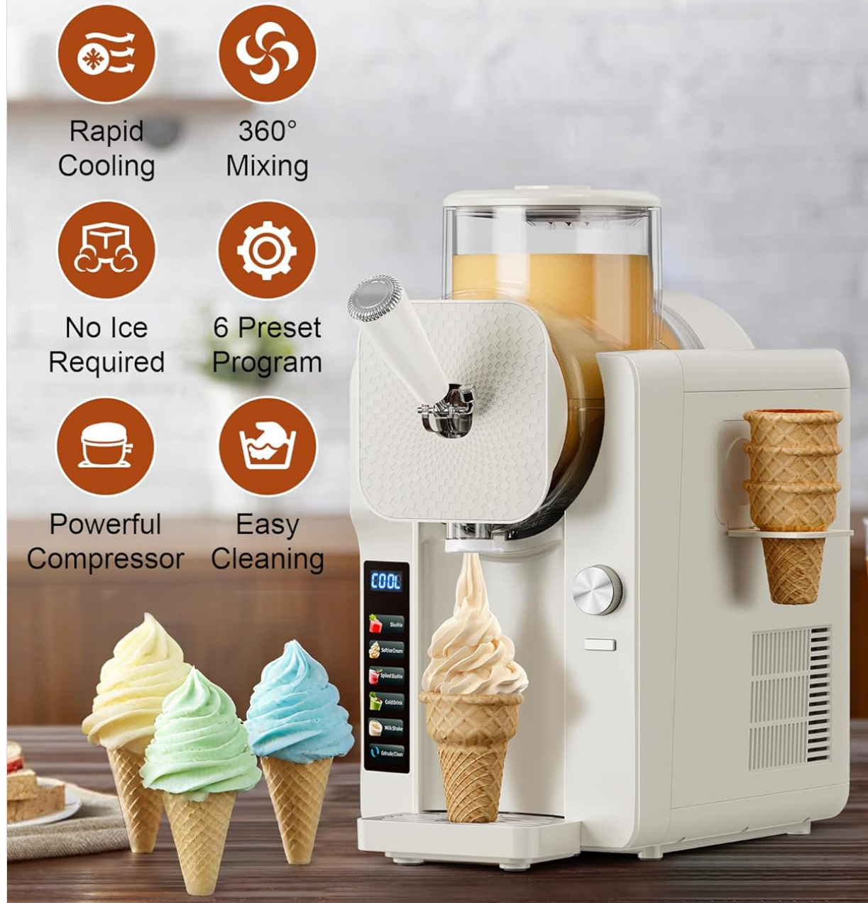
Figure 2.1: Overview of the SOZT 2-in-1 Slush & Ice Cream Maker with its main features.