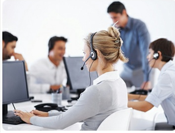
Figure 9.1: SOZT is committed to providing professional customer service and support.

We have a professional customer service team to provide the most professional and friendly service for your after-sales. We promise that we will provide our best service to satisfy you.