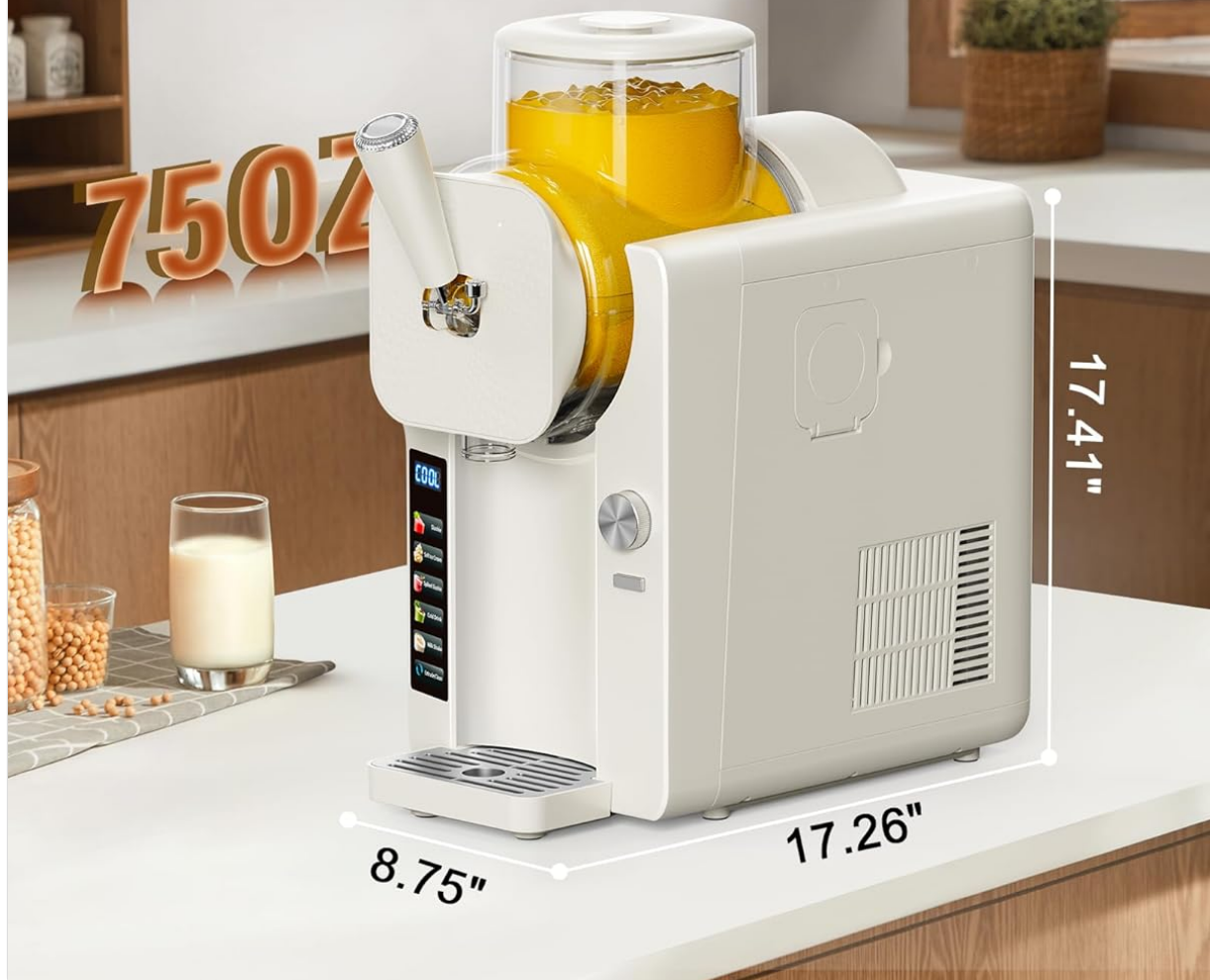
Figure 8.1: The machine's dimensions and capacity, indicating 6-8 cups per round (250 ml/cup).