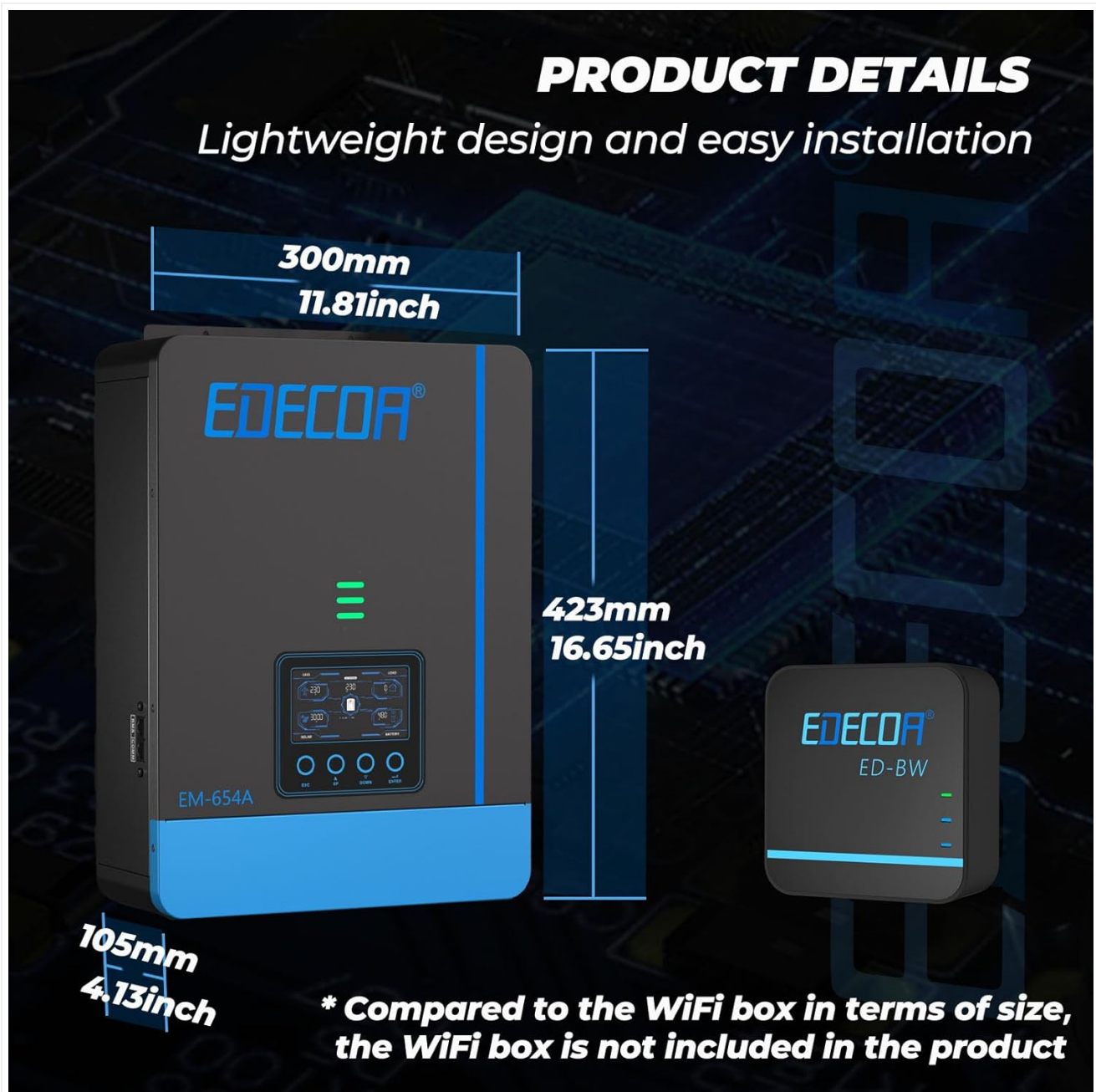
Figure 3.2.1: Product dimensions. The inverter measures approximately 423mm (16.65 inches) in height, 300mm (11.81 inches) in width, and 105mm (4.13 inches) in depth.

The EDECOA Hybrid Inverter combines multiple functionalities in a compact design. Below are the general dimensions and a diagram of its main components and connection ports.