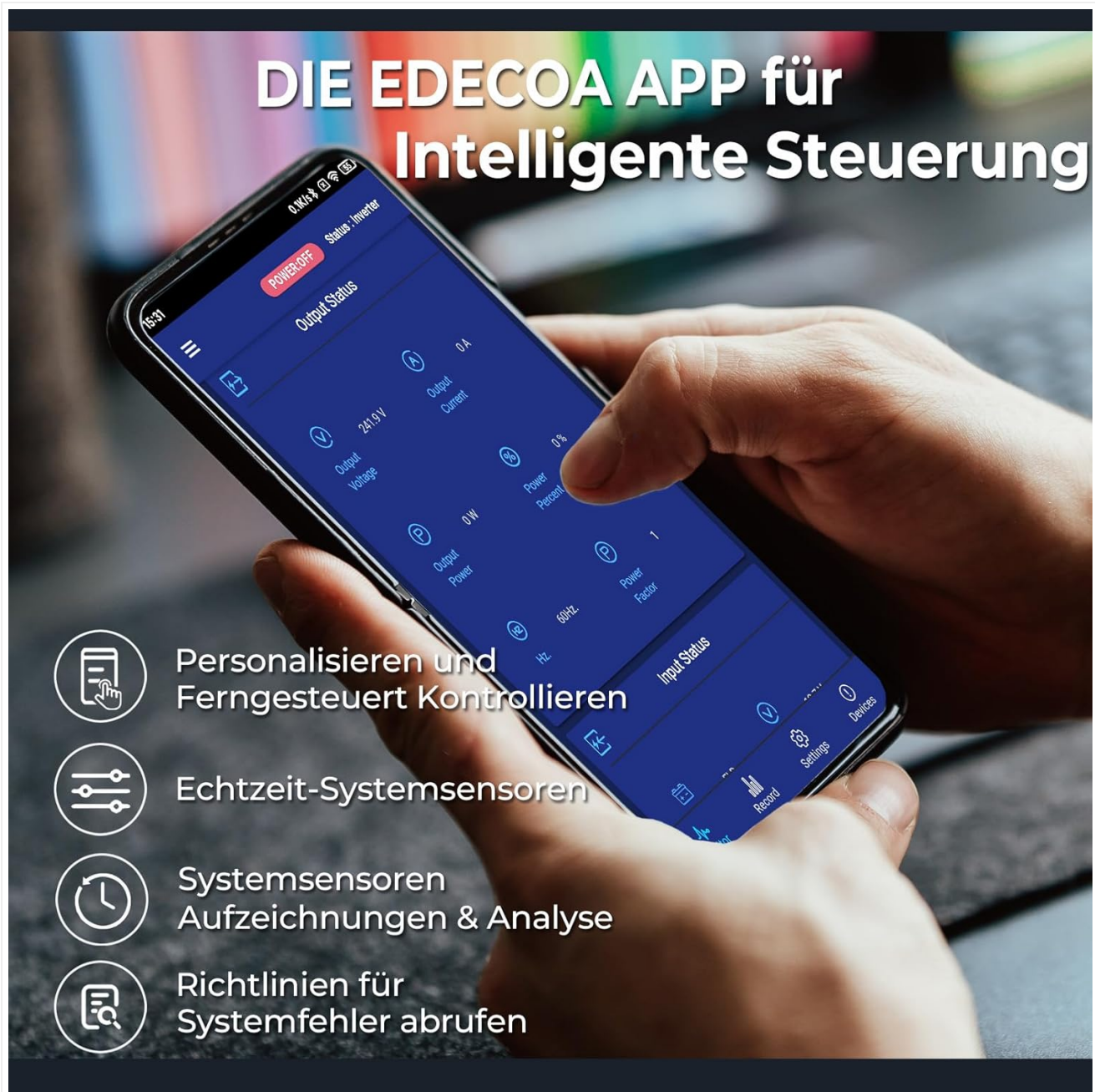
Figure 5.5.1: EDECOA App for Intelligent Control. The app provides a user-friendly interface for monitoring and managing the inverter's performance.

The inverter supports remote monitoring and control via a compatible WiFi module (sold separately) and a dedicated mobile application. This allows users to personalize settings, view real-time system sensors, analyze data, and retrieve system error guidelines.