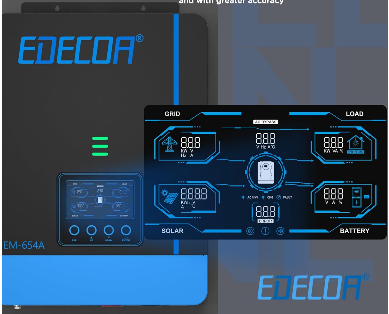
Figure 5.2.1: LCD display interface. The display shows detailed information for Grid, Load, Solar, and Battery, including voltage, current, power, frequency, and error indicators.

The inverter's AI chip processes the display signals more stable and with greater accuracy