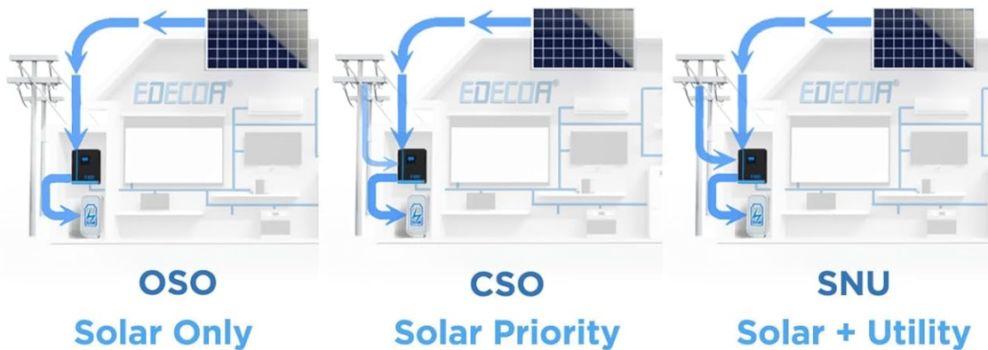
Figure 5.3.1: Output and Charging Modes. This diagram illustrates how the inverter prioritizes power sources for both load and battery charging.