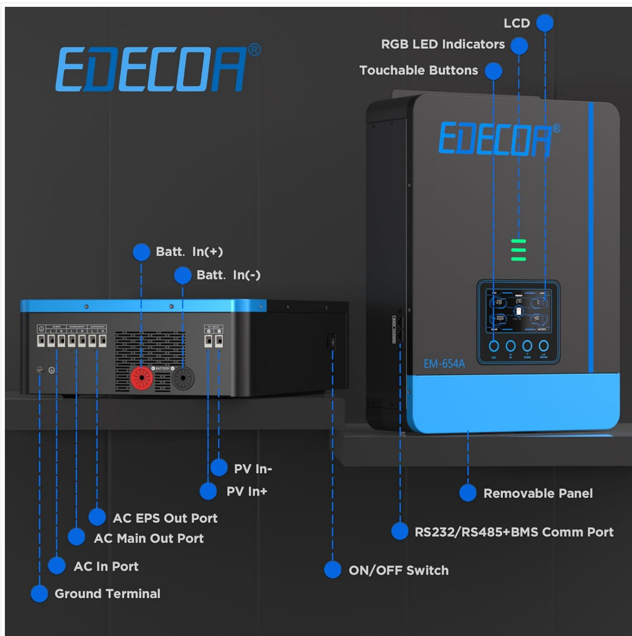
Figure 3.2.2: Front and rear panel overview. The front panel features an LCD display, touchable buttons, and RGB LED indicators. The rear panel includes terminals for Battery In (+/-), PV In (+/-), AC EPS Out Port, AC Main Out Port, AC In Port, Ground Terminal, RS232/RS485+BMS Comm Port, and an ON/OFF Switch.