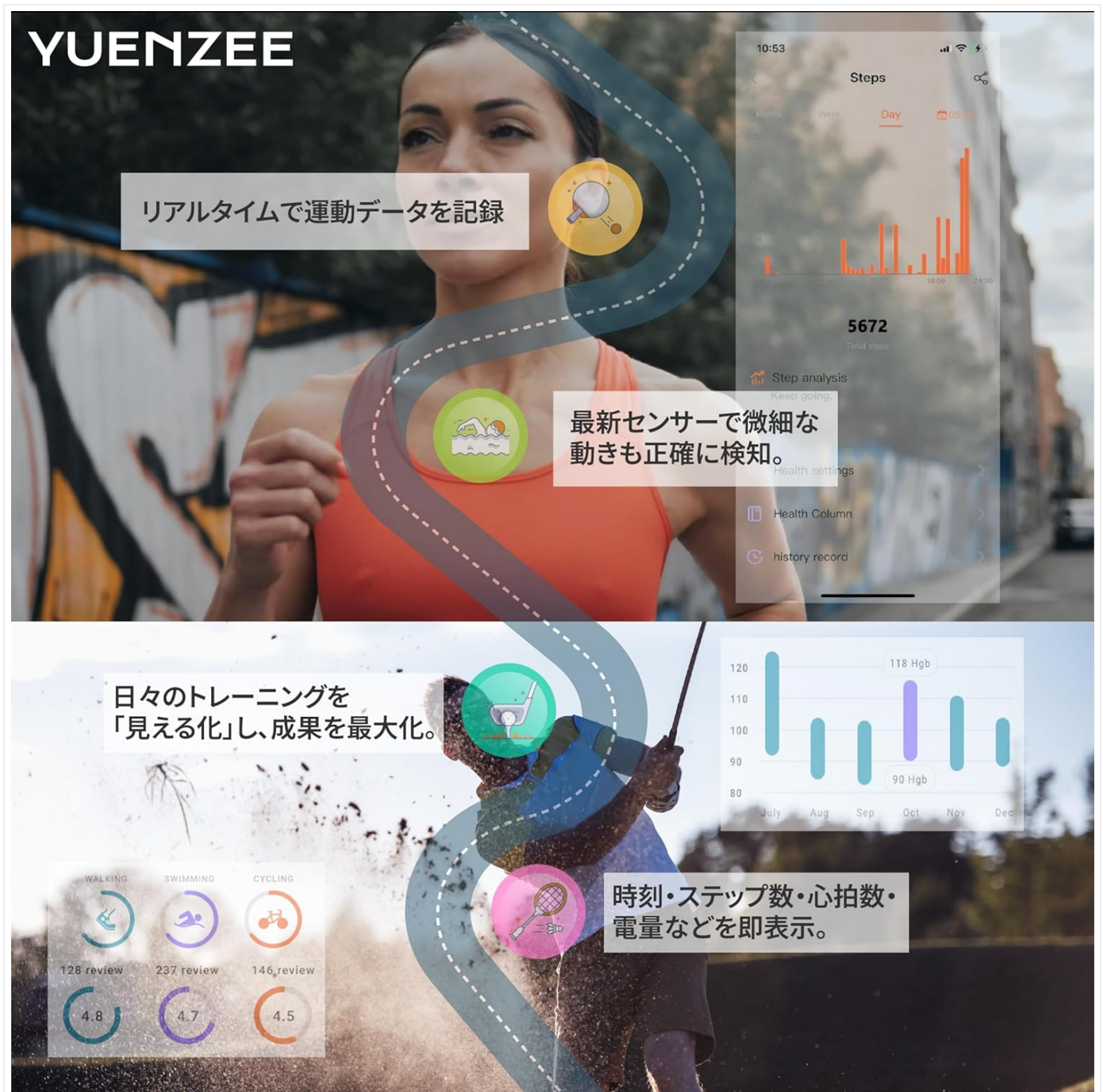
Image 5: App interface showing real-time activity data, including steps, calories, and distance, with various sports icons.