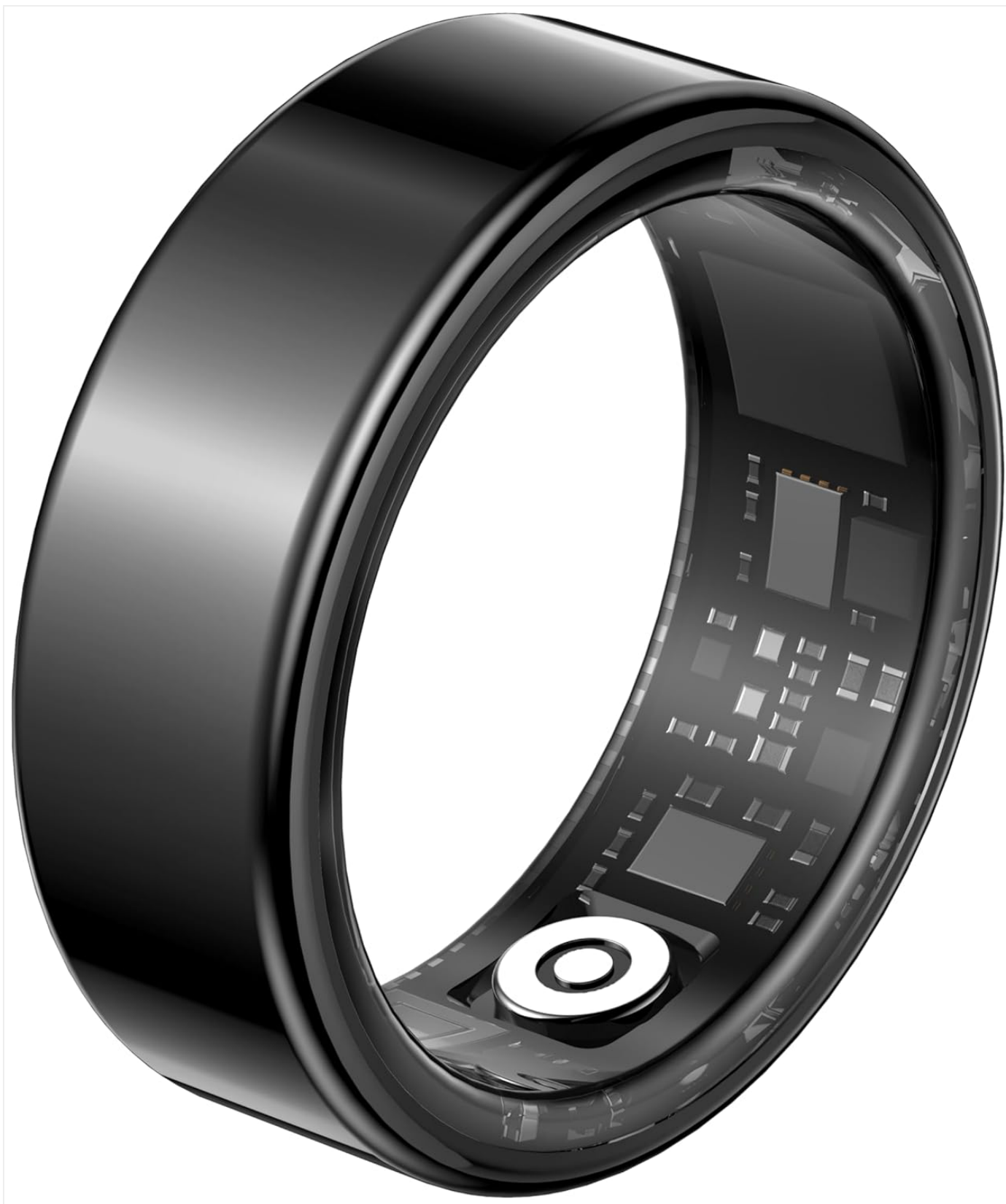
Image 1: YUENZEE Smart Ring SY-02. A sleek, black smart ring with internal sensors visible, designed for discreet wear.