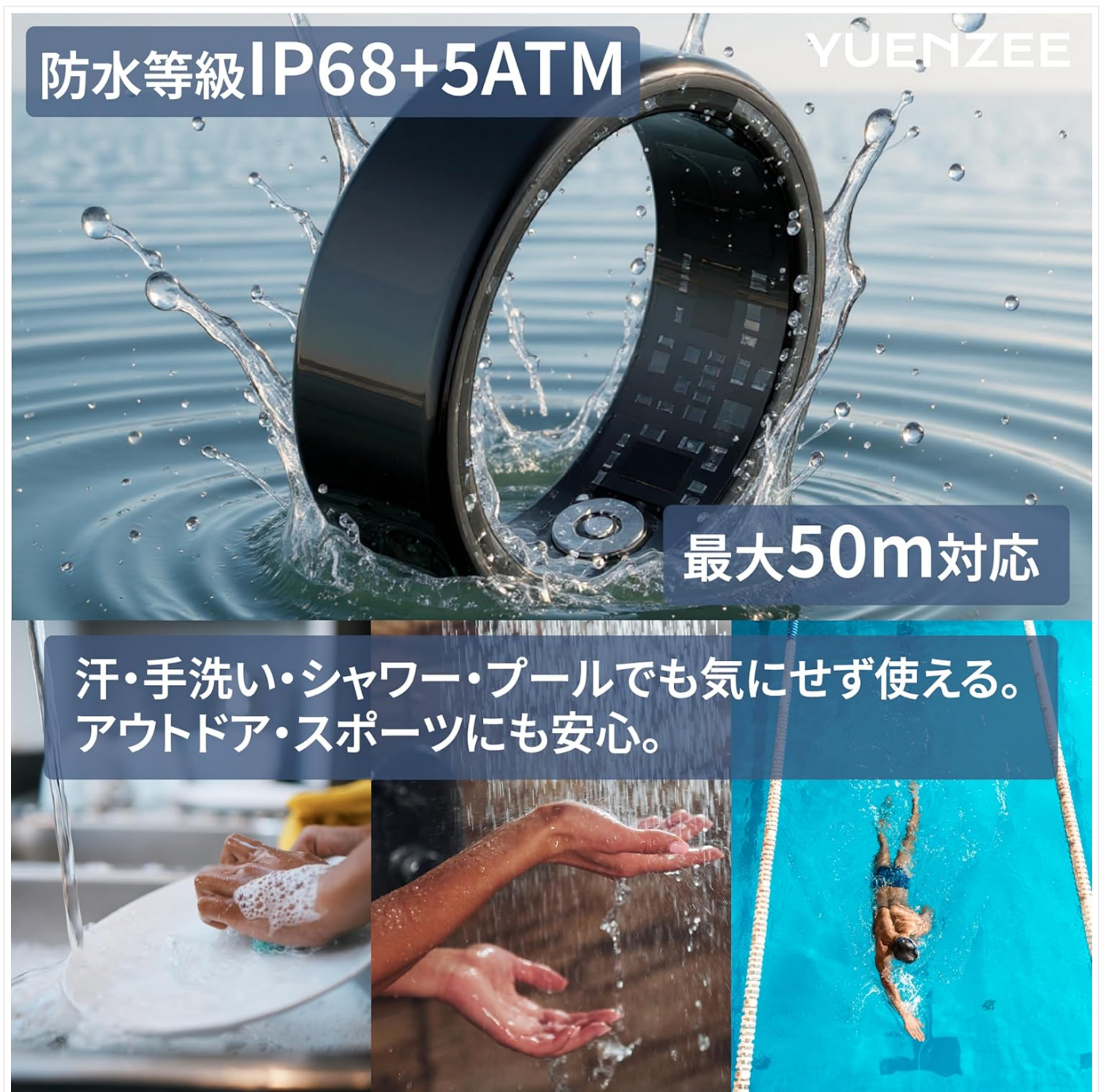
Image 7: The smart ring submerged in water, illustrating its IP68+5ATM waterproof rating, with additional images showing use during dishwashing, hand washing, and swimming.