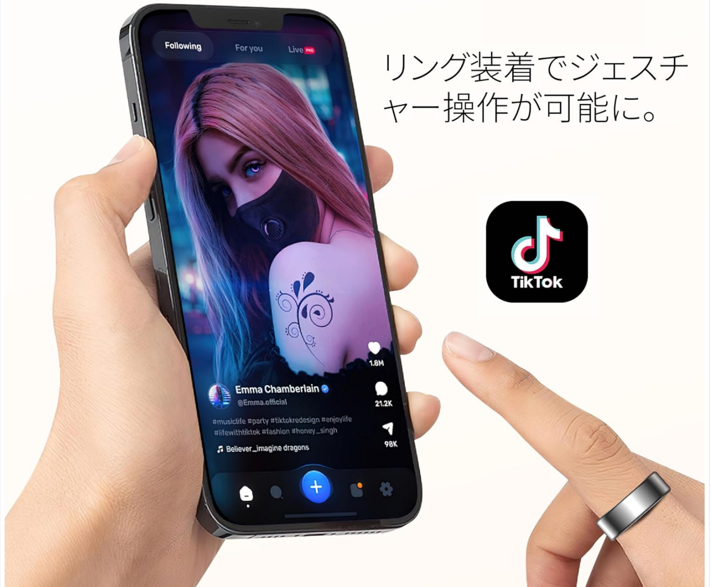
Image 6: A hand wearing the smart ring, demonstrating how a double-tap gesture can control a smartphone application, such as switching videos on TikTok.