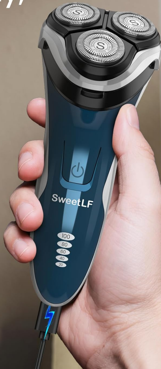
Image 3.3: The shaver connected via Type-C cable, displaying battery level.