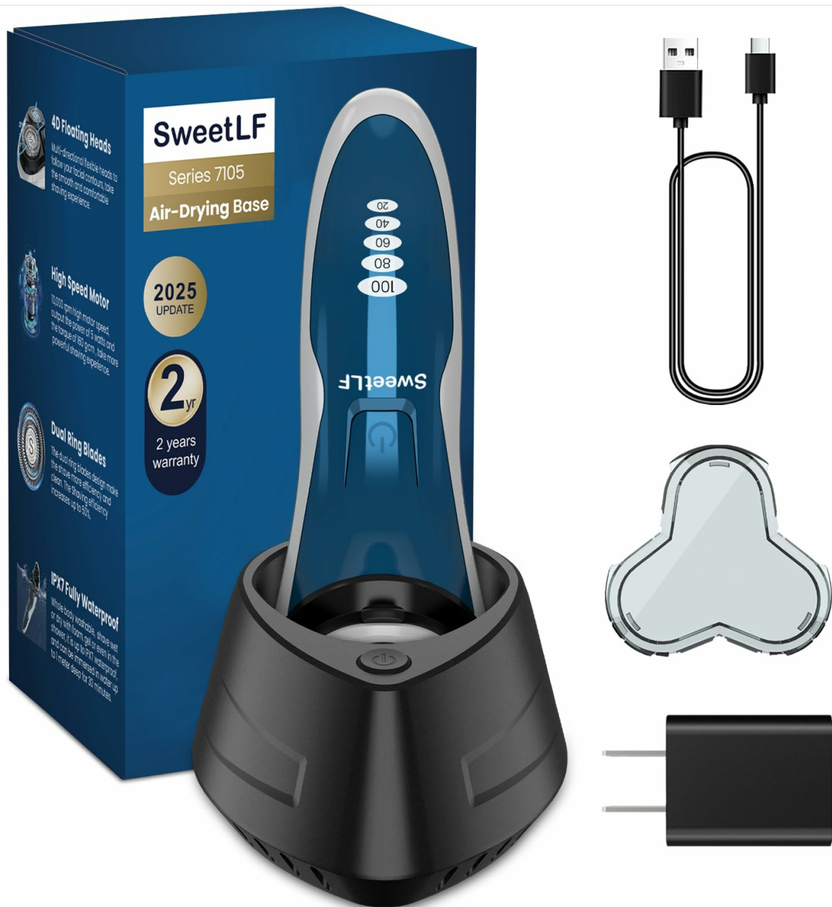
Image 2.1: SweetLF Electric Shaver SWS7105 and its Air-Drying Base.