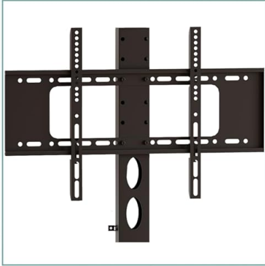
Height Adjustable Mount