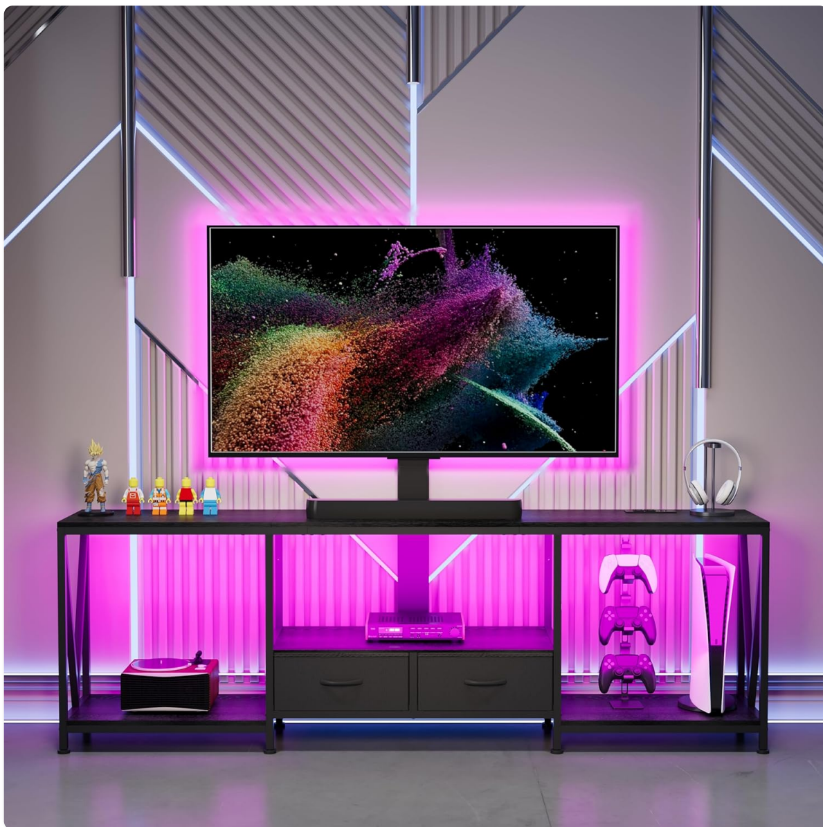
Image showing the NinPeen TV Stand with a mounted television, highlighting the overall setup with pink LED backlighting.

Carefully place your TV face down on a soft, clean surface. Remove any existing screws or covers from the VESA mounting holes on the back of your TV. Select the appropriate screws, washers, and spacers from the hardware kit that fit your TV's VESA pattern. Attach the vertical mounting brackets to the back of your TV, ensuring they are securely fastened.