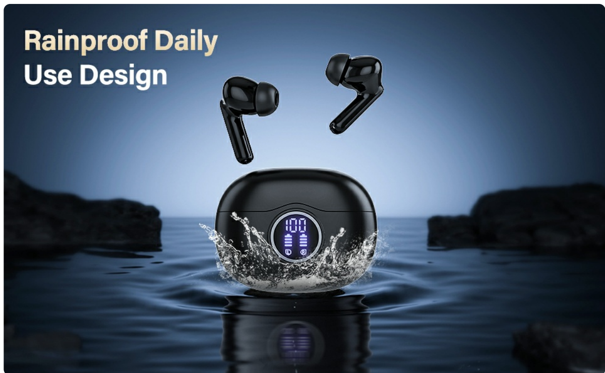
Image: The Sisism A10 Pro Earbuds and charging case with water splashing around them, illustrating their rainproof and daily use design with IPX7 water resistance.