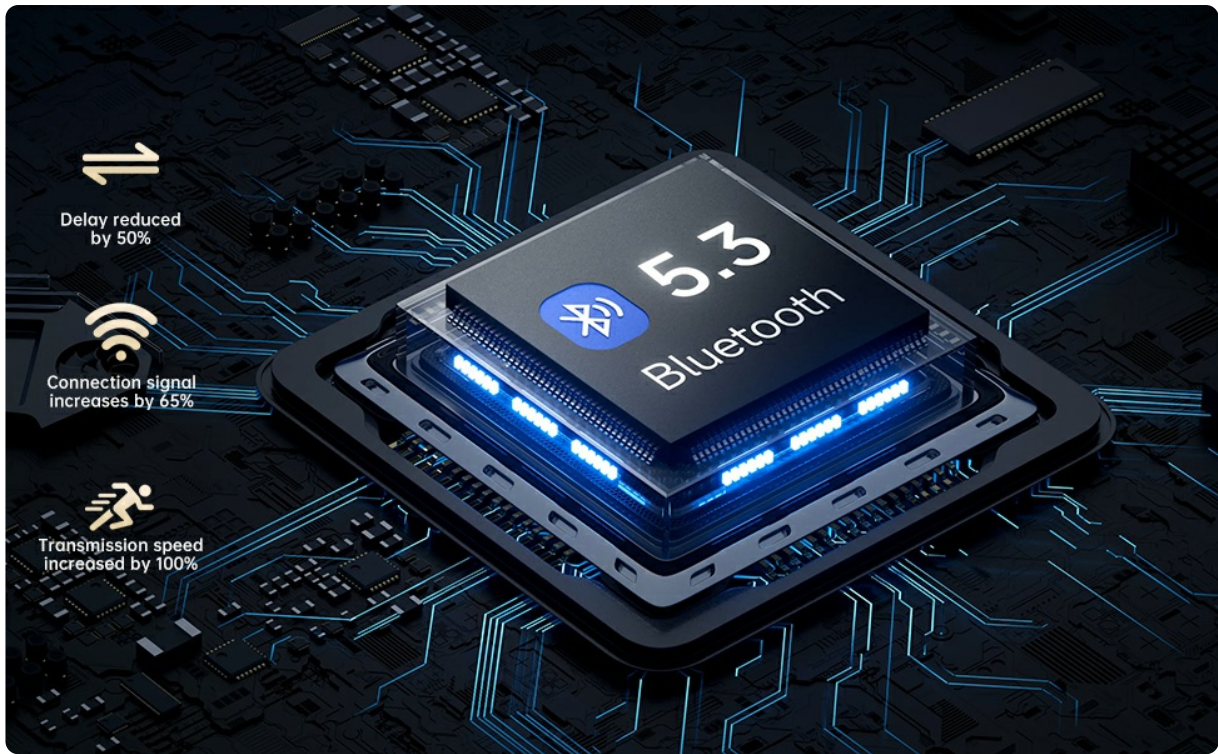
Image: A diagram illustrating the Bluetooth 5.3 chip, highlighting improvements such as 50% reduced delay, 65% increased connection signal, and 100% increased transmission speed.