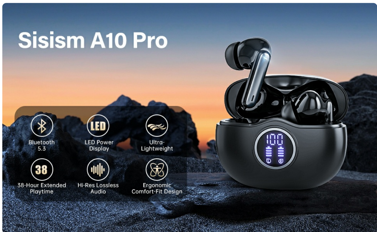
Image: The Sisism A10 Pro Wireless Earbuds in their charging case, highlighting key features such as Bluetooth 5.3, LED power display, ultra-lightweight design, 38-hour extended playtime, Hi-Res lossless audio, and ergonomic comfort-fit design.

Thank you for choosing the Sisism A10 Pro Wireless Earbuds. This manual provides essential information for the proper setup, operation, and maintenance of your earbuds. Please read it thoroughly before use to ensure optimal performance and longevity of the product.