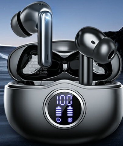
Image: The Sisism A10 Pro Earbuds in their charging case, illustrating the extended battery life of 50 hours and 1.5 hours fast charging capability.