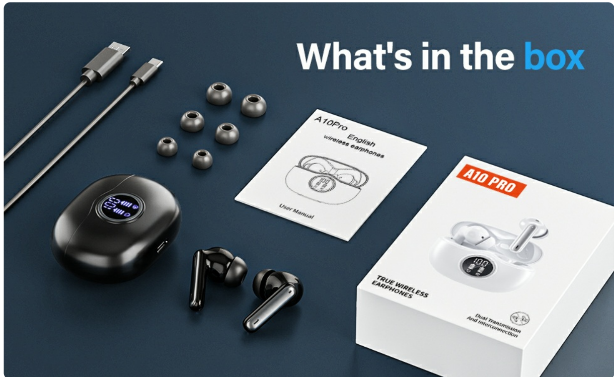
Image: A flat lay of the Sisism A10 Pro package contents, including the earbuds, charging case, USB-C cable, various ear tip sizes, and the user manual.