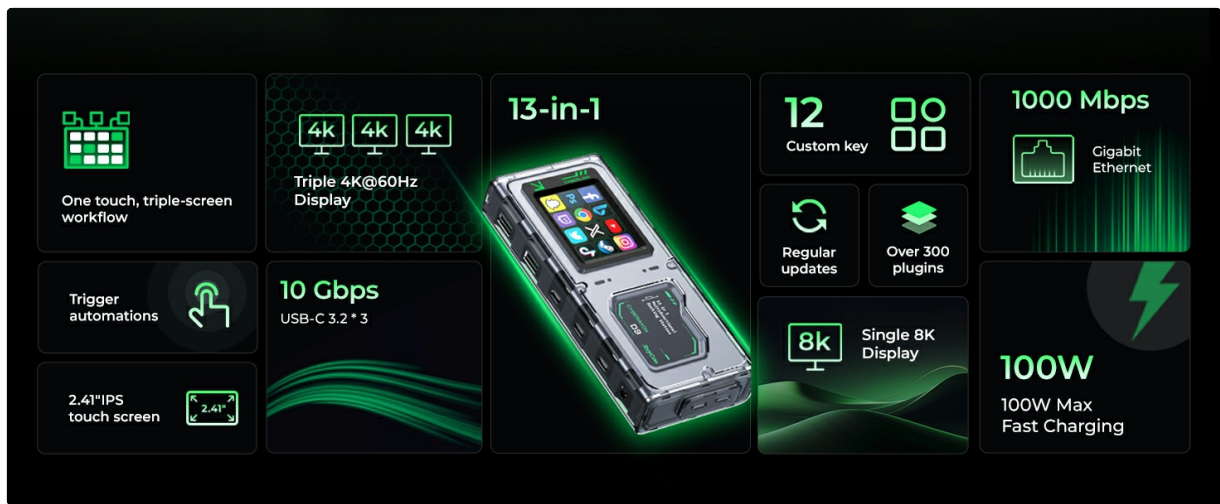
Figure 2: Overview of CyberAxon D3's 13-in-1 features, highlighting 2.4-inch IPS touchscreen, 12 custom keys, triple 4K@60Hz display, single 8K display, 10Gbps USB-C 3.2, 100W Max Fast Charging, and 1000 Mbps Gigabit Ethernet.