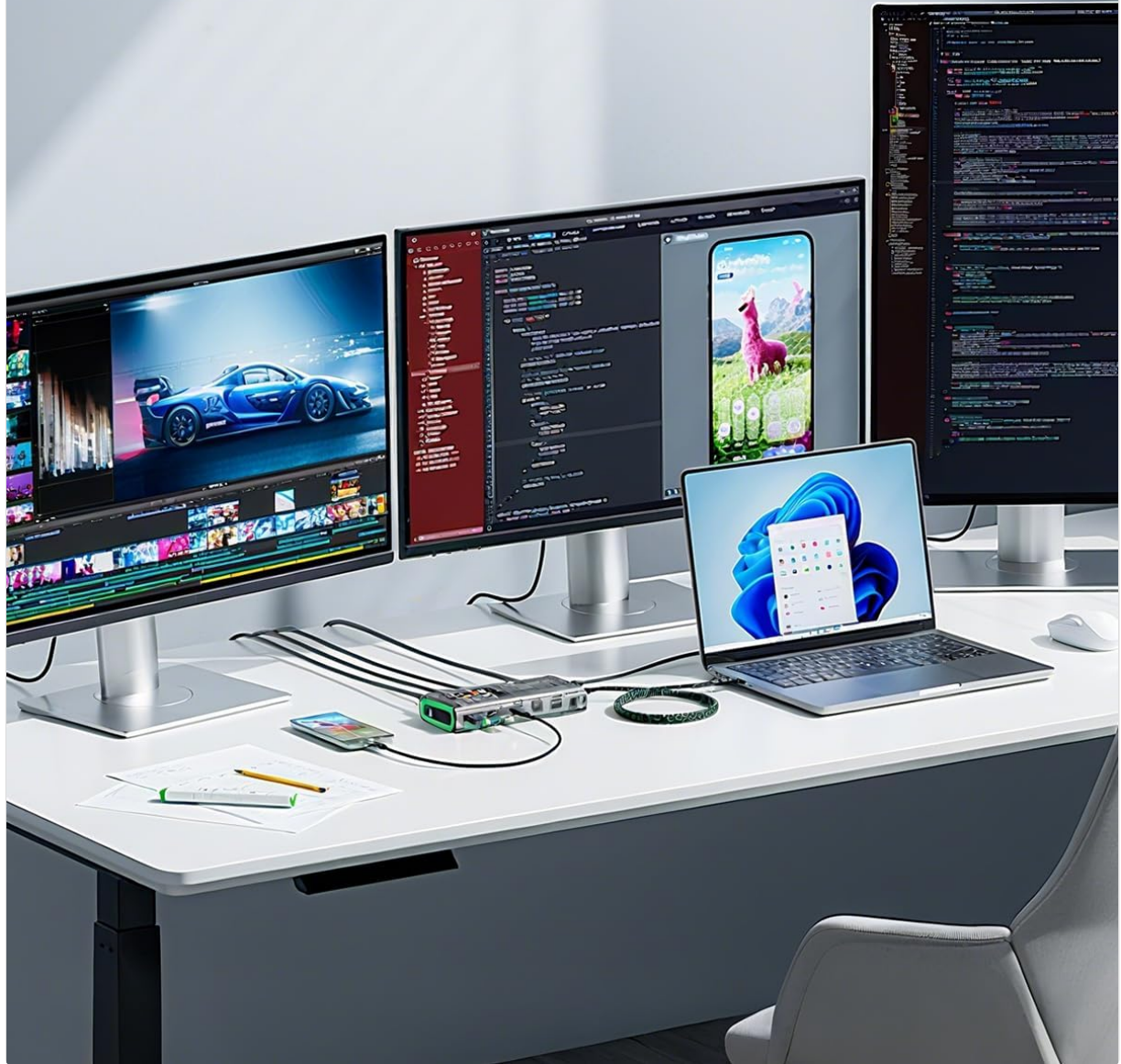
Figure 5: A laptop is connected to three external 4K displays, demonstrating the triple 4K display support for an immersive visual experience.