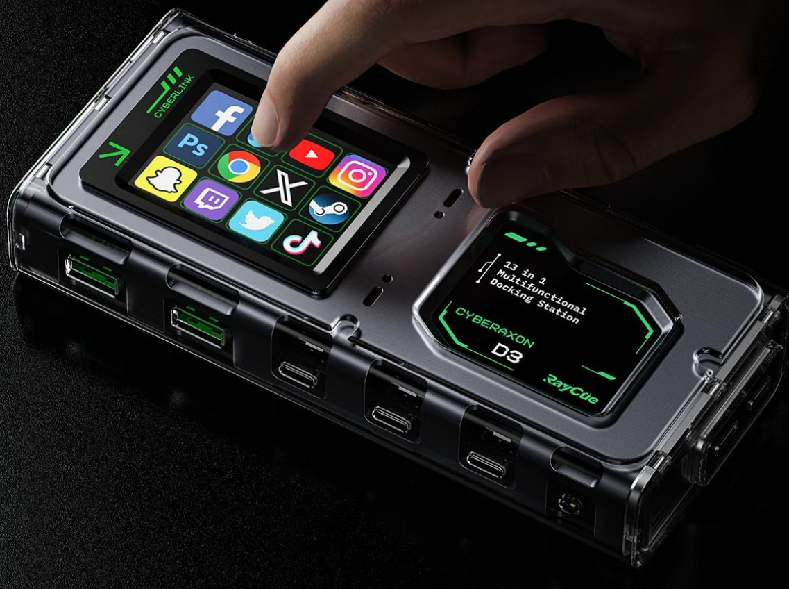
Figure 3: A hand demonstrates interaction with the 2.4-inch IPS touchscreen, showing various application icons for quick access.