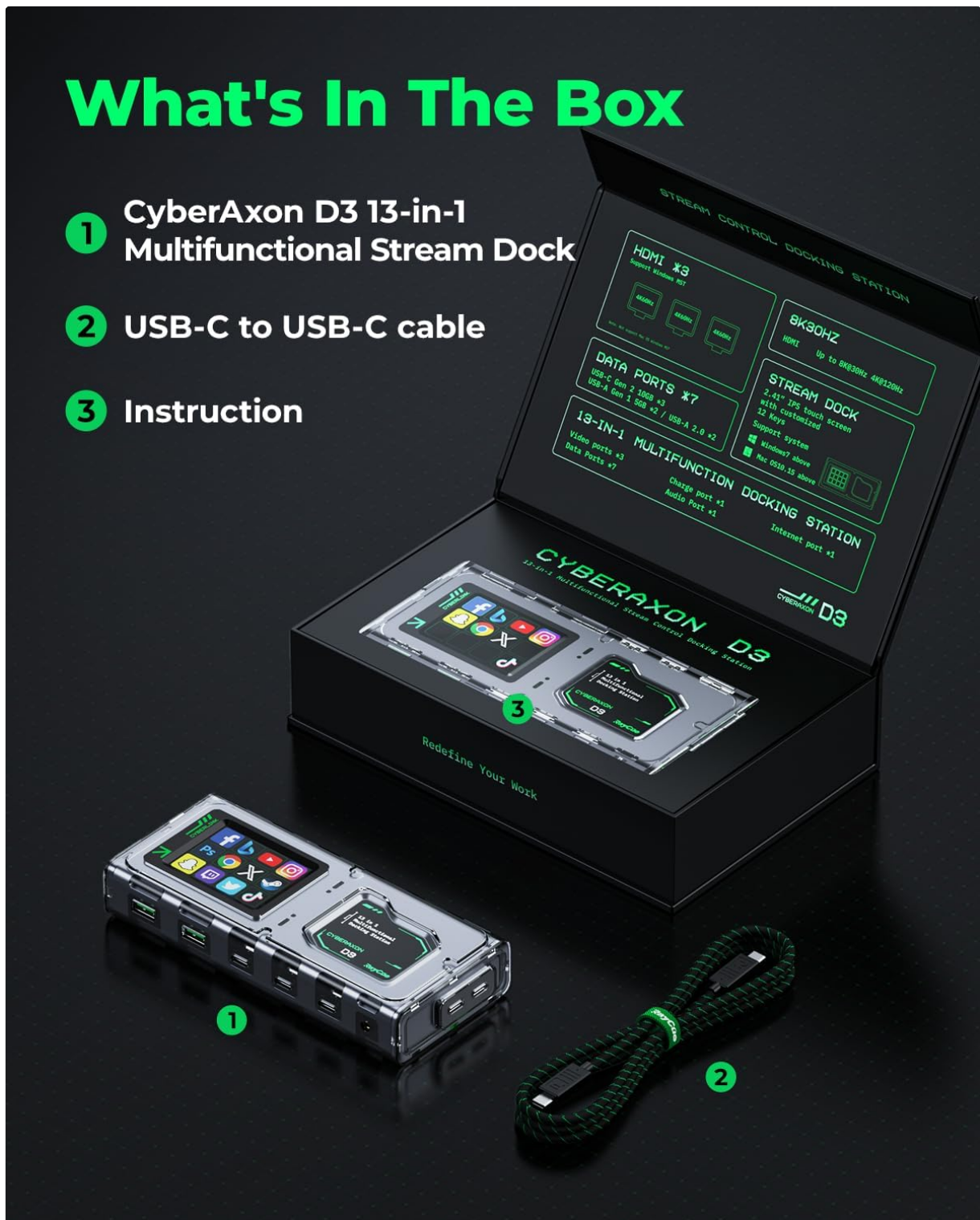
Figure 7: The CyberAxon D3 box contents, including the dock, USB-C cable, and instruction manual.