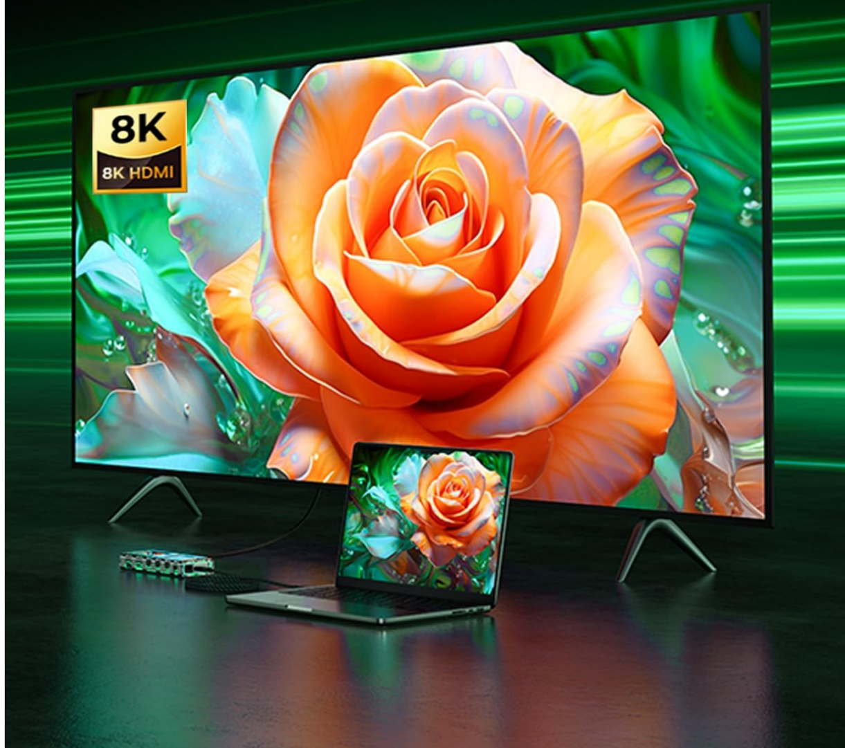
Figure 4: A laptop is connected to a large 8K display, showcasing the single 8K display output capability of the CyberAxon D3.