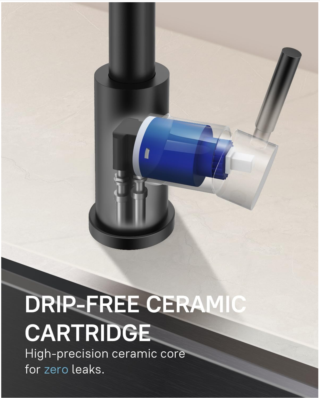
Image Description: A cutaway view of the faucet's base reveals the internal drip-free ceramic cartridge, which is crucial for preventing leaks and ensuring smooth operation of the water flow and temperature control.