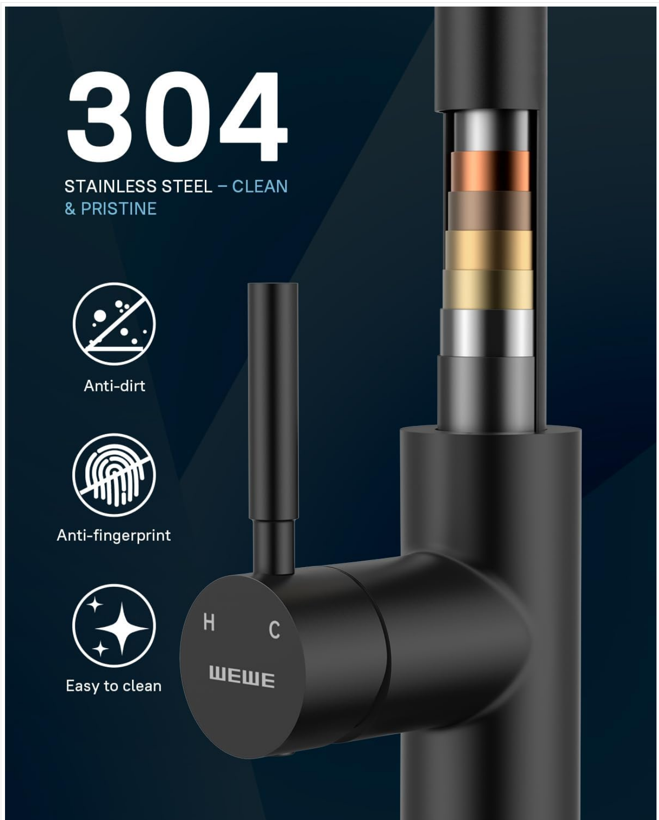
Image Description: This image emphasizes the faucet's construction from 304 Stainless Steel. It features icons representing its anti-dirt, anti-fingerprint, and easy-to-clean characteristics, indicating its durability and low-maintenance design.