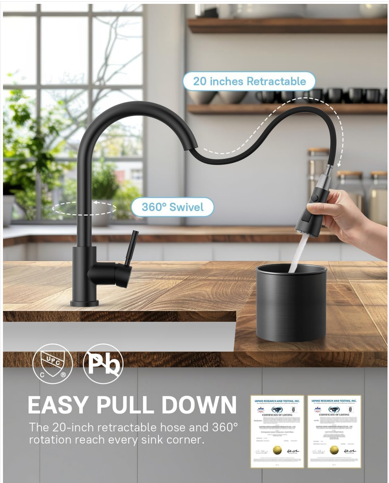
Image Description: This image illustrates the faucet's pull-down sprayer in use, extended from the main body. It highlights the 20-inch retractable hose and the 360-degree swivel feature, which allows the sprayer to reach all areas of the sink for convenience.

The faucet features a pull-down sprayer with a 20-inch retractable hose and 360-degree swivel capability, allowing for flexible use around the sink.