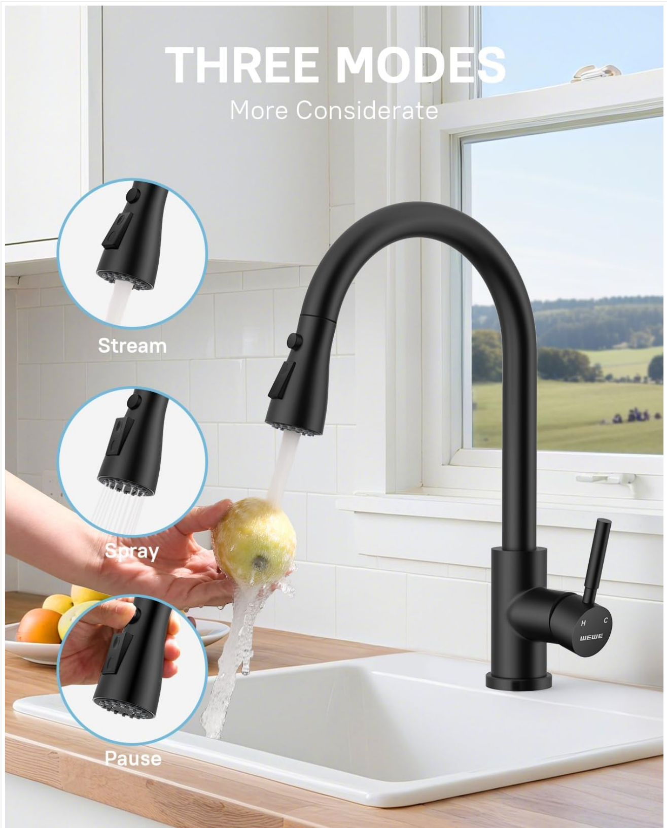
Image Description: This image displays the faucet's sprayer head, clearly indicating the three available water modes: Stream, Spray, and Pause. Each mode is represented by an icon, demonstrating the versatility of the sprayer for various kitchen tasks.