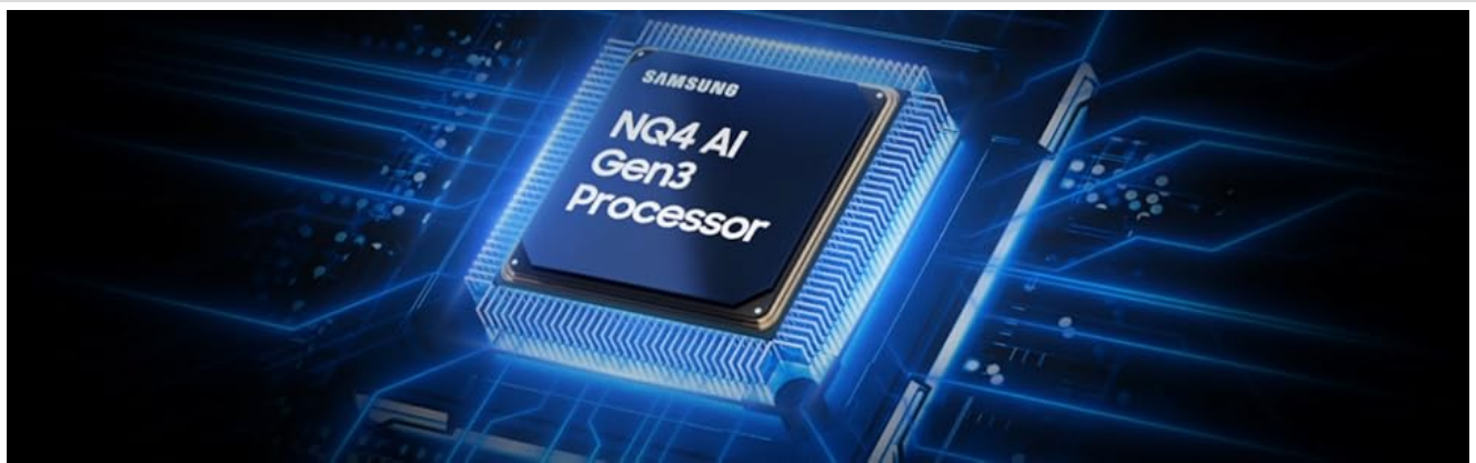
Figure 4.1: The NQ4 AI Gen3 Processor enhances picture and sound.

The NQ4 AI Gen3 Processor, powered by 128 neural networks, delivers AI-enhanced picture and optimized sound. This results in an exceptional 4K experience for streaming, gaming, live sports, and more, with features like 4K AI Upscaling Pro and Color Booster Pro.