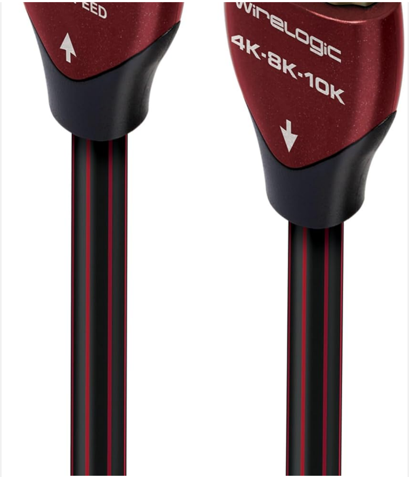
Figure 2.2: The included WireLogic Ruby 8ft Ultra High Speed HDMI Cable.