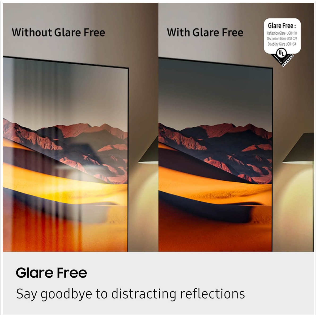
Figure 4.2: Visual comparison demonstrating the effectiveness of the Glare Free display.