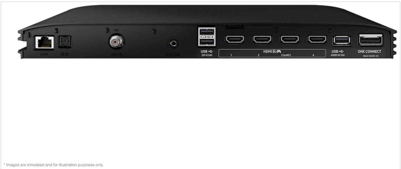
Figure 2.1: Rear view of the TV with various input ports, including HDMI, USB, LAN, and optical audio.

Connect your external devices such as cable boxes, Blu-ray players, or gaming consoles to the TV's input ports. This TV features 4 HDMI ports, including HDMI 2.1 for high-speed connections, 3 USB-A ports, and 1 USB-C port.