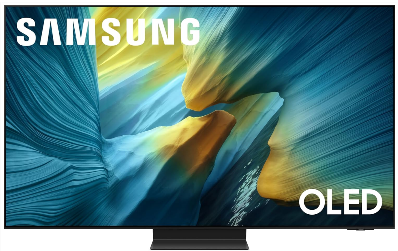
Figure 1.1: Front view of the Samsung QN83S95FAEXZA 83 Inch OLED HDR Pro 4K Smart TV.

This manual provides essential information for the setup, operation, and maintenance of your Samsung QN83S95FAEXZA 83 Inch OLED HDR Pro 4K Smart TV. Please read this manual thoroughly before using your television to ensure safe and optimal performance. Keep this manual for future reference.