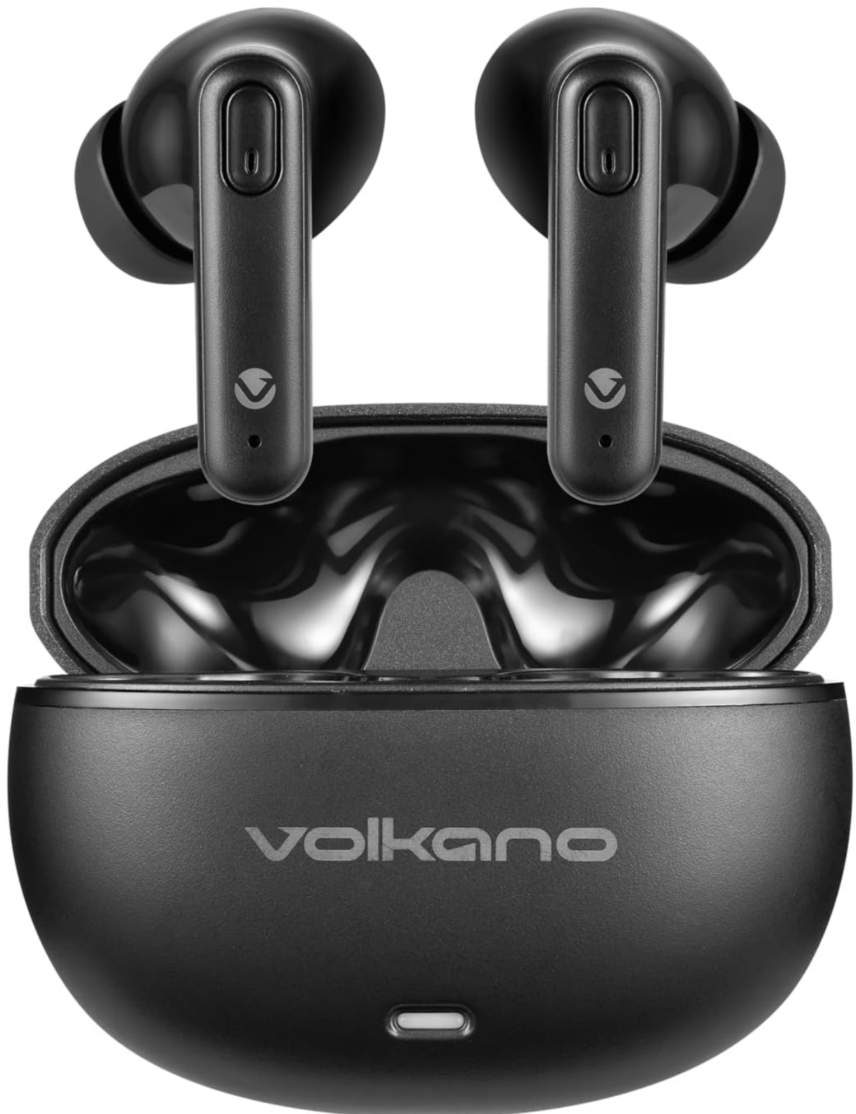
Image 3.1: The Volkano VK-1164-BK earphones resting inside their open charging case. The earbuds are black with a sleek design, and the case is also black with the 'volcano' logo on the front.

Familiarize yourself with the components of your Volkano VK-1164-BK earphones and charging case.