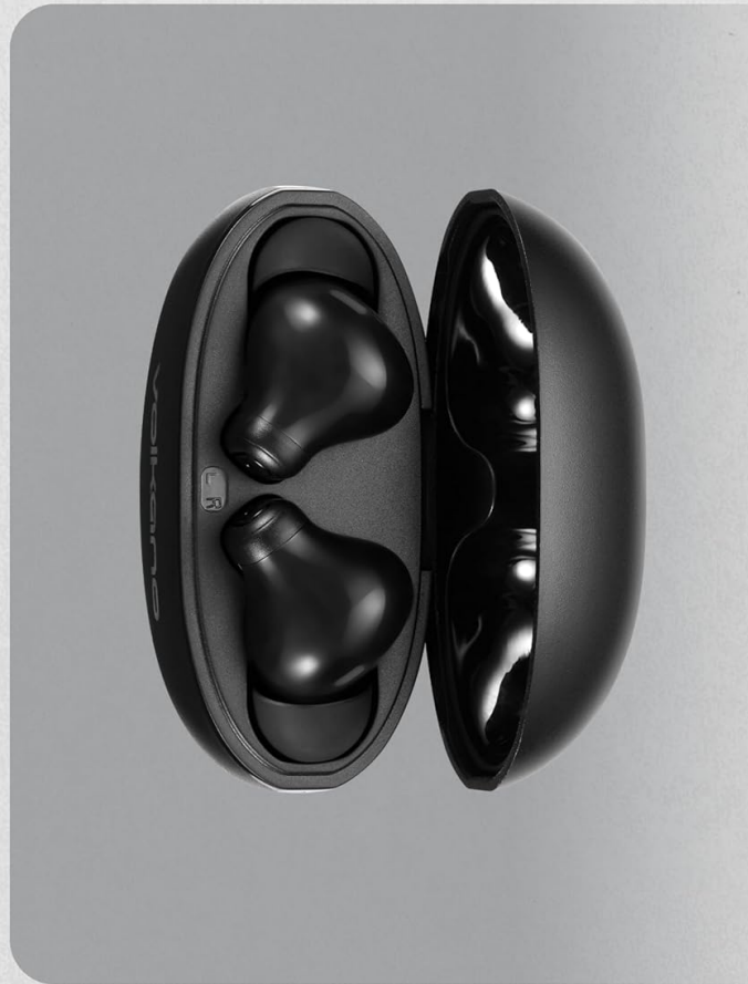
Image 8.1: A graphic illustrating key specifications of the Volcano VK-1164-BK earphones, including Bluetooth Version 5.4, up to 28 hours playtime, Dual Mic ENC, compatibility with Google & Siri, Environmental Noise Cancelling, and a 2-hour charge time.