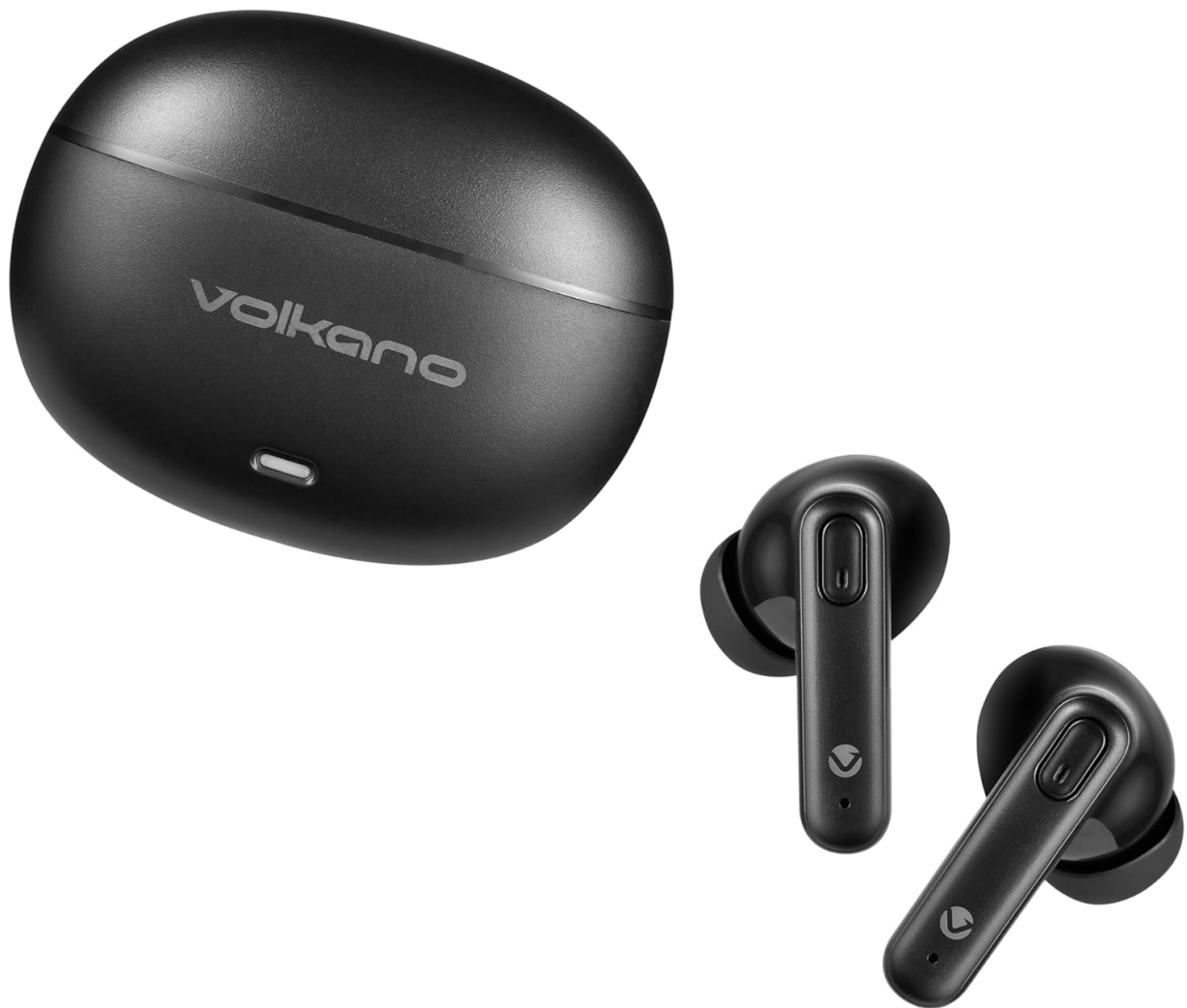
Image 3.2: The two Volkano VK-1164-BK earphones are shown outside their closed charging case. The case is a smooth, oval-shaped black unit with the 'volcano' logo, and the earbuds are also black, featuring a stem design with ear tips.