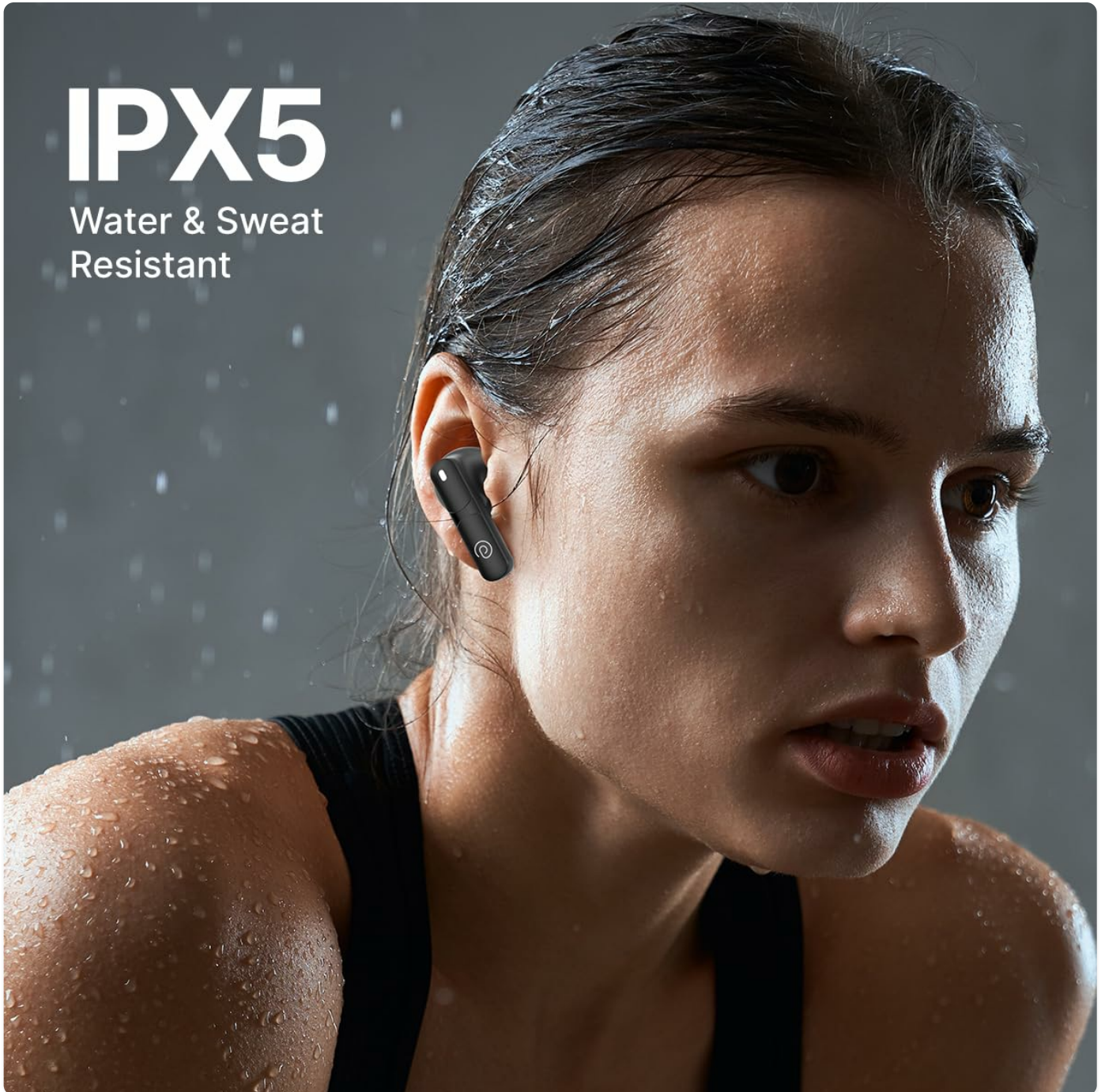
Image: Diagram showing the ergonomic fit of the earbuds in the ear.