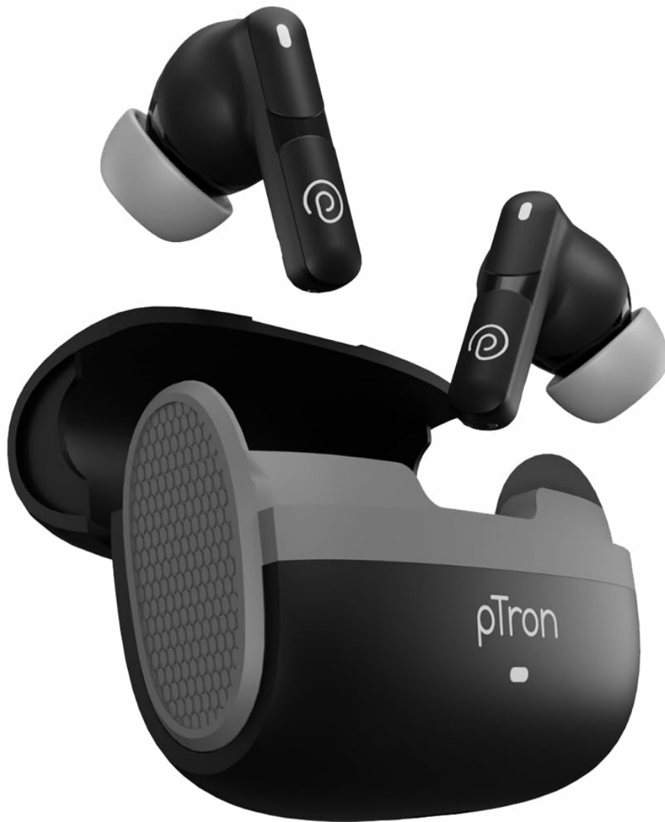
Image: pTron Bassbuds Blaze TWS Earbuds and their charging case.