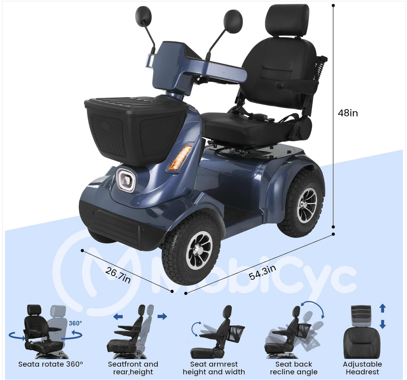
Image: The Mobicyc MS09 MAX showing its dimensions and various adjustable components including seat rotation, seat front/rear height, armrest height/width, seat back recline angle, and adjustable headrest.