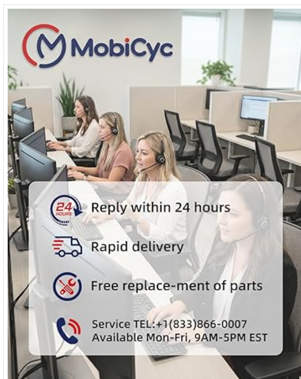
Image: Mobicyc customer support details, including a promise for replies within 24 hours, rapid delivery, free replacement of parts, and the

Availability: Monday - Friday, 9 AM - 5 PM EST