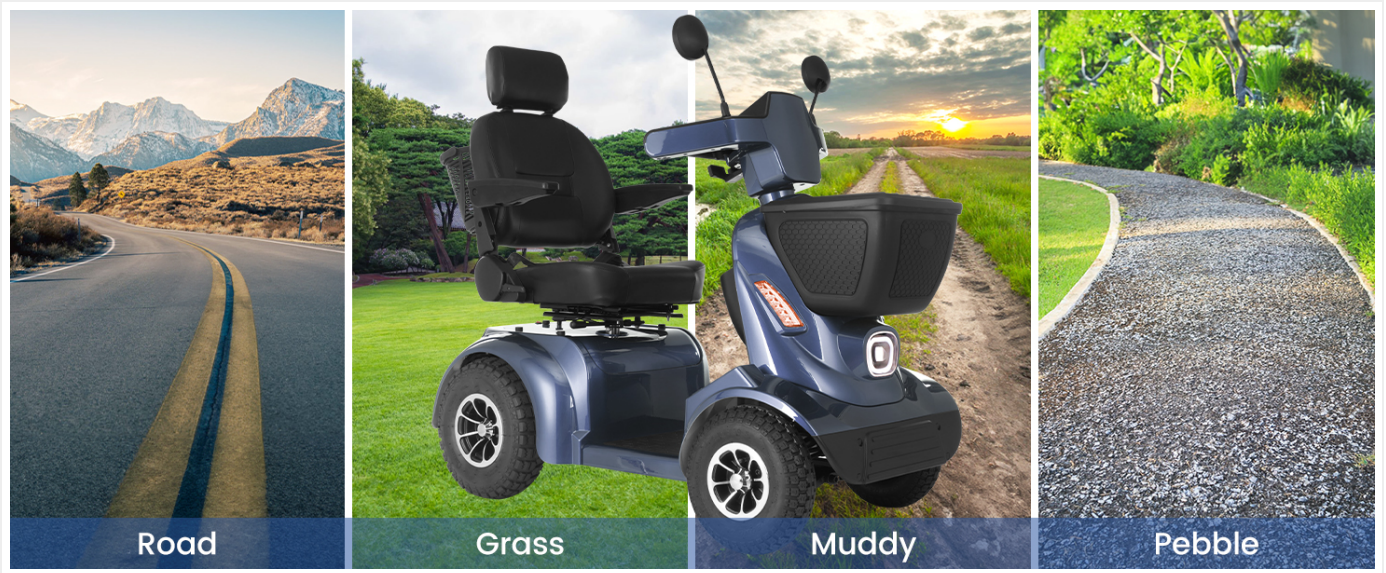
Image: The Mobicyc MS09 MAX scooter demonstrating its capability on different terrains such as road, grass, muddy paths, and pebble surfaces.