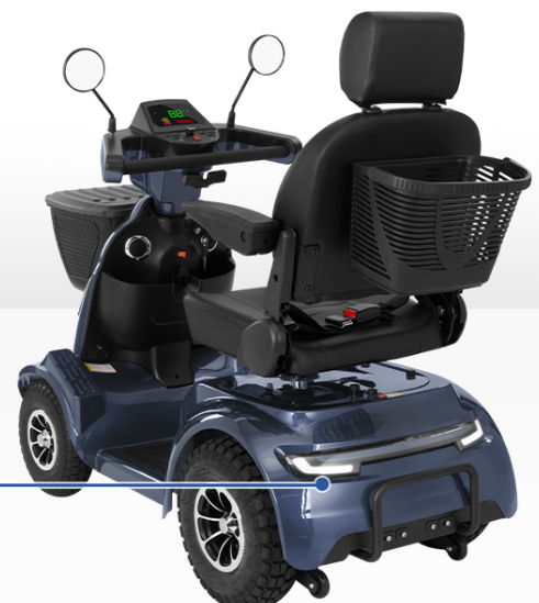
Image: The Mobicyc MS09 MAX scooter showcasing its full LED lighting package, including vehicle turn indicator lights, LED running light, and brake light, ensuring a safe driving experience.