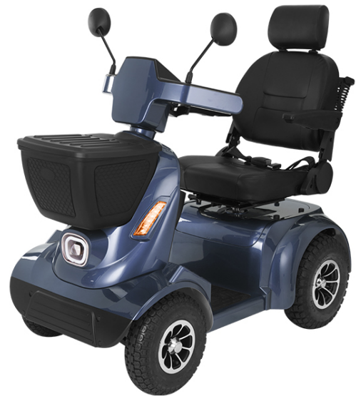
Image: The Mobicyc MS09 MAX scooter, illustrating its high-performance brushless motor, 500 lbs load capacity, 1000W brushless motor, 32 miles max range, and 48V 40AH battery capacity.