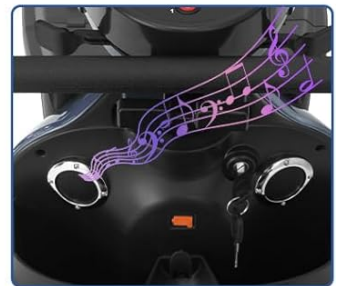
Image: The Mobicyc MS09 MAX scooter showcasing its integrated features: a USB charging port, a front storage box, a removable rear basket, and a built-in Bluetooth speaker for music and voice navigation.