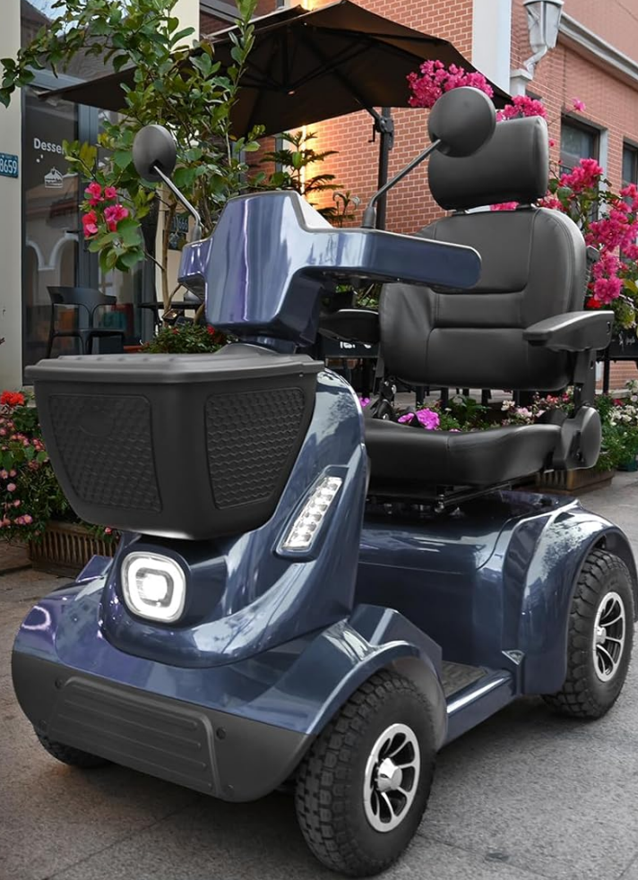
Image: The Mobicyc MS09 MAX scooter, highlighting its powerful motor, 500 lbs maximum load capacity, 32 miles maximum range, 1000W power motor, and built-in Bluetooth speaker.