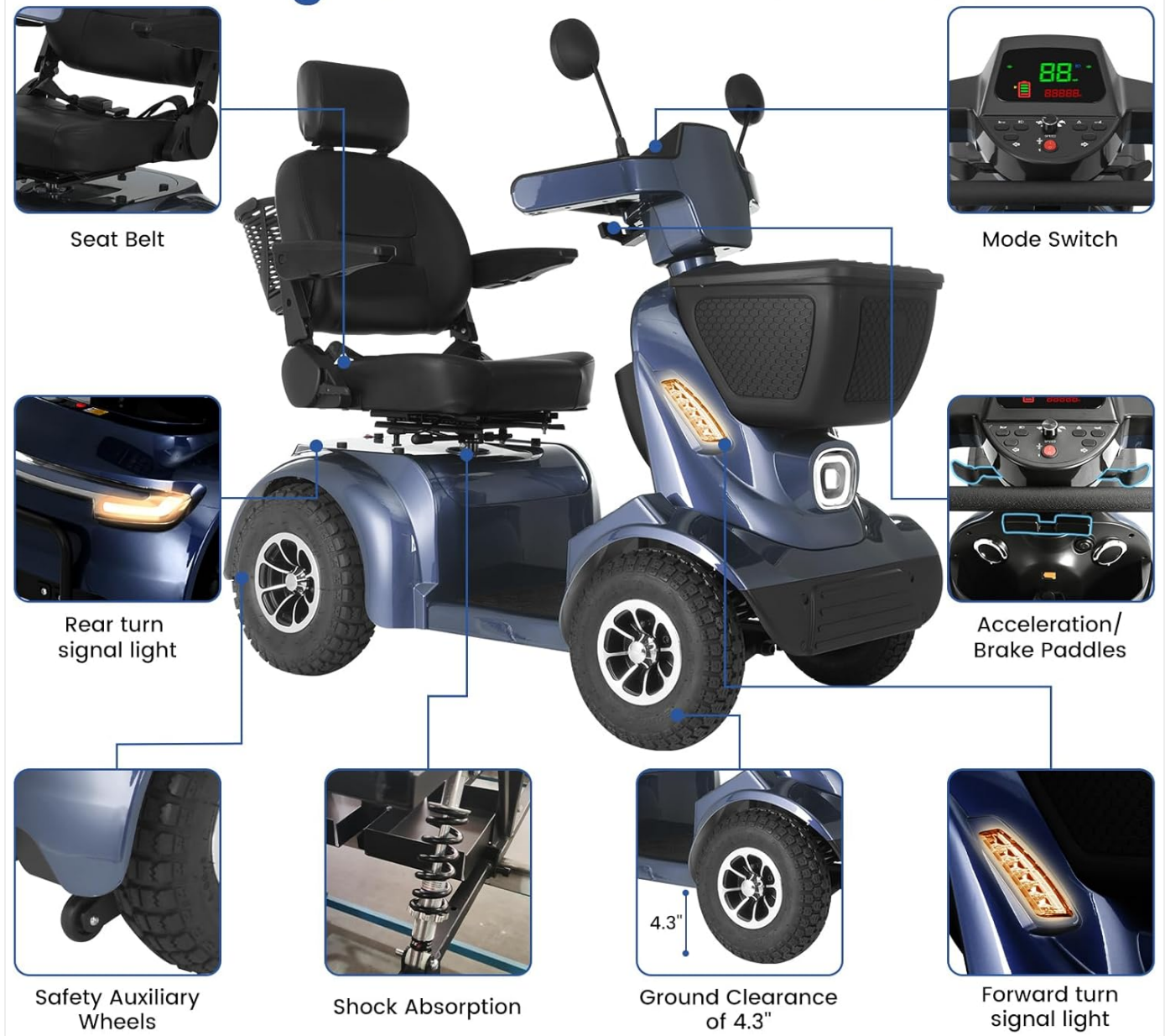
Image: An overview of the Mobicyc MS09 MAX scooter's intelligent safety system, pointing out features such as the seat belt, mode switch, acceleration/brake paddles, rear turn signal light, safety auxiliary wheels, shock absorption system, ground clearance, and forward turn signal light.