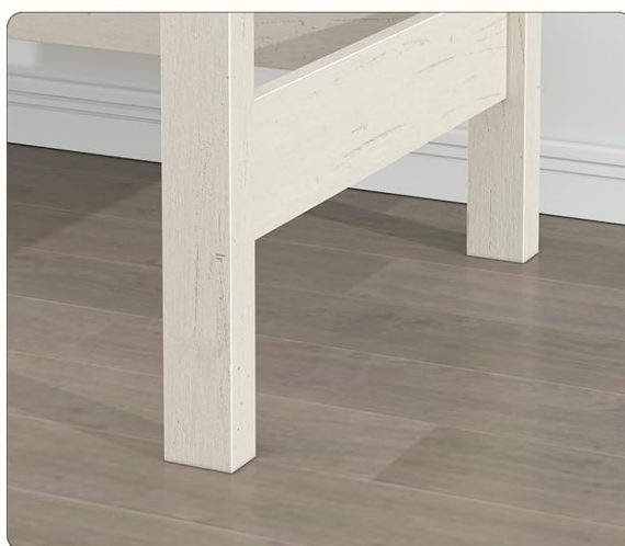
4 Sturdy Legs