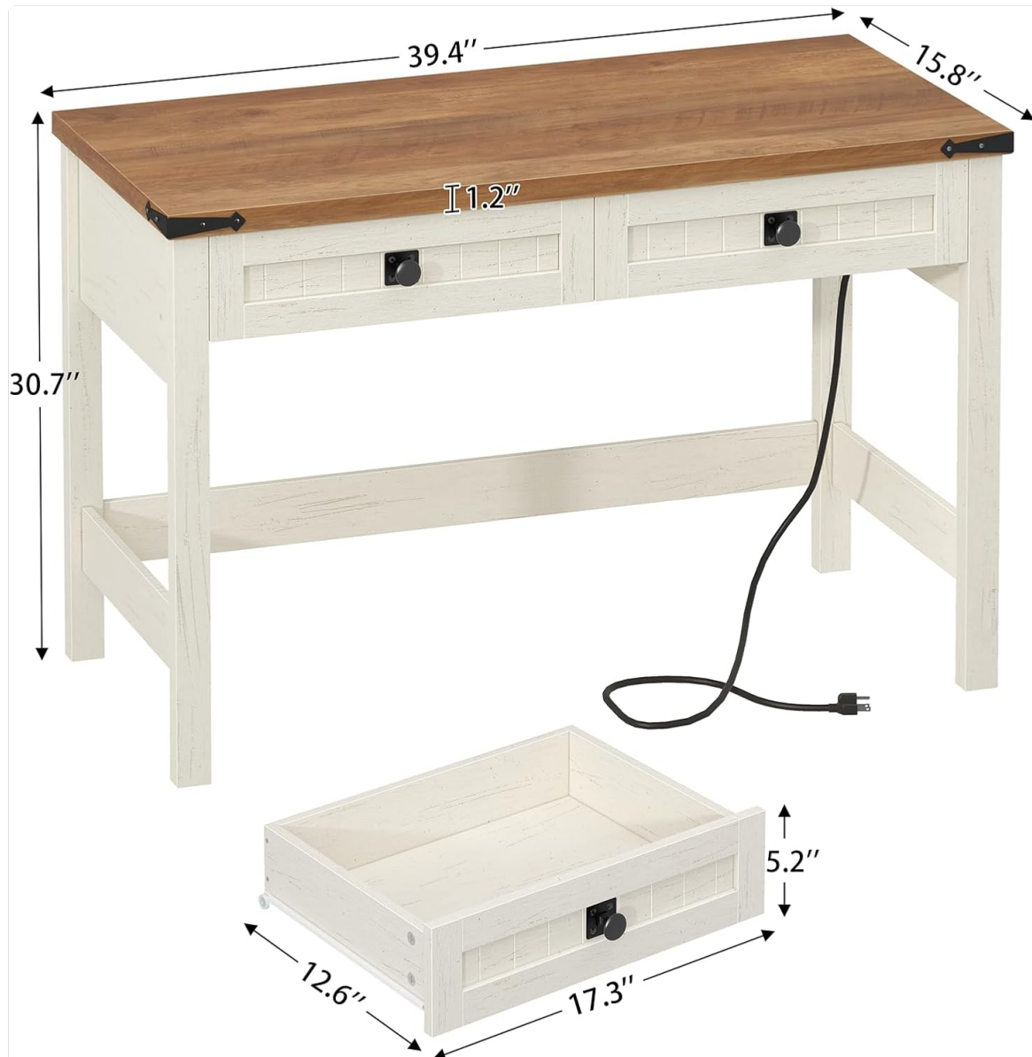
Figure 2.1: Overall and drawer dimensions of the desk.