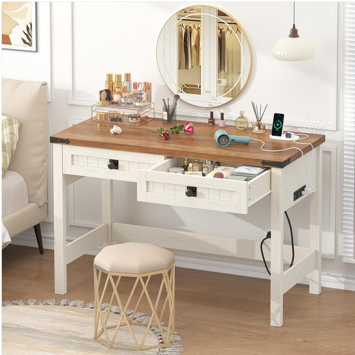
Figure 6.1: The desk's surface is designed to be waterproof and dirt-repellent.