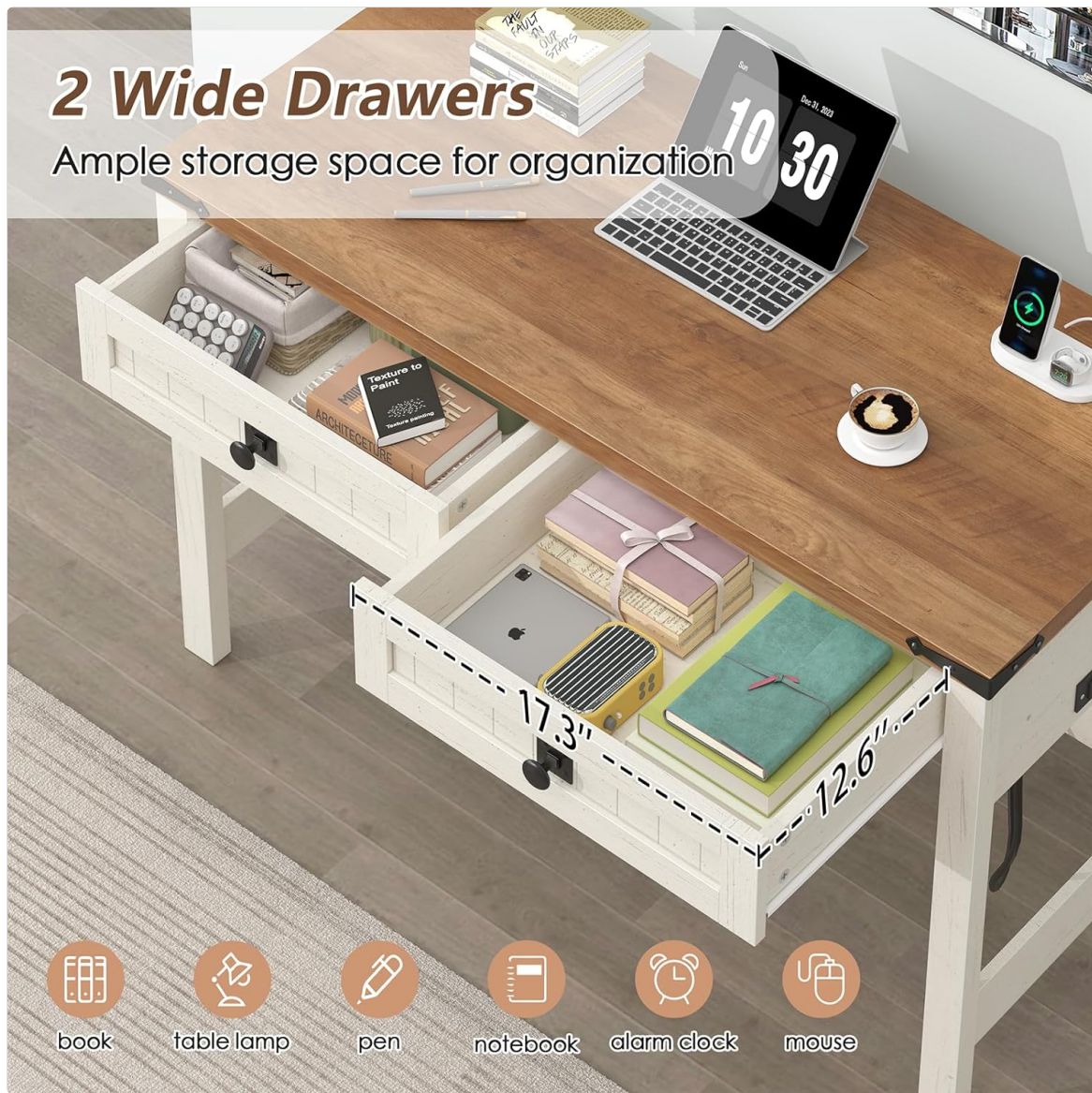
Figure 5.2: Drawers providing storage for office essentials.