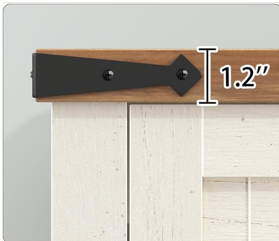
1.2-Inch Thick Desktop

manual for a detailed parts list and hardware count.