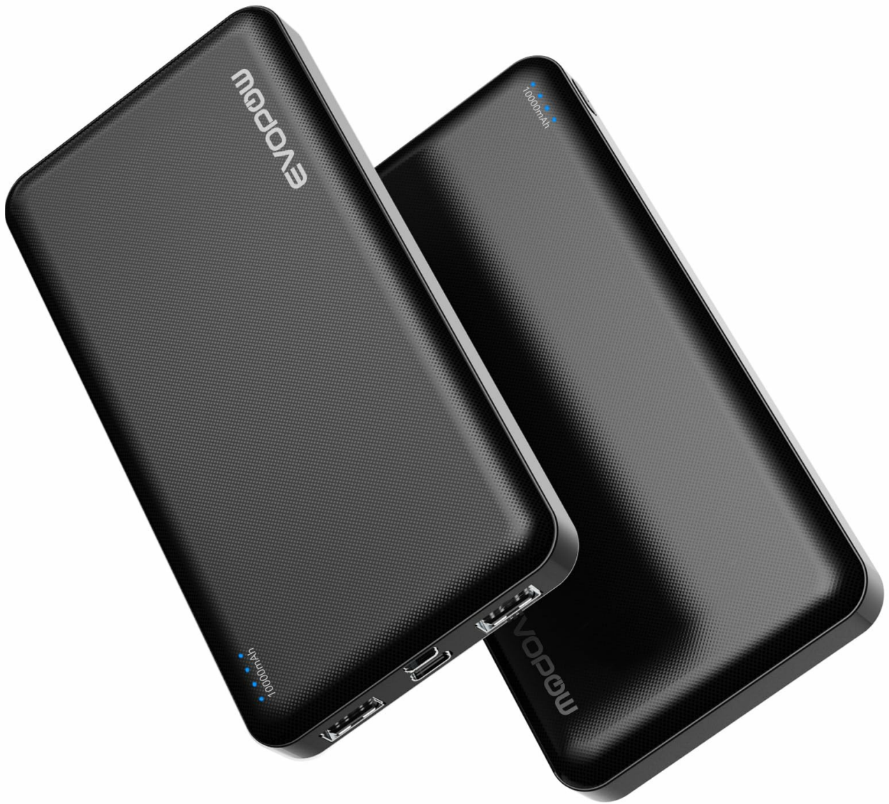
Evopow M5 Portable Power Bank and packaging contents.

The Evopow M5 portable charger is a compact and efficient solution for keeping your devices powered. It features a slim design, multiple charging ports, and advanced safety protections.