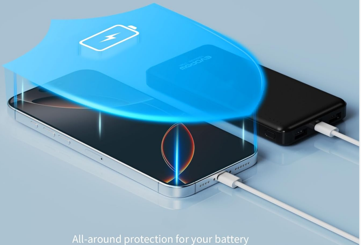
Recharging the Evopow M5 power bank using a USB-C cable.