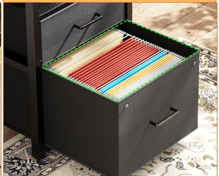
Letter Size File Drawer