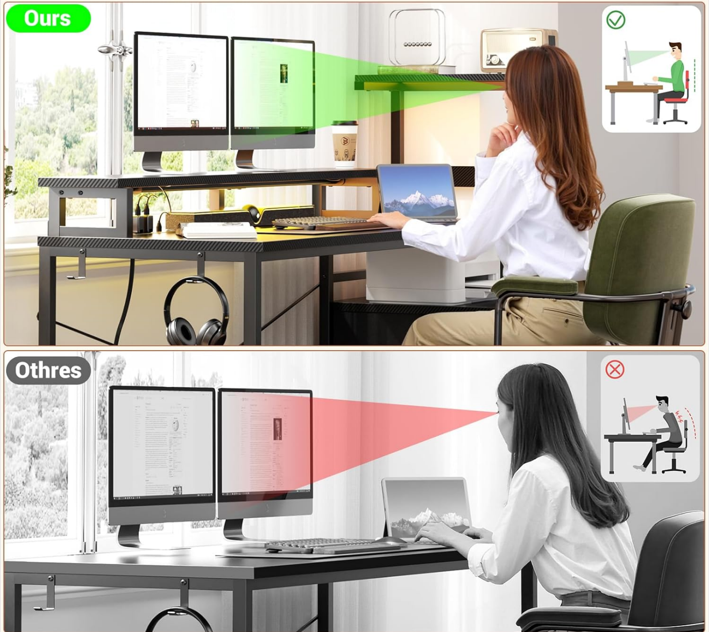
Figure 6: The monitor stand promotes correct sitting posture and reduces neck strain.

Keep Your Sitting Posture Correct and Reduce Neck Sore