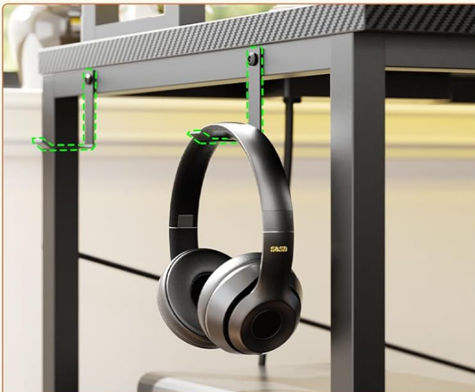
Desk Side Hooks