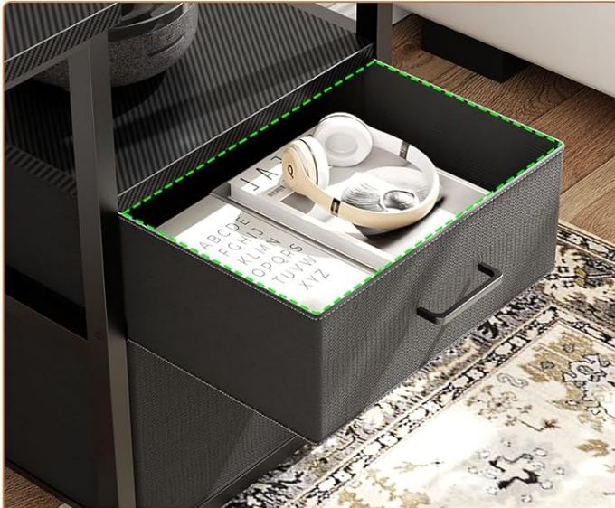
Storage Fabric Drawers