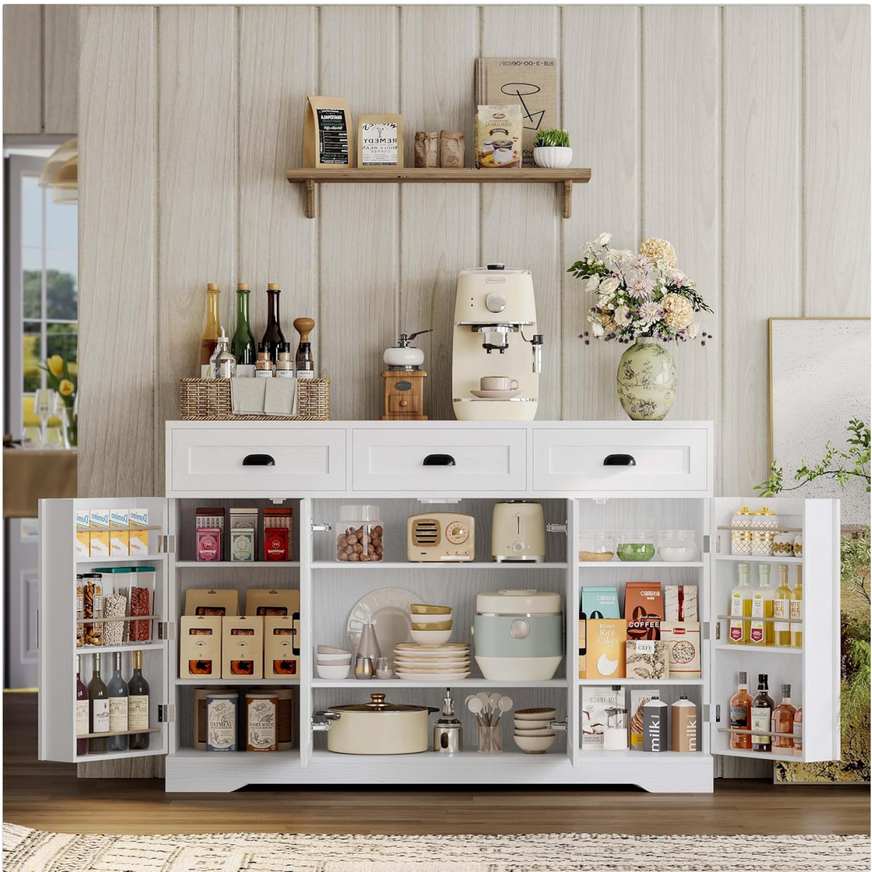
Image: Fully assembled IRONCK Buffet Cabinet, showcasing its storage capabilities.