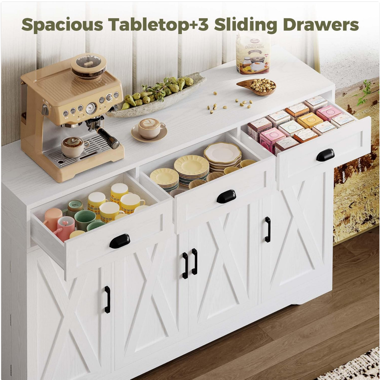
Image: The three sliding drawers, demonstrating their capacity for various items.