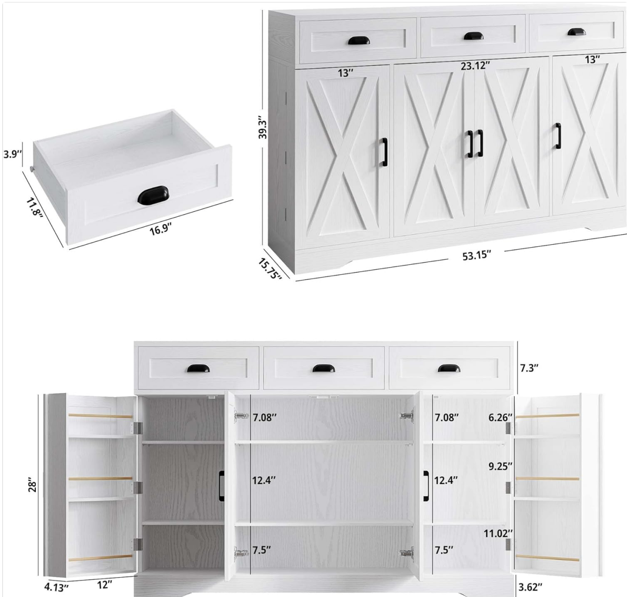
Image: Dimensional diagram of the IRONCK Buffet Cabinet, illustrating key measurements.