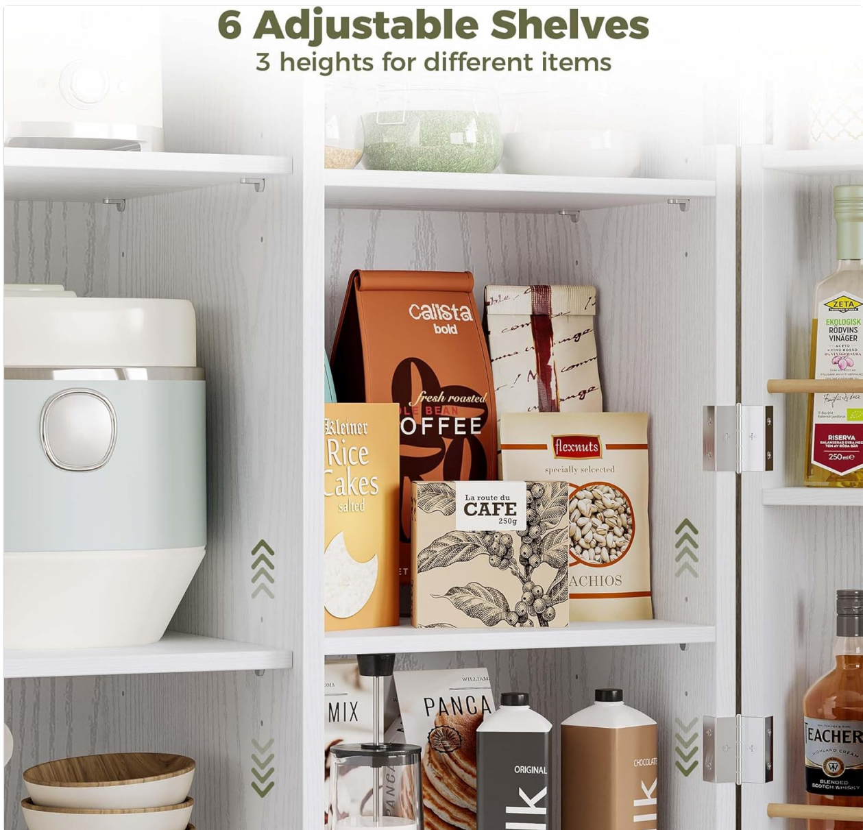
Image: Adjustable shelves within the cabinet, highlighting their flexibility for different item sizes.