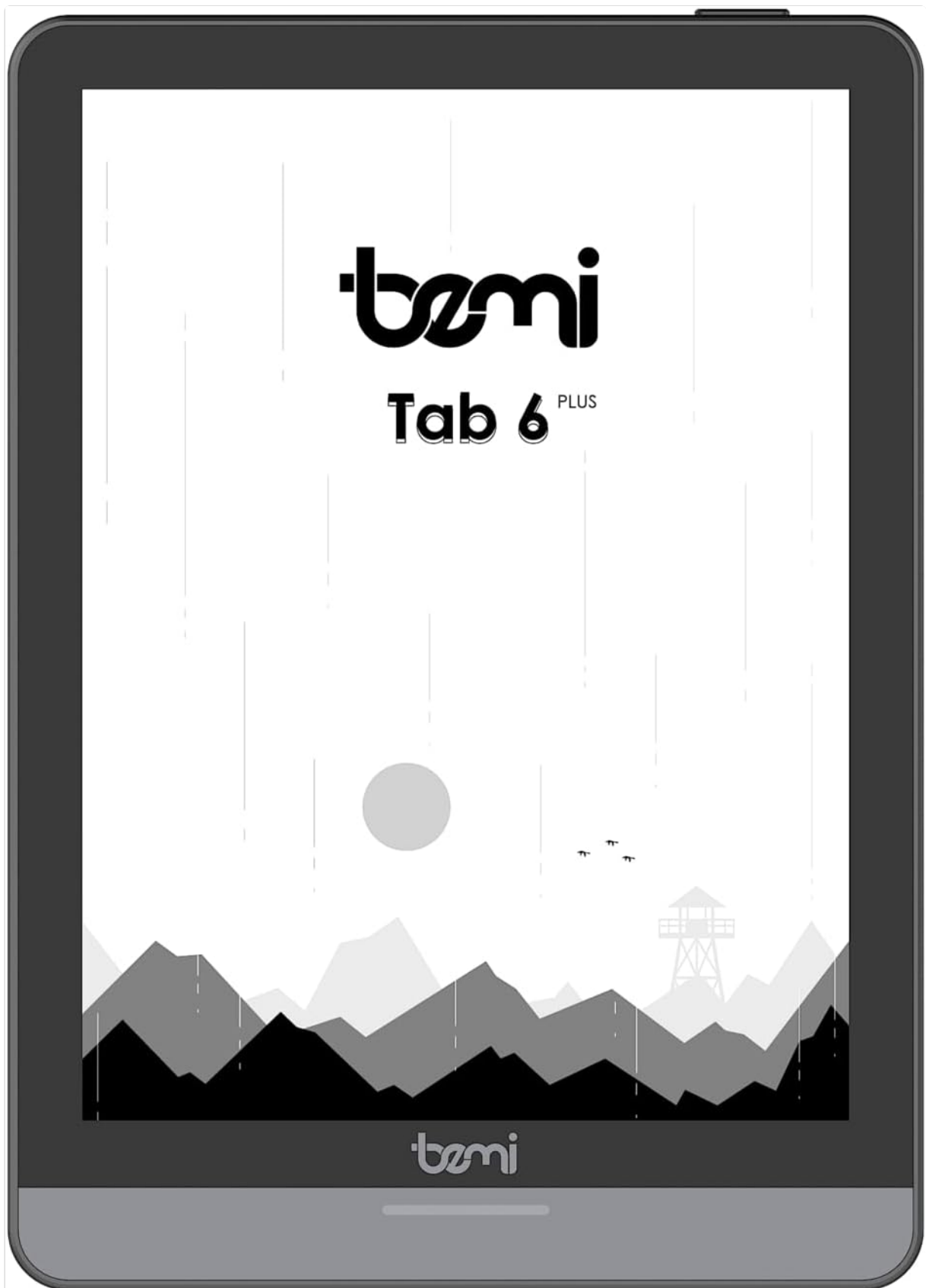
Figure 2.1: Front view of the Bemi Cognita Tab 6+ E-Reader. The device features a 6-inch E-Ink display with the Bemi logo and model name visible. The screen is designed to mimic paper for a comfortable reading experience.