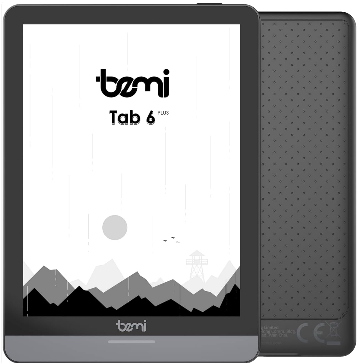
Figure 2.2: Front and back view of the Bemi Cognita Tab 6+ E-Reader. This image highlights the device's thin design and the textured back cover, which provides a secure grip.