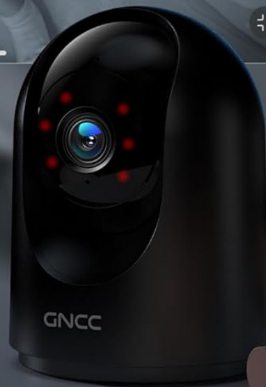
Image 2.1: A GNCC Indoor Security Camera providing a wide-angle view on a smartphone, illustrating its pan and tilt capabilities for comprehensive coverage.