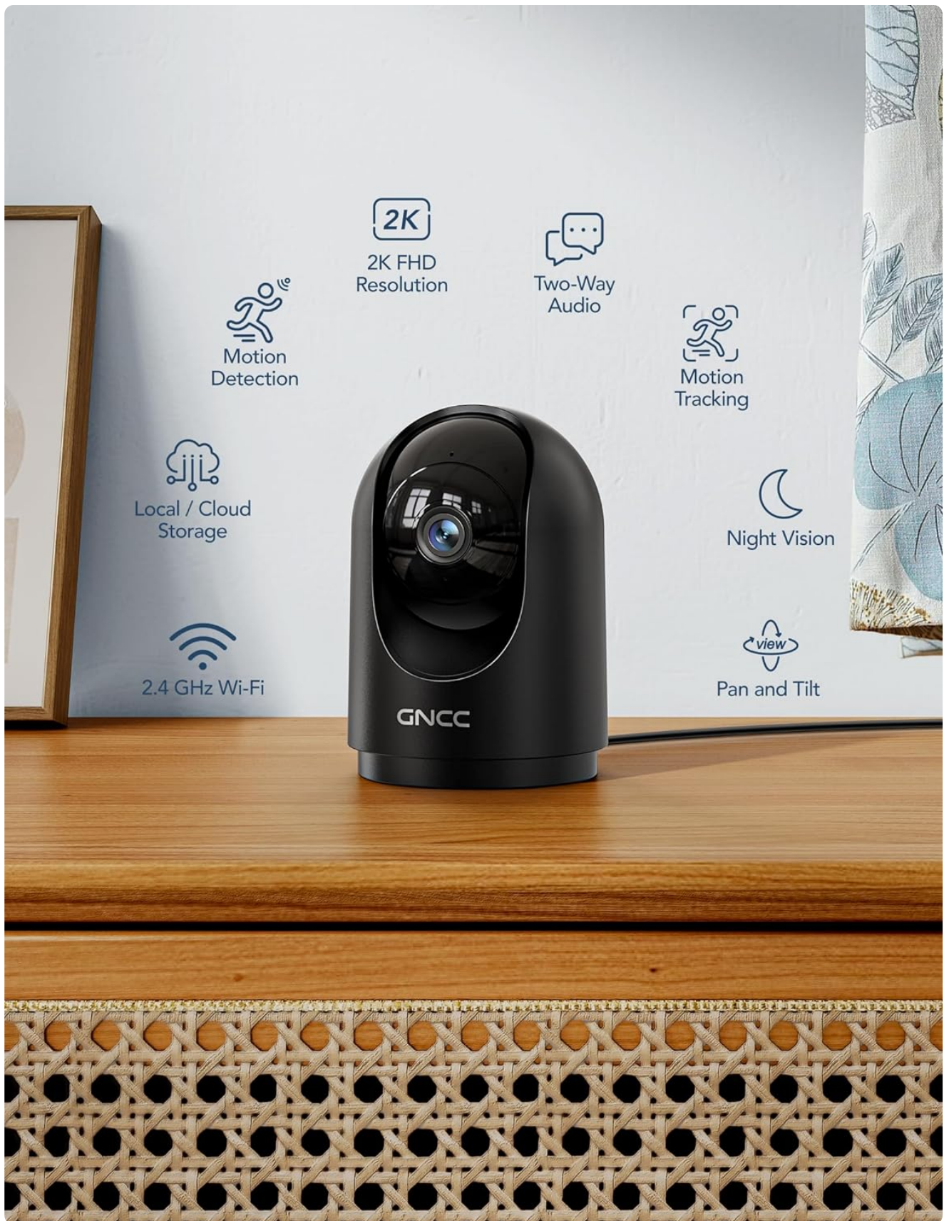
Image 1.1: The GNCC Indoor Security Camera with its charging cable, power adapter, wall mounting kit, and user manual.