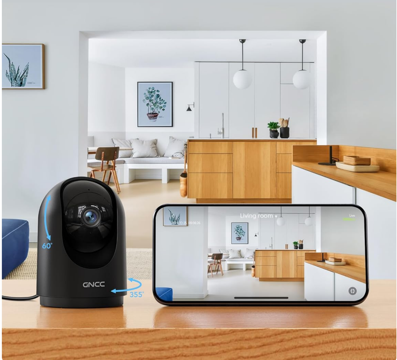
Image 1.2: A smartphone screen showing the OSAIO app, with controls for the GNCC Indoor Security Camera. This image illustrates the app interface for controlling the camera.

With 2K FHD live view 24/7, ensuring that nothing is missed.