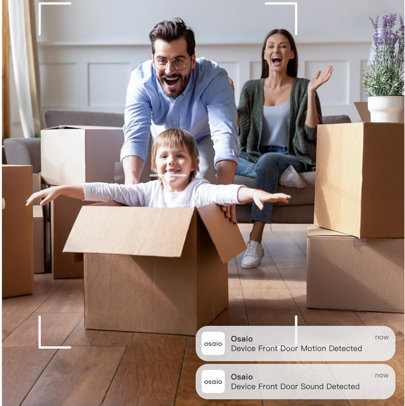
Image 2.3: A family scene with a child playing, overlaid with notifications from the OSAIO app indicating motion detection by the GNCC Indoor Security Camera.

Notifications will be sent when the camera detects motion.