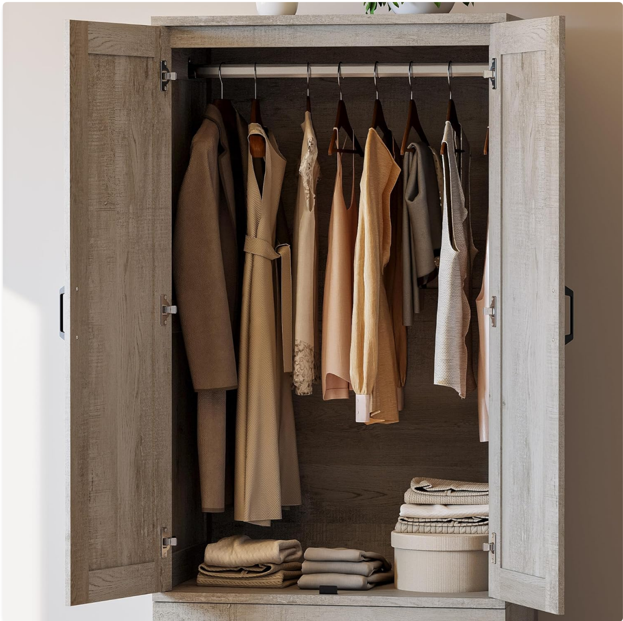
Image demonstrating the ample storage capacity of the wardrobe, suitable for various items like clothing, bedding, and accessories.