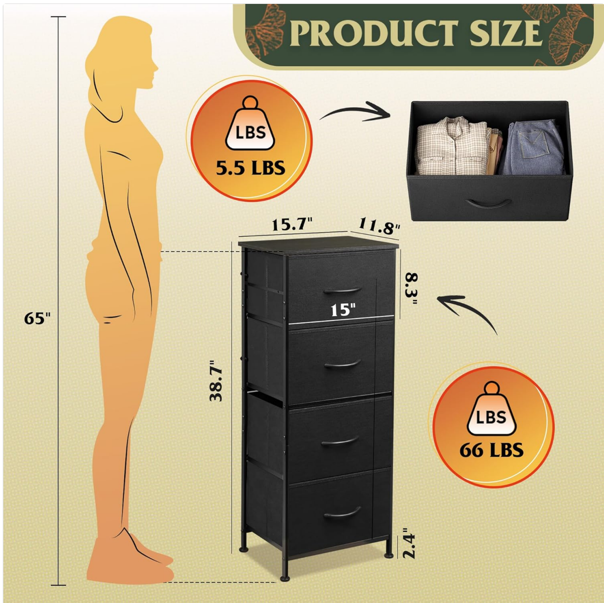
Image 5: Detailed dimensions and weight capacities for the dresser.