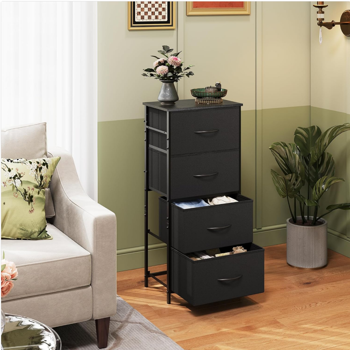
Image 1: Assembled dresser with drawers open, demonstrating storage space.