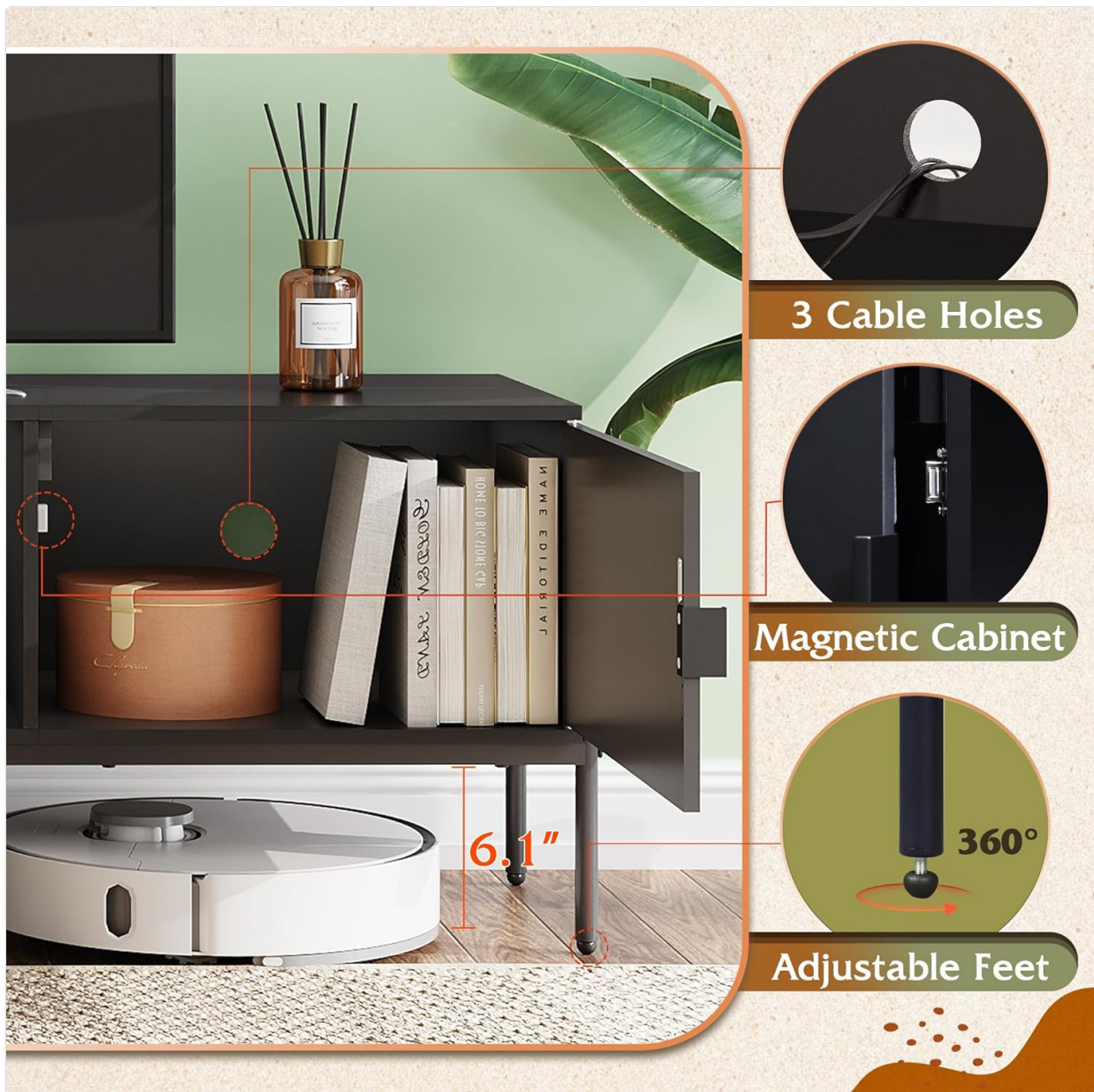
Image 4: Detailed view of the TV stand's cable management holes, magnetic cabinet closure, and adjustable feet.