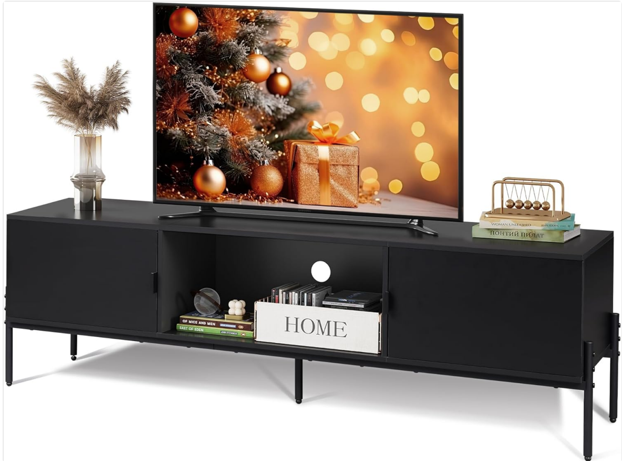
Image 3: Assembled TV stand with a television, showcasing its function.