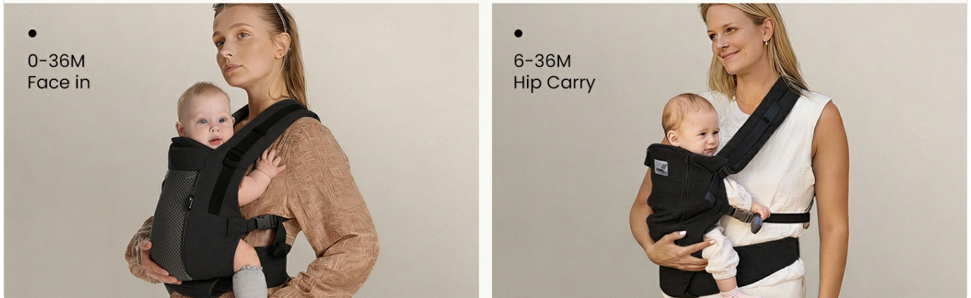
Figure 1: Proper M-shaped hip support for healthy baby development.