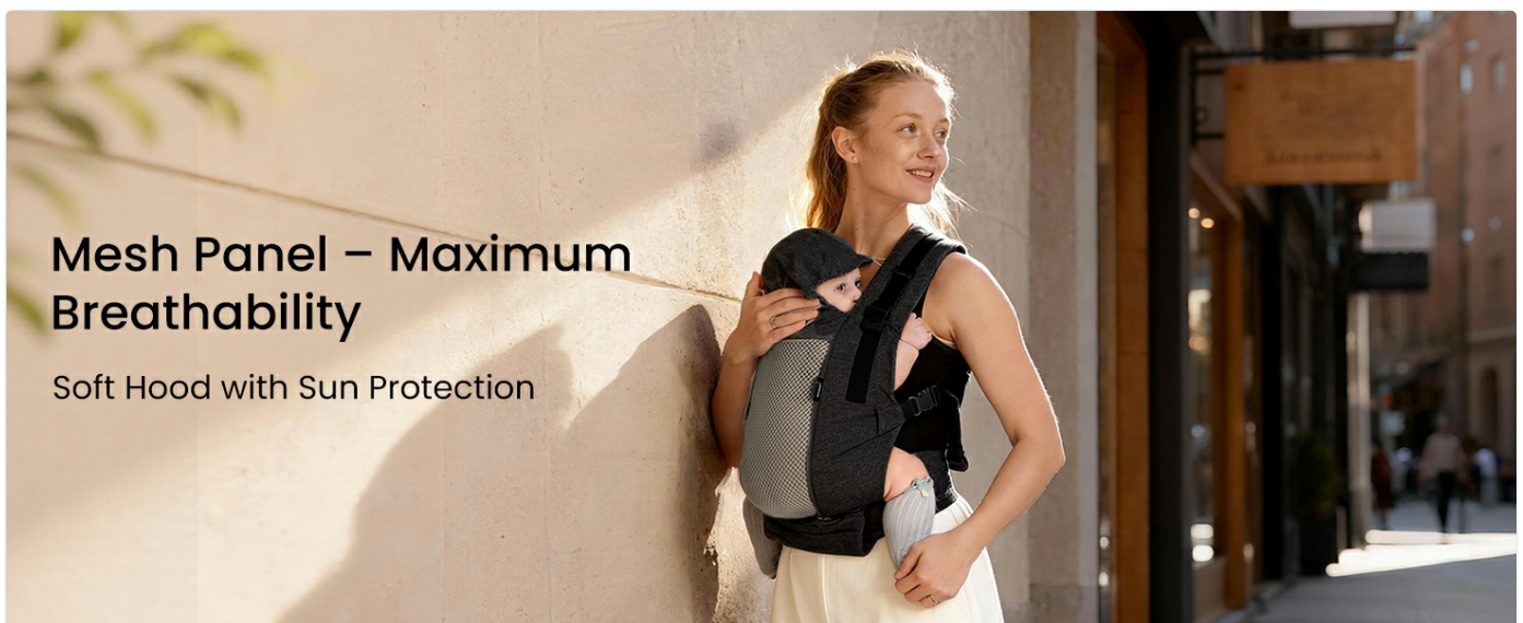
Figure 2: Key adjustment points and features of the GROWNSY Baby Carrier.