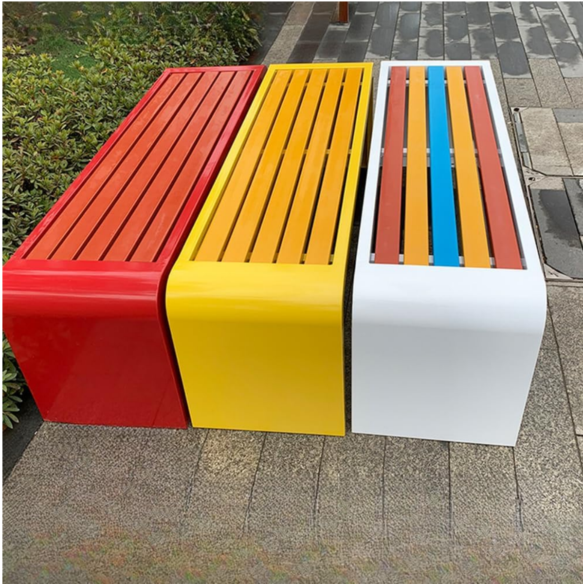
Figure 5.1: Multiple LITFAD Modish Park Benches in various colors. This image illustrates the bench's versatility and aesthetic appeal in an outdoor setting.