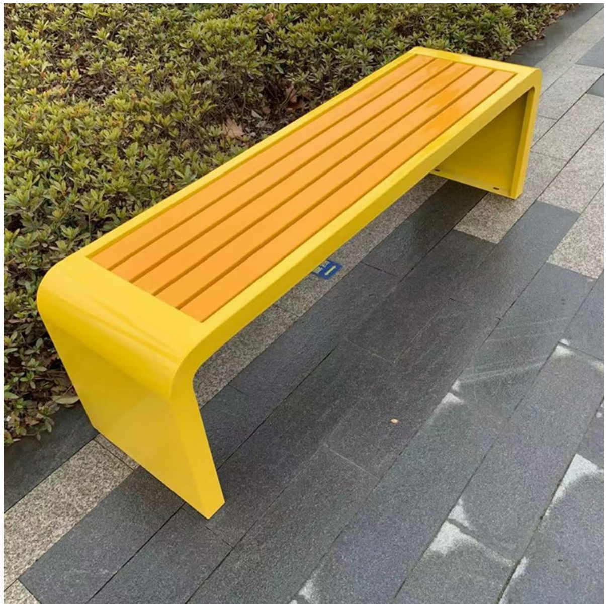
Figure 4.1: Assembled LITFAD Modish Park Bench. This image shows the complete bench, highlighting its yellow plastic wood seating and metal frame, ready for use.