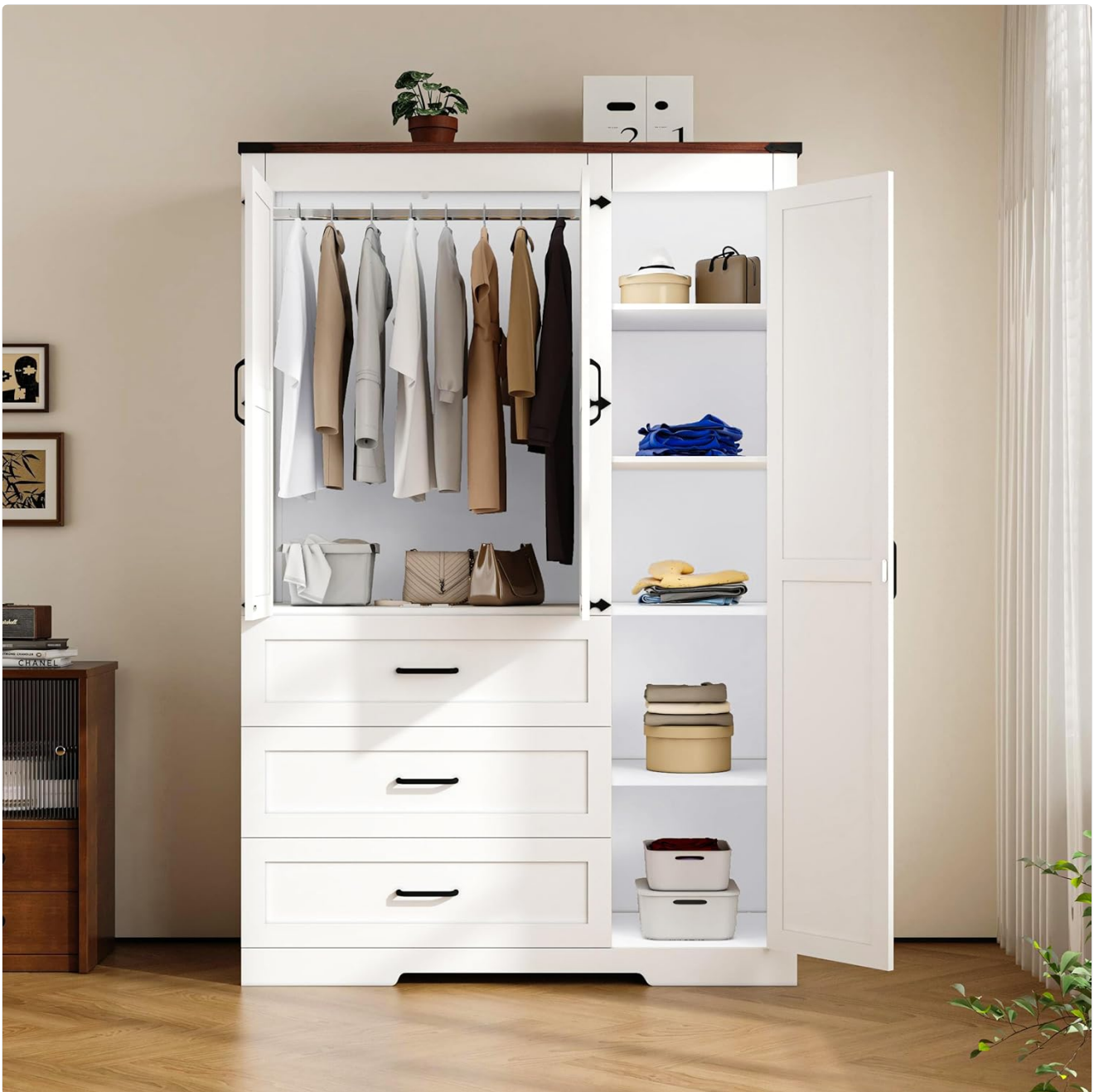
Figure 6: Interior Organization. This image shows the wardrobe with its doors open, demonstrating the combined hanging space, adjustable shelves, and drawers for comprehensive storage solutions.