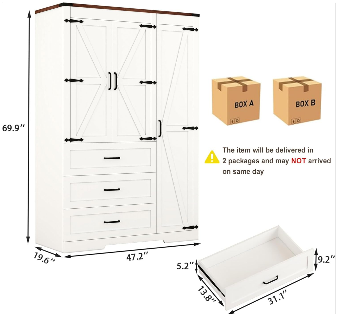
Figure 1: Product Dimensions. This image illustrates the overall dimensions of the wardrobe closet, including height, width, and depth, as well as the internal dimensions of the drawers. The item is delivered in two packages, Box A and Box B, which may arrive on different days.

The wardrobe is designed with classic barn doors and black metal decorations, providing a rustic aesthetic. It includes a half-length hanging compartment, additional compartments for accessories, and three deep drawers for folded items.