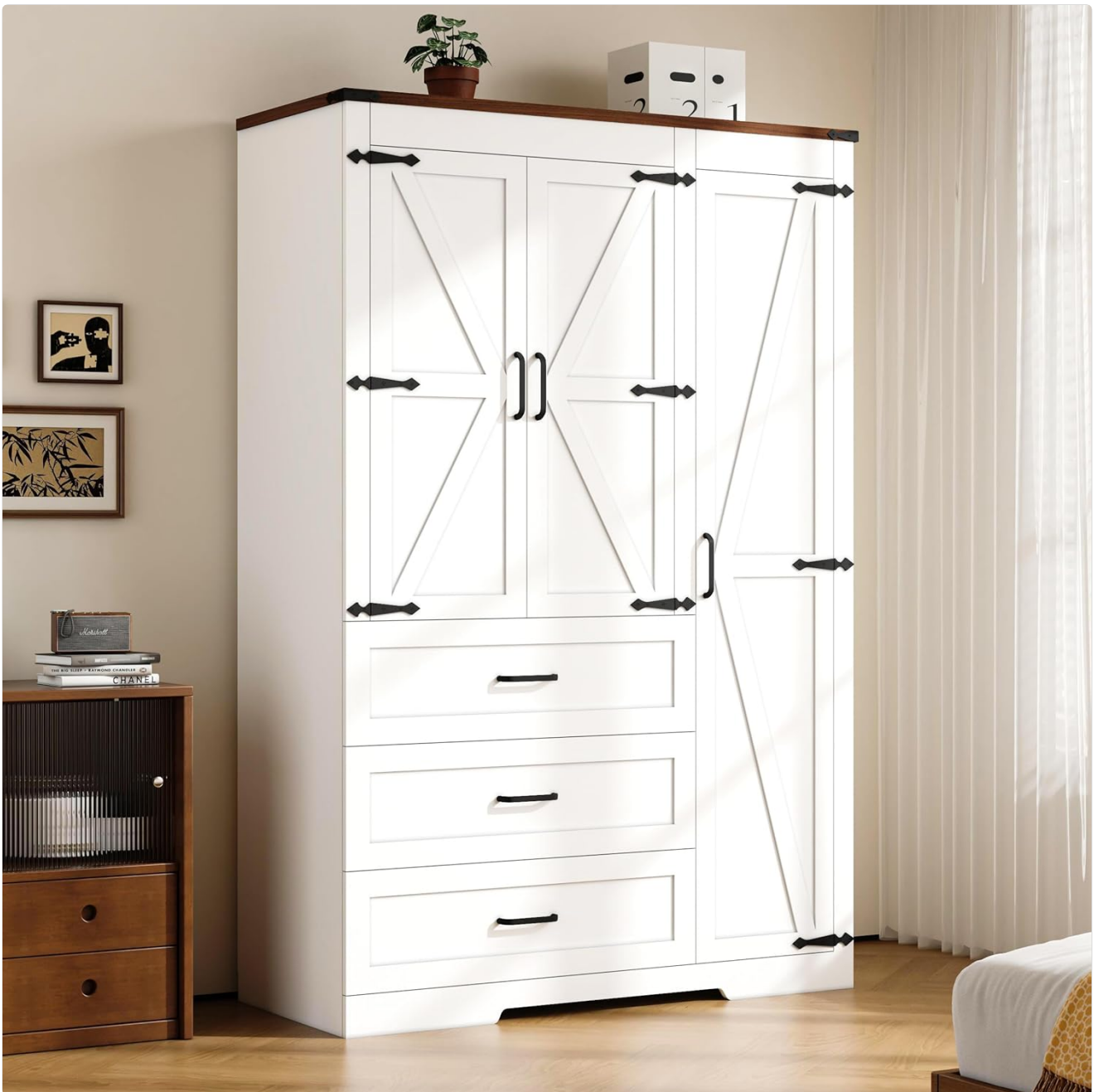
Figure 3: Assembled Wardrobe. This image displays the fully assembled wardrobe closet in a room, showcasing its farmhouse design and overall appearance.