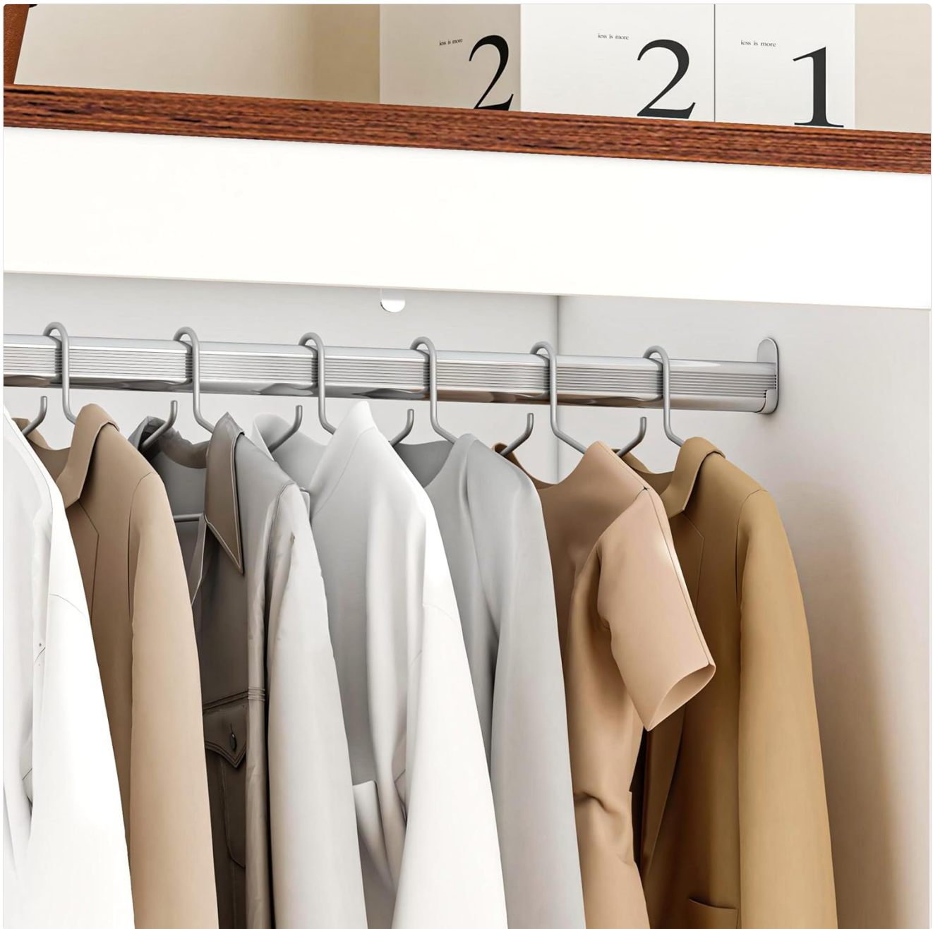
Figure 4: Hanging Rod Detail. This image provides a detailed view of the sturdy aluminum alloy hanging rod, demonstrating its capacity for various clothing items.