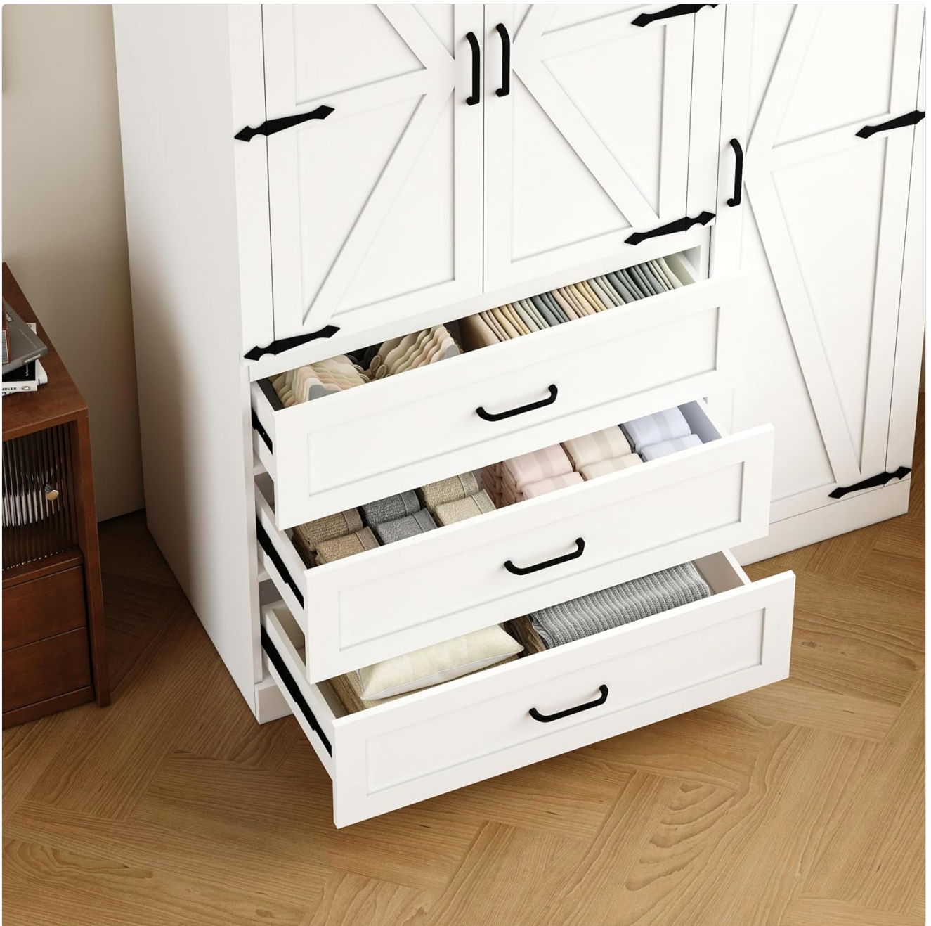
Figure 5: Drawer Storage. This image illustrates the spacious and organized storage provided by the three deep drawers, suitable for folded garments and other items.