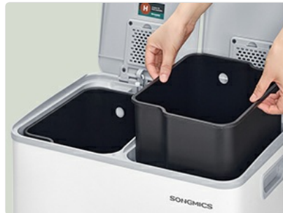
Figure 2: Inner buckets are easily removable for cleaning and bag changes.