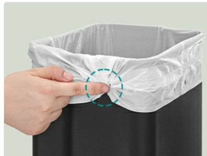
Figure 3: Bag holes keep liners securely in place.