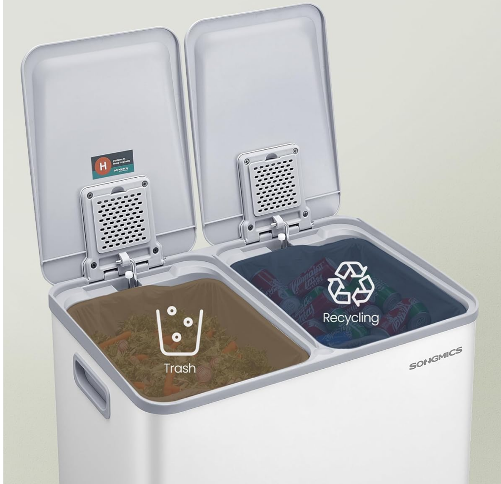
Figure 6: Clearly marked compartments for easy waste separation.