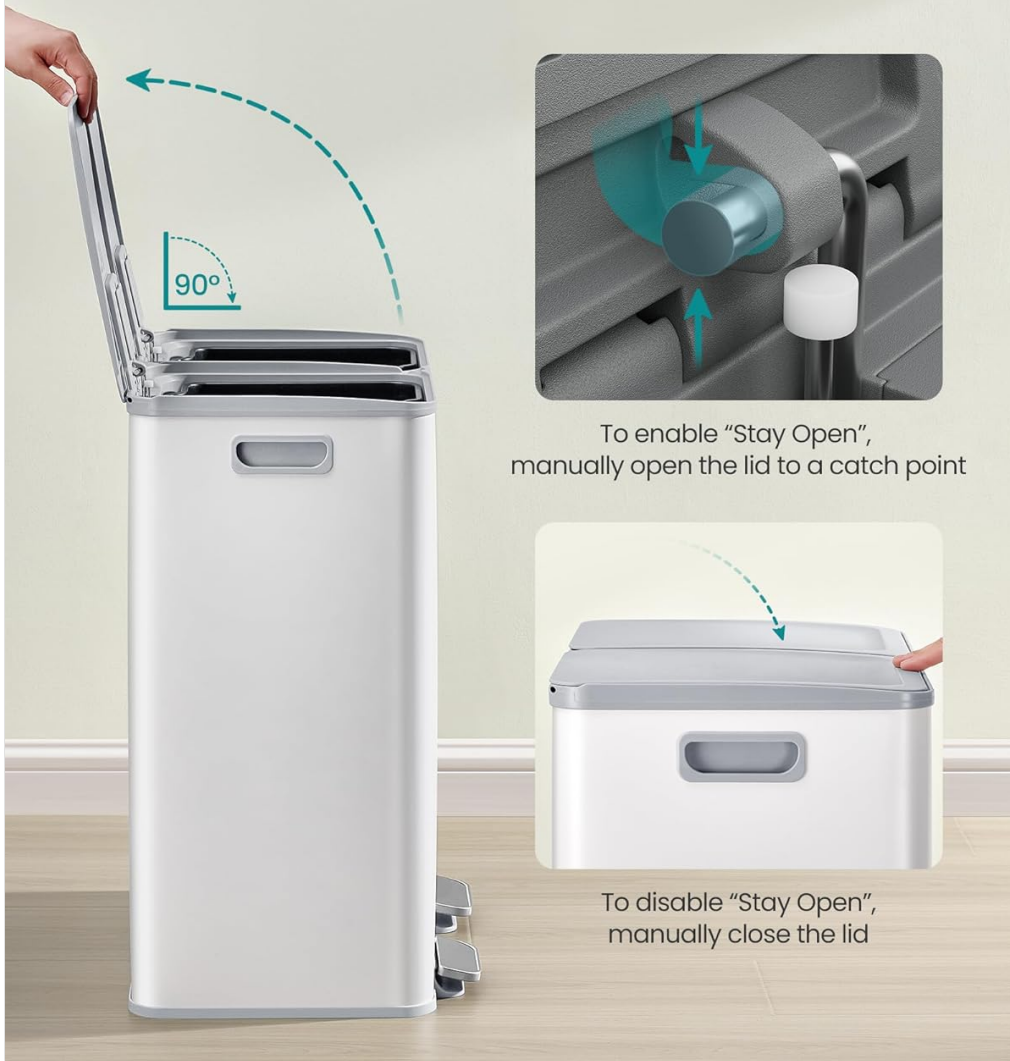
Figure 5: Manually lift the lid to 90° to activate the stay-open function.

Keep the lid open by manually lifting it to 90°