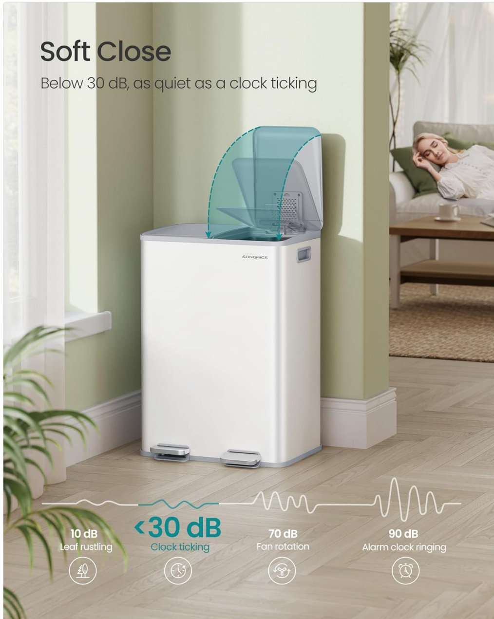
Figure 4: The soft-close mechanism ensures quiet operation (below 30 dB).