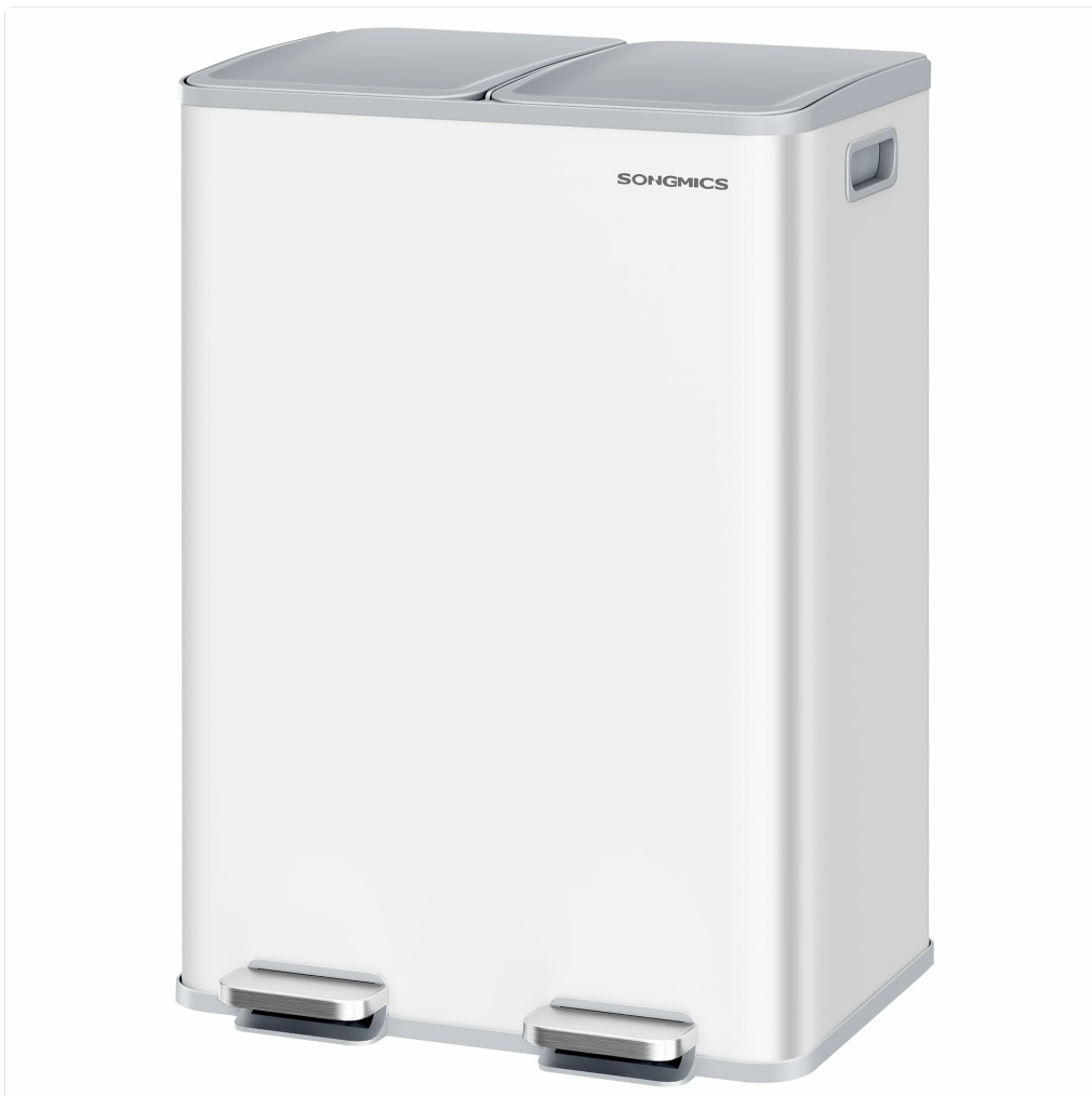
Figure 1: SONGMICS Dual-Compartment Trash Can (Matte White)

Thank you for choosing the SONGMICS Dual-Compartment Trash Can. This manual provides essential information for the safe and efficient use of your new trash can. Please read it thoroughly before initial use and retain it for future reference.