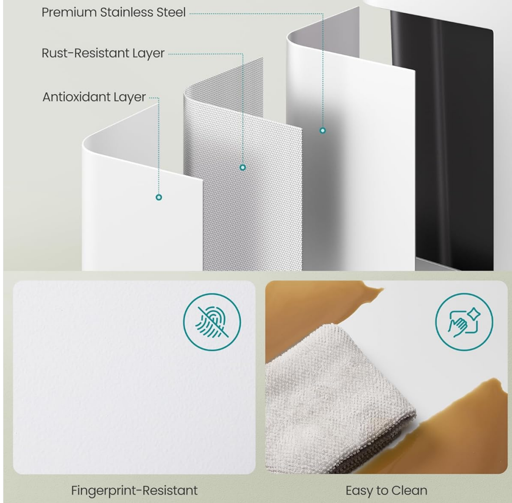
Figure 7: The stainless steel is designed for easy cleaning and resists fingerprints.