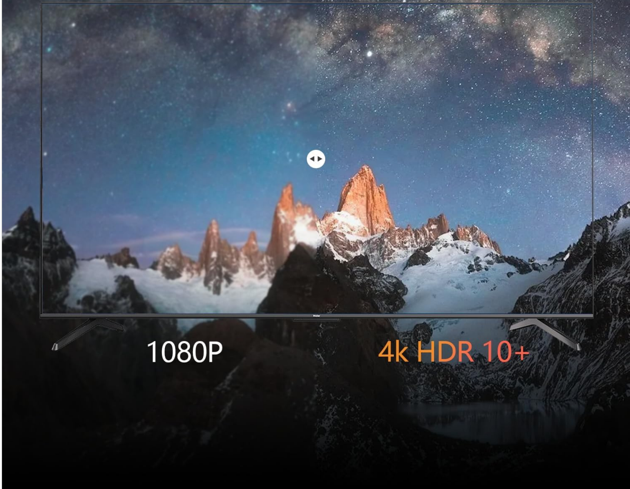
Image 6.1: A television screen displaying a vibrant 4K HDR image of a starry night sky over mountains, contrasting with a 1080P image. This illustrates the superior clarity, brightness, contrast, and color accuracy delivered by 4K HDR 10+ technology.

4k HDR Delivers sharp and detailed images plus exceptional ULTRAHD brightness, contrast, and color accuracy