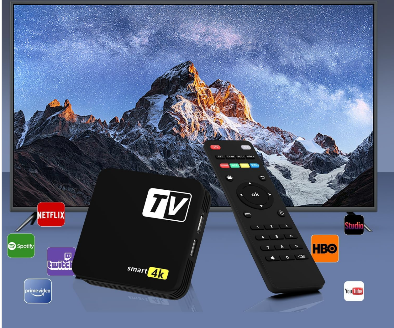
Image 3.1: The YFDSPSM streaming device and its remote control, surrounded by icons of popular streaming applications such as Netflix, Spotify, Twitch, Prime Video, HBO, and YouTube. This illustrates the device's compatibility with various entertainment platforms.