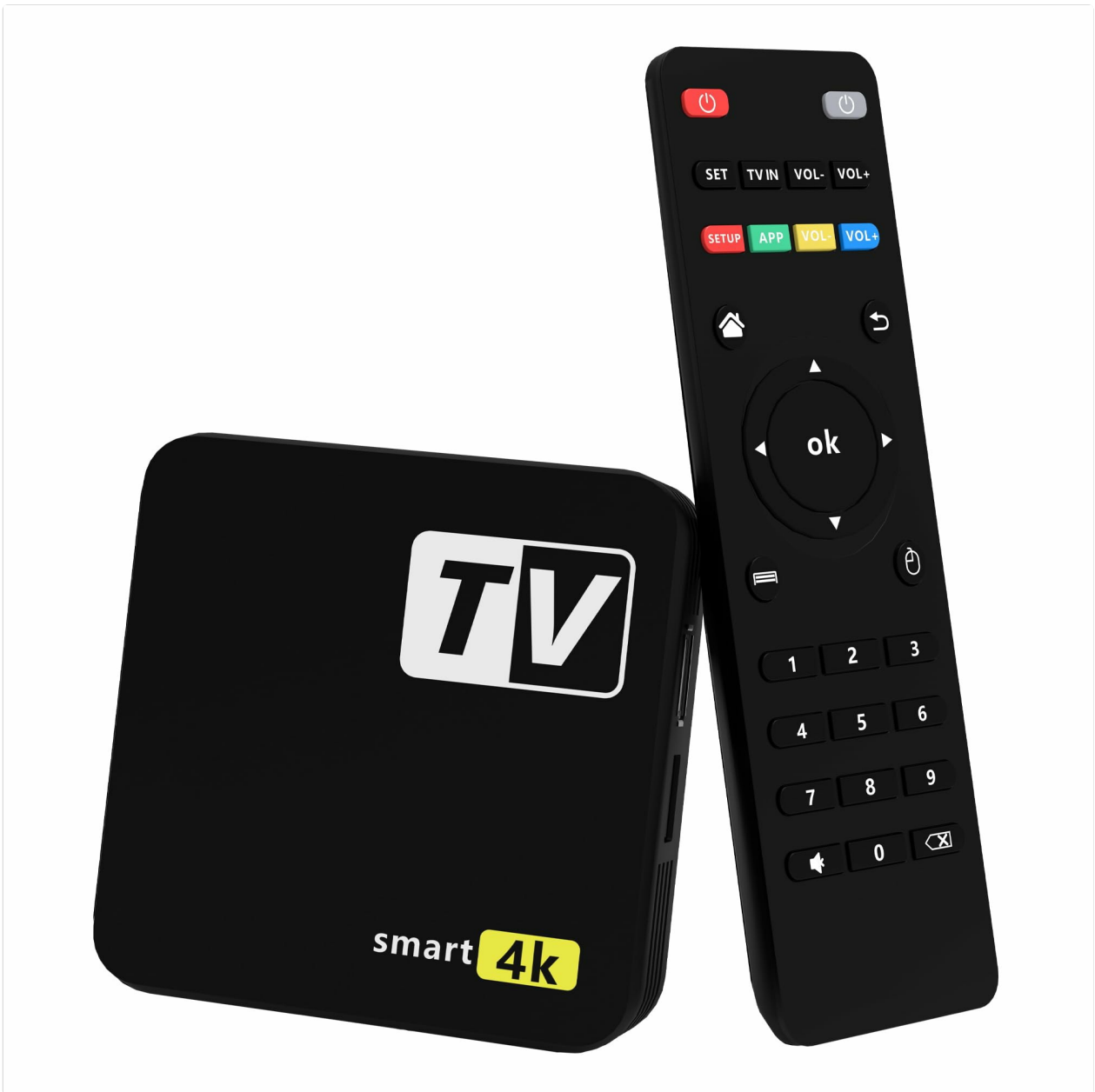
Image 1.1: The YFDSPSM 4K+ HD/4K/HDR Streaming Device. This image displays the compact black streaming box with a 'TV' logo and 'smart 4k' branding on its top surface.