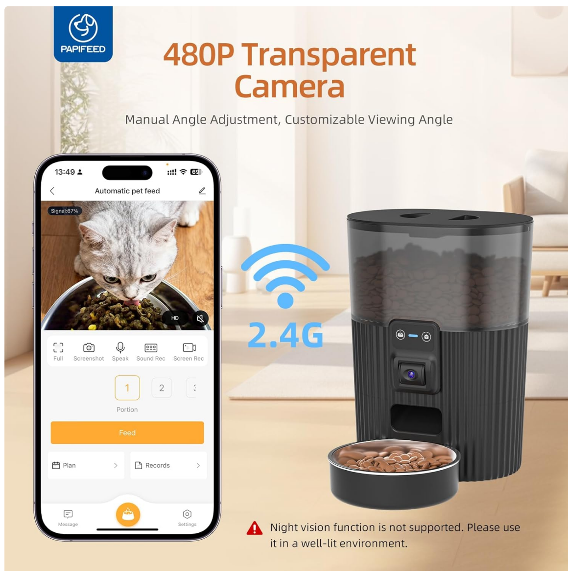
Image 6: The app interface showing the 480P camera view of the feeding bowl, indicating 2.4G WiFi connection. A note clarifies no night vision.