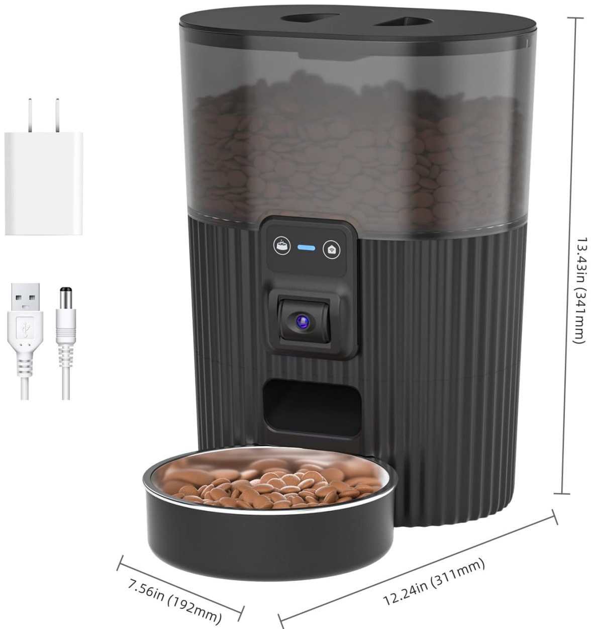
Image 2: Overview of the PAPIFEED Automatic Cat Feeder components and dimensions, including the main unit, power adapter, and bowl.