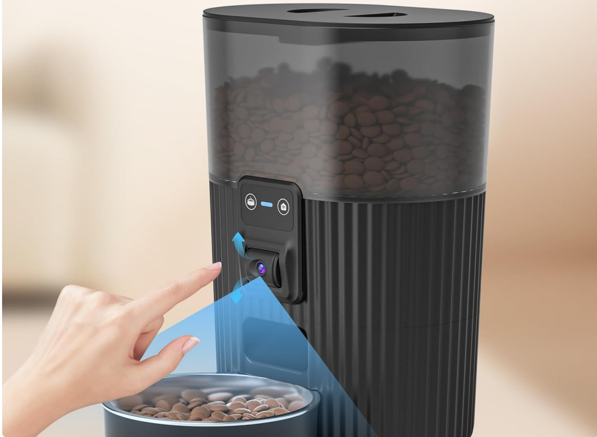
Image 7: A hand manually adjusting the camera angle on the feeder, emphasizing the physical adjustment feature.

Manually adjustable camera—safety comes from visibility.