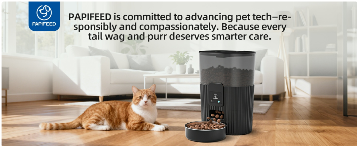
Image 1: PAPIFEED Automatic Cat Feeder with Camera. This image shows the overall design of the feeder with a cat nearby, highlighting the brand's commitment to pet care.

The PAPIFEED Automatic Cat Feeder with Camera provides a convenient and reliable solution for managing your pet's feeding schedule. This device features remote control via a 2.4G WiFi-enabled app, a 480P adjustable camera for monitoring, two-way audio communication, and customizable meal plans to ensure your pet receives appropriate portions at scheduled times. It also includes a dual power system for uninterrupted operation.