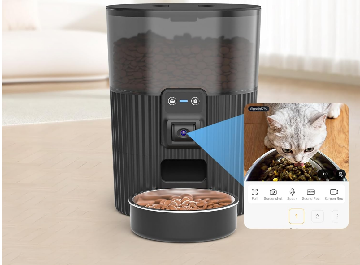
Image 5: The feeder dispensing food into the bowl, with a smartphone displaying the app interface for remote interaction.