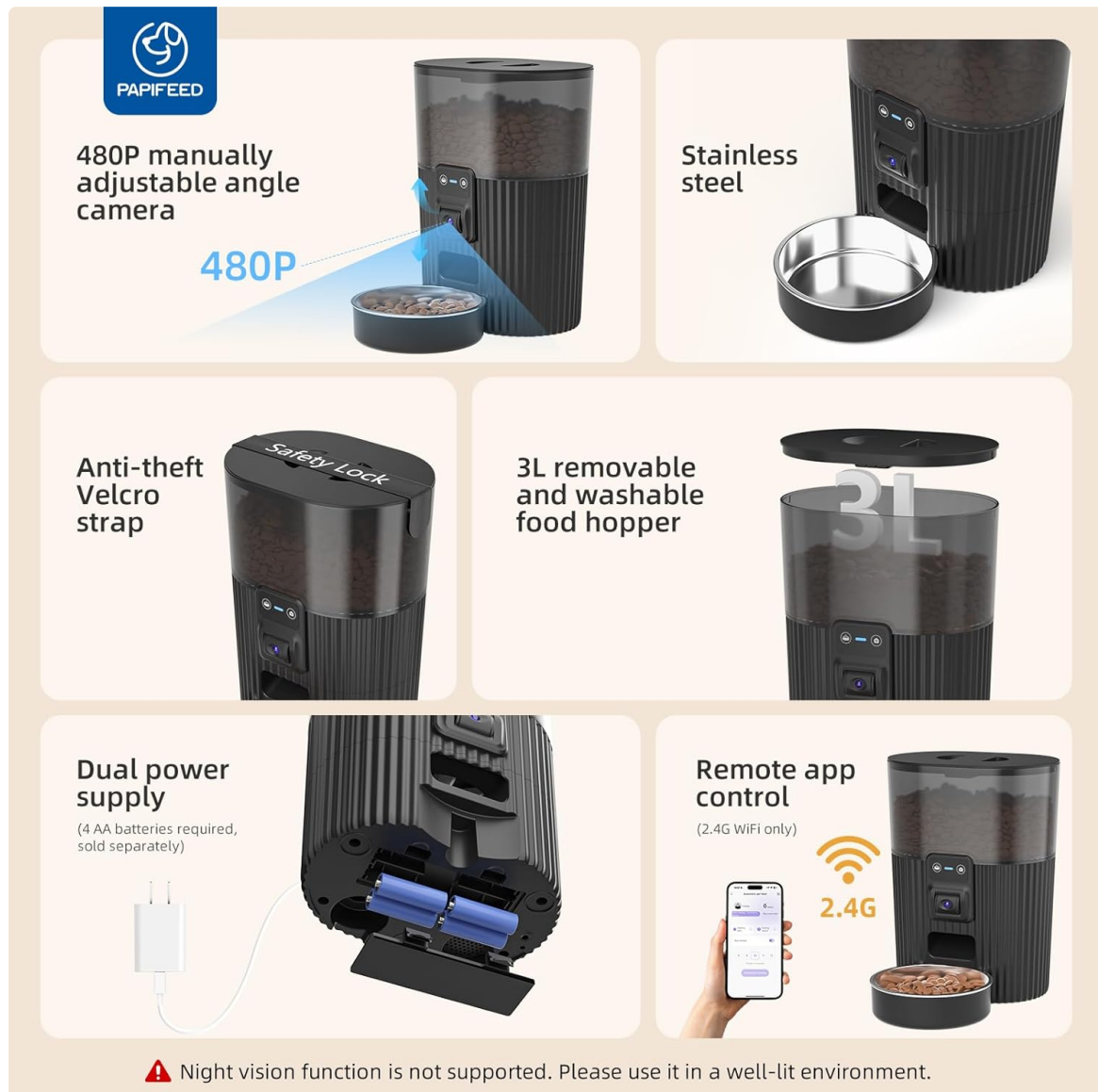
Image 3: Visual guide to the feeder's components, including the stainless steel bowl, removable food hopper, and dual power options.