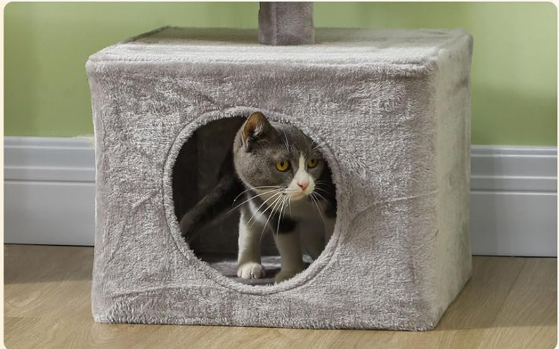
Image 3.1: Examples of private spaces within the cat tree, including a cozy cat bed and an enclosed cat house for relaxation.