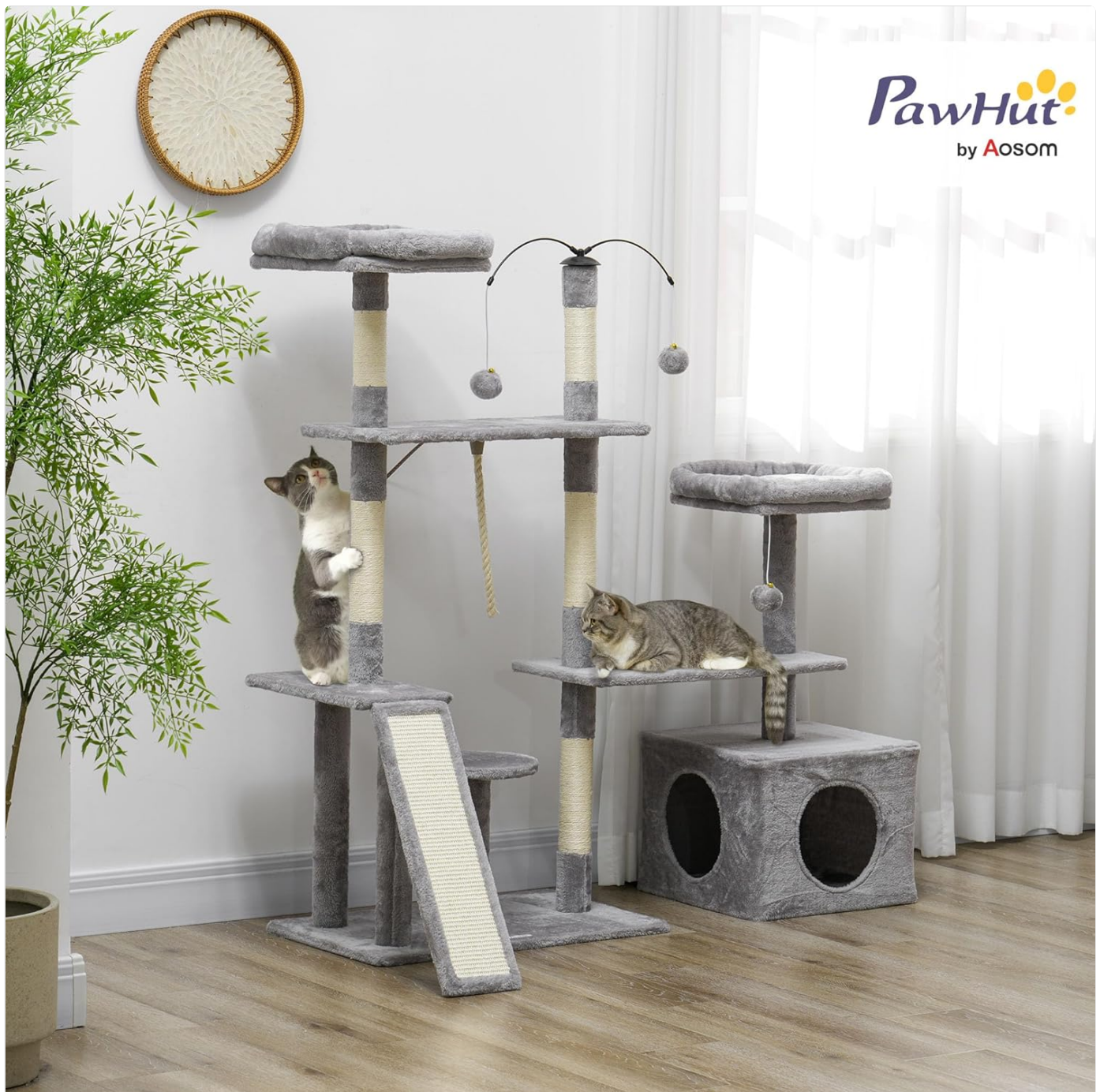
Image 1.2: The cat tree integrated into a home environment, demonstrating its aesthetic appeal and functional design.