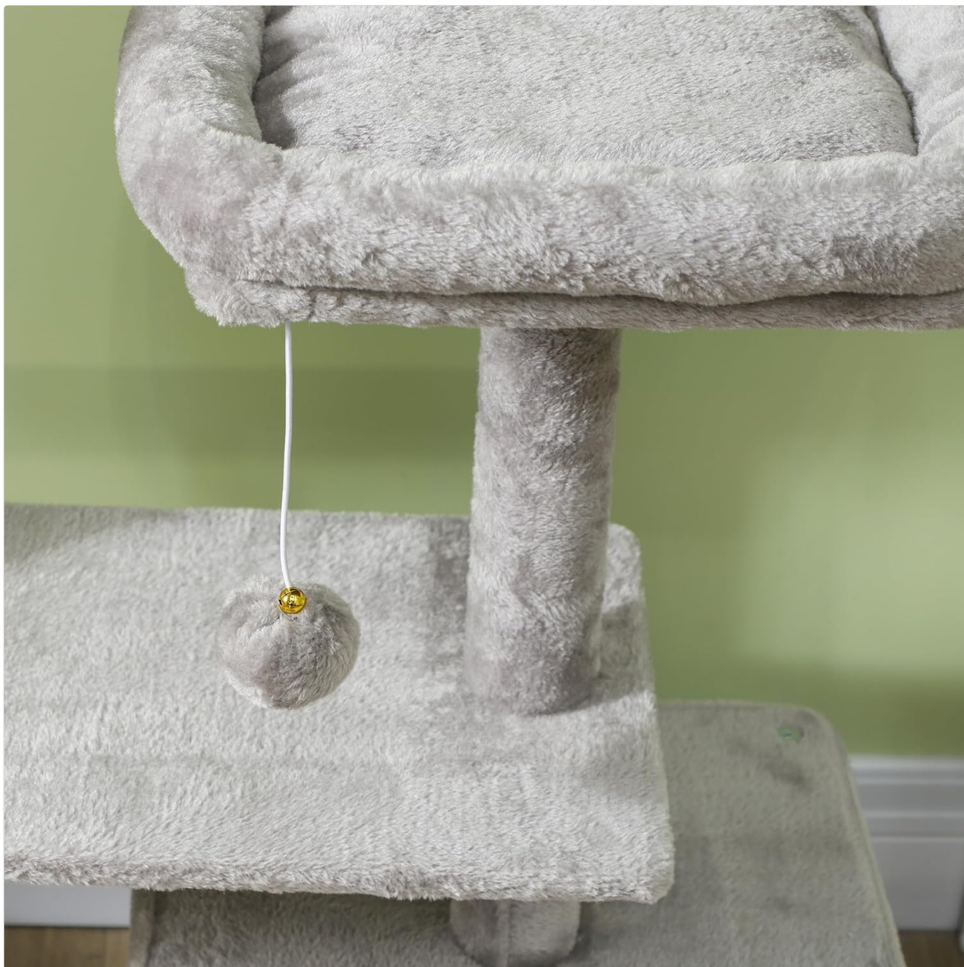
Image 4.1: Detail of the plush material and an interactive toy ball, both requiring regular cleaning and inspection.