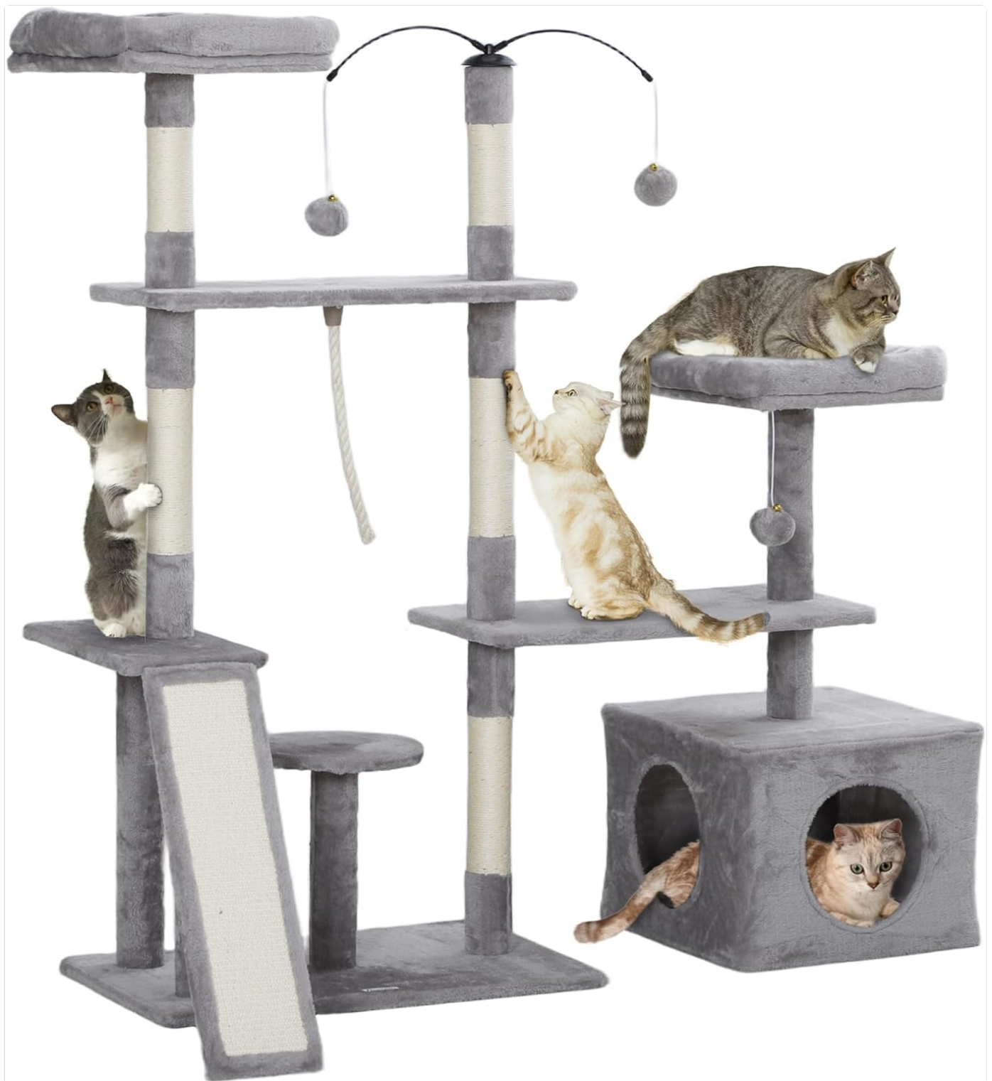
Image 1.1: The PawHut Multi-Level Cat Tree, showcasing its various features and multiple cats enjoying the structure.