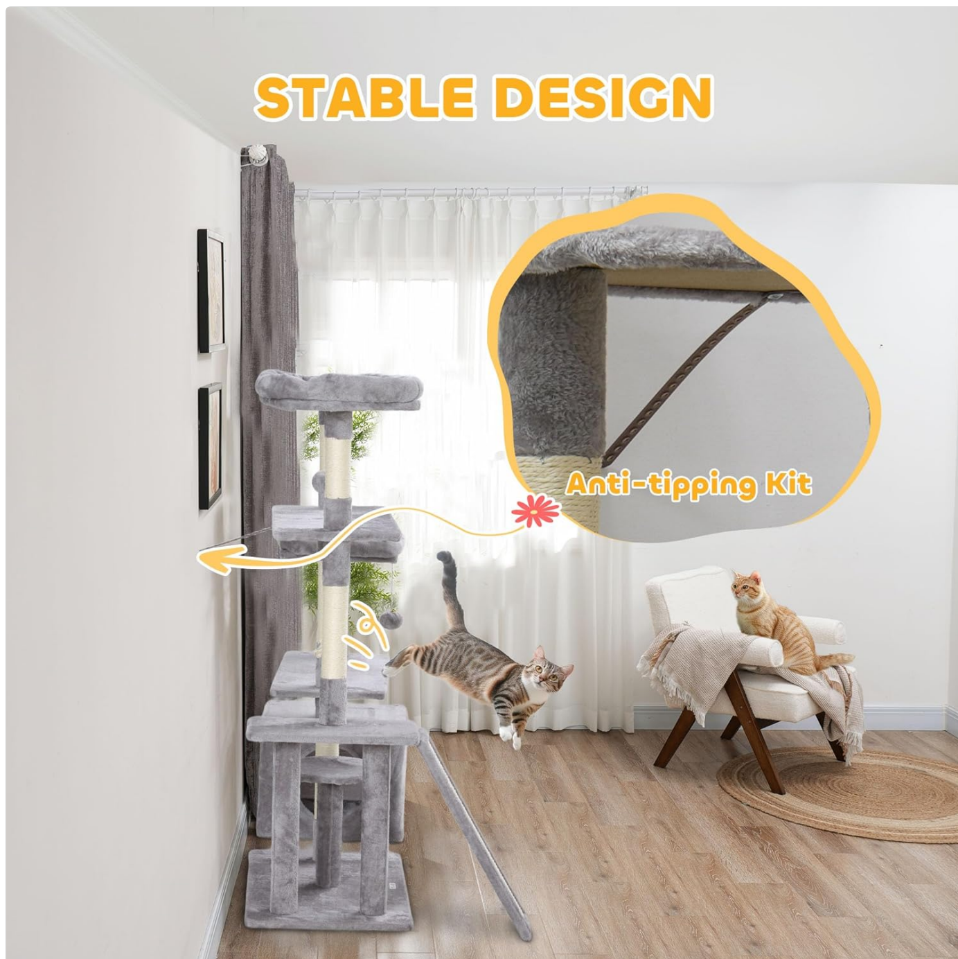
Image 3.2: Cats engaging with various elements of the cat tree, such as scratching posts, toy balls, and elevated platforms.