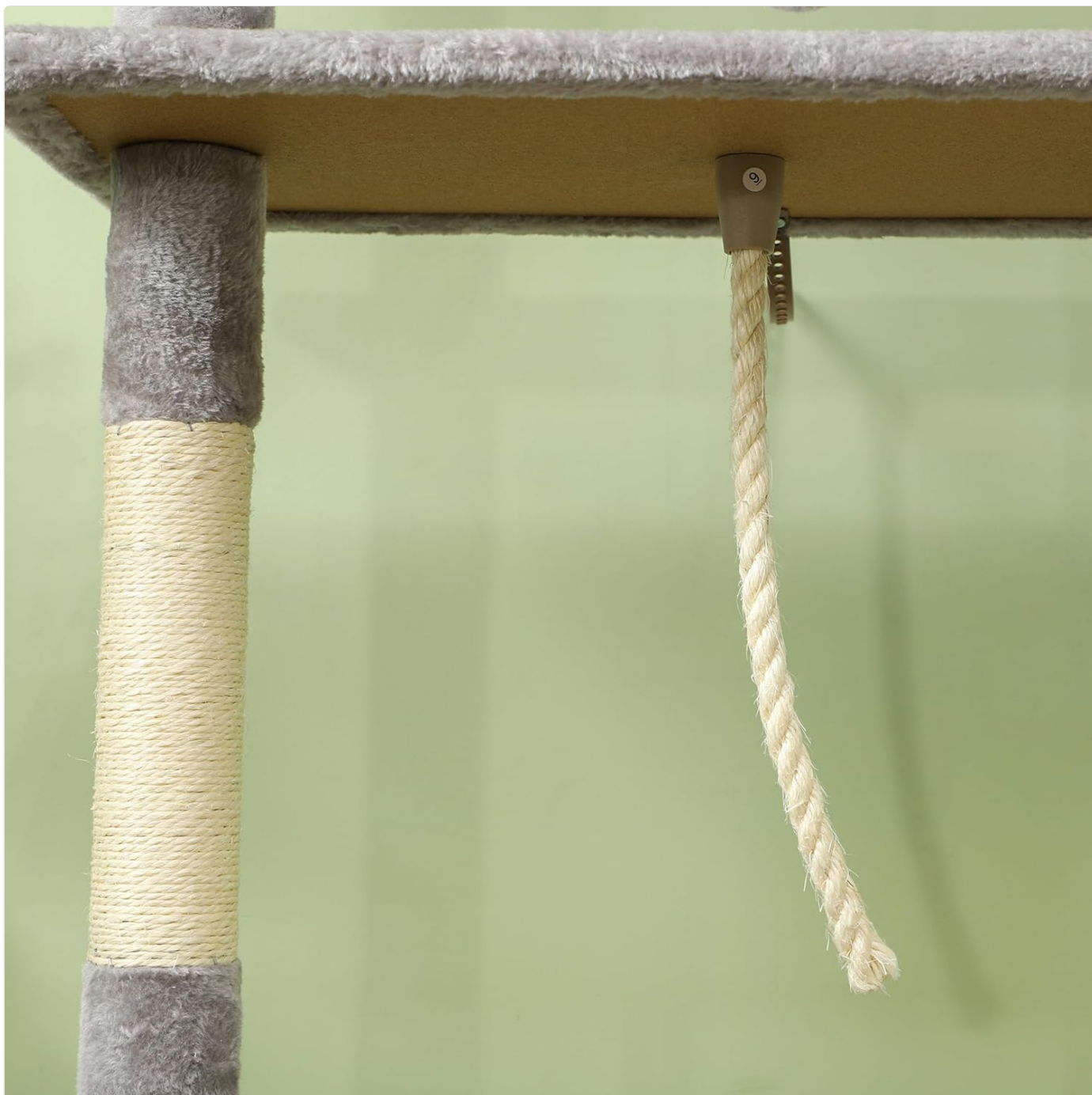
Image 4.2: Detail of the sisal scratching post and teasing rope, which should be checked for wear.