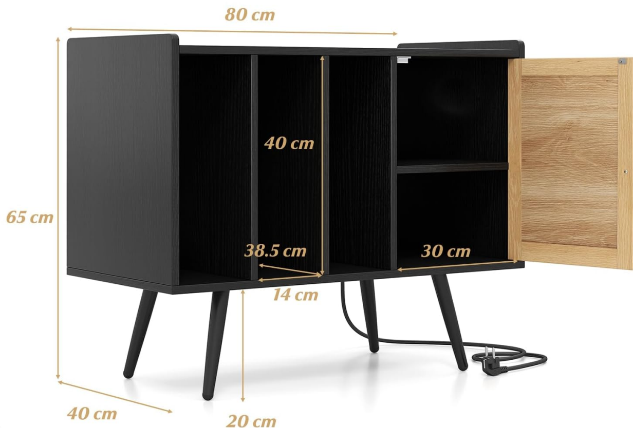
Image 3.1: Diagram illustrating the dimensions of the KOMFOTTEU Disc Holder.