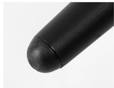
Non-slip Foot Pads