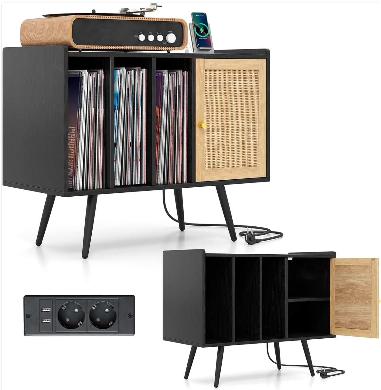
Image 2.1: Overall view of the KOMFOTTEU Disc Holder with Charging Station Vinyl Cabinet, showcasing its design and storage capabilities.