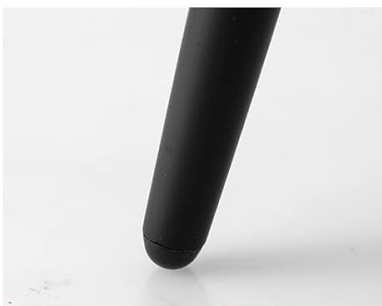
Metal Support Legs