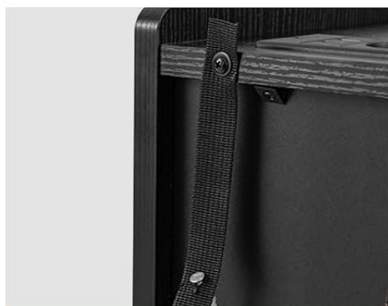
2 Anti-Toppling Kits