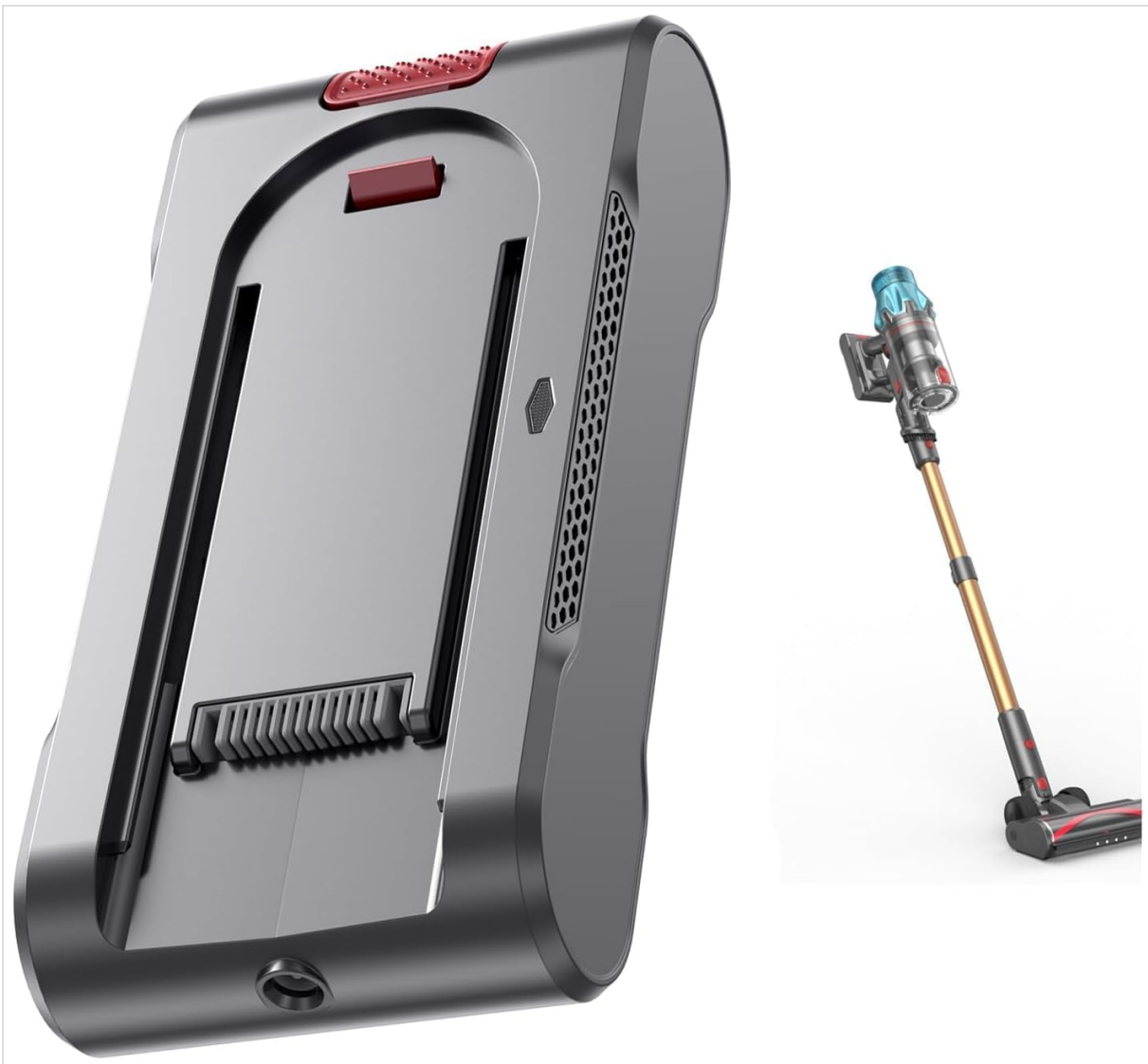
Image 1: The Fiety V7 replacement battery module shown alongside a compatible cordless vacuum cleaner. The battery features a gray casing with red accents and connection points for the vacuum.