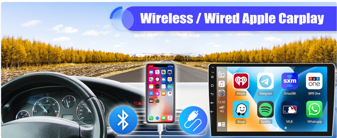
Figure 5: Wireless/Wired Apple CarPlay functionality.

Connect your compatible smartphone wirelessly or via USB to access CarPlay or Android Auto. This allows you to use navigation, make calls, send messages, and listen to music directly from your phone's interface on the car stereo screen.