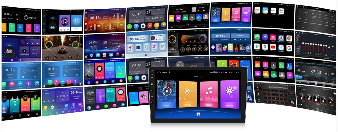
Figure 14: Multiple UI themes for personalization.

The stereo offers various user interface themes to personalize the display's appearance.