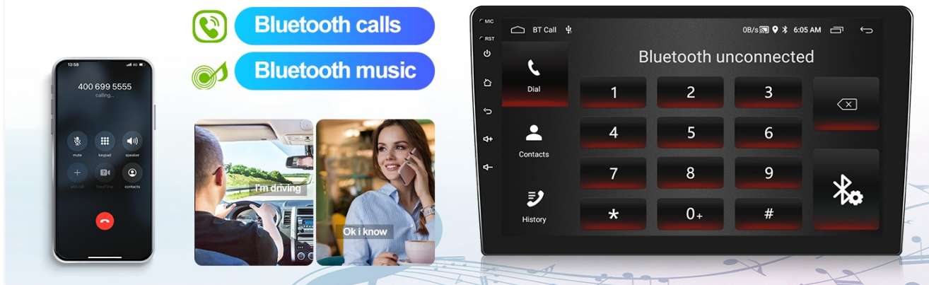
Figure 9: Bluetooth hands-free functionality.