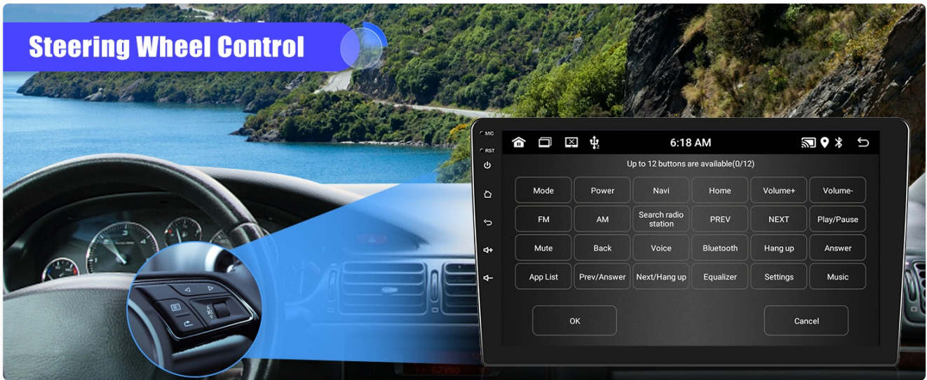
Figure 11: Steering Wheel Control setup.