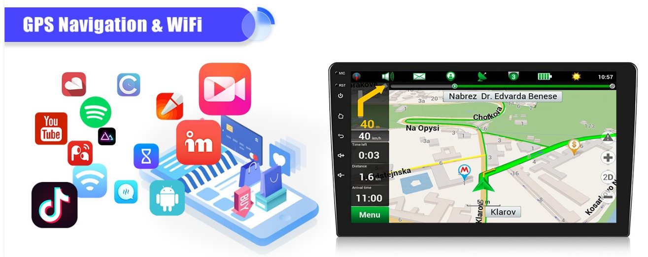
Figure 8: GPS Navigation and WiFi connectivity.

The unit features built-in GPS navigation. It comes pre-installed with the "Here We Go" app, allowing for both online and offline navigation. Connect to WiFi to download additional apps from the Play Store, such as YouTube, TikTok, and Spotify.