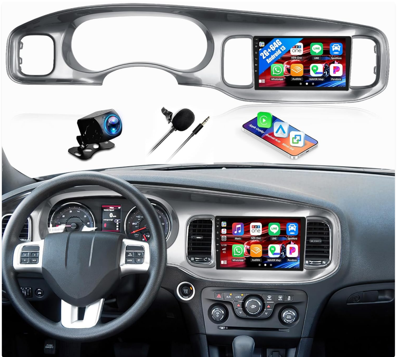
Figure 1: SIXWIN Android Car Stereo installed in a Dodge Charger.