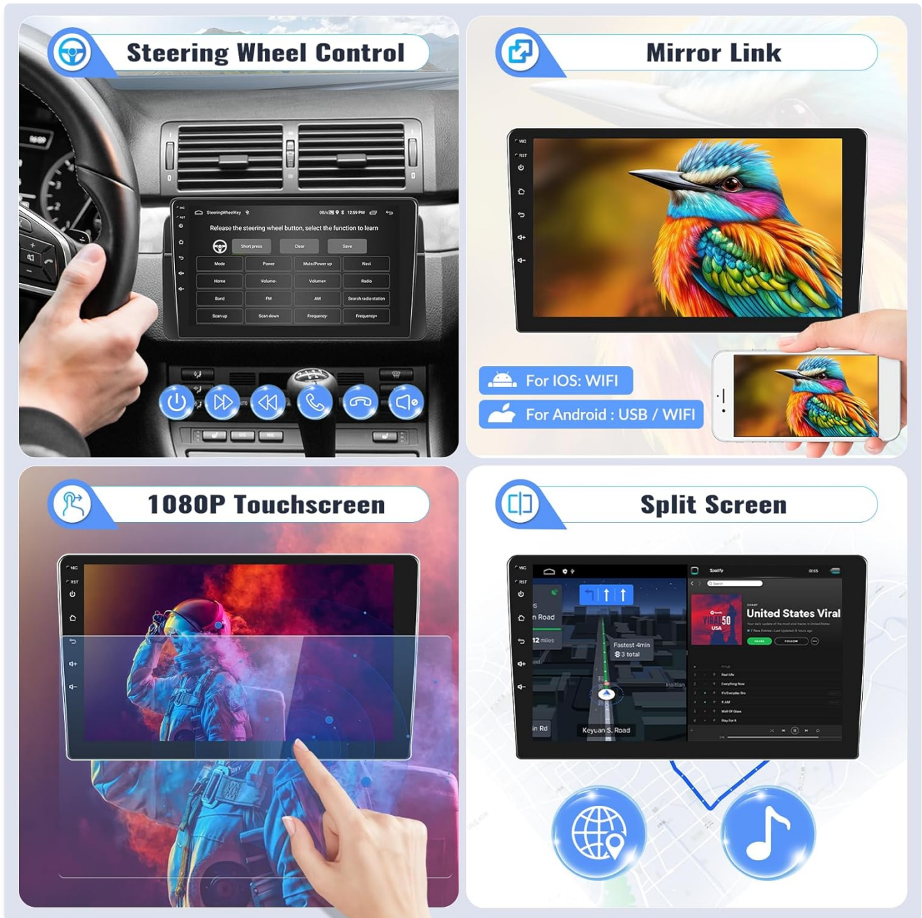
Figure 12: Split Screen in operation.