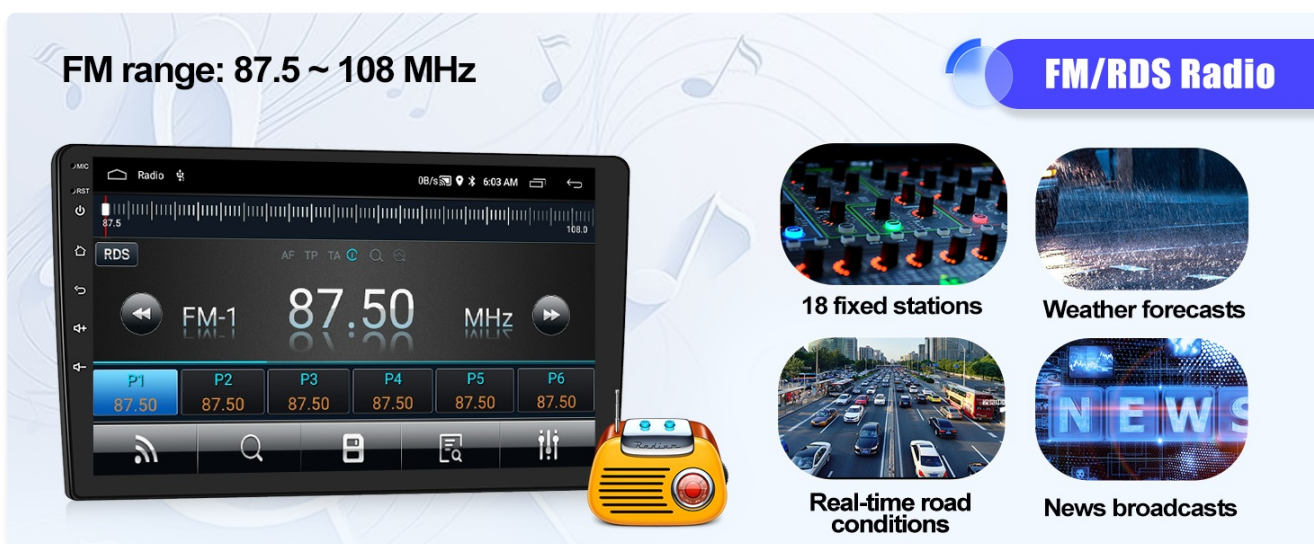
Figure 10: FM/RDS Radio interface.

Tune into FM radio stations within the 87.50-108.0 MHz range. The unit supports RDS (Radio Data System) for displaying station information. You can save up to 18 preset stations.