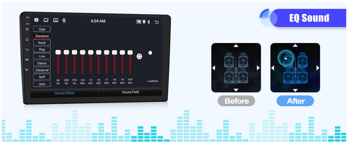
Figure 13: EQ Sound adjustment interface.