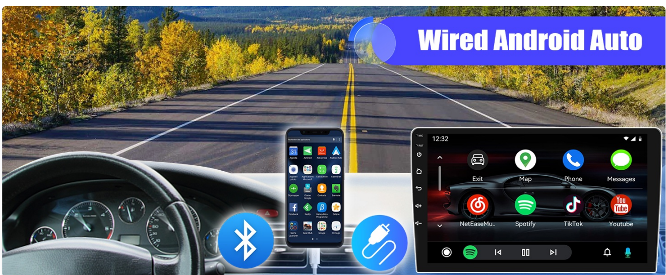
Figure 6: Wired Android Auto functionality.