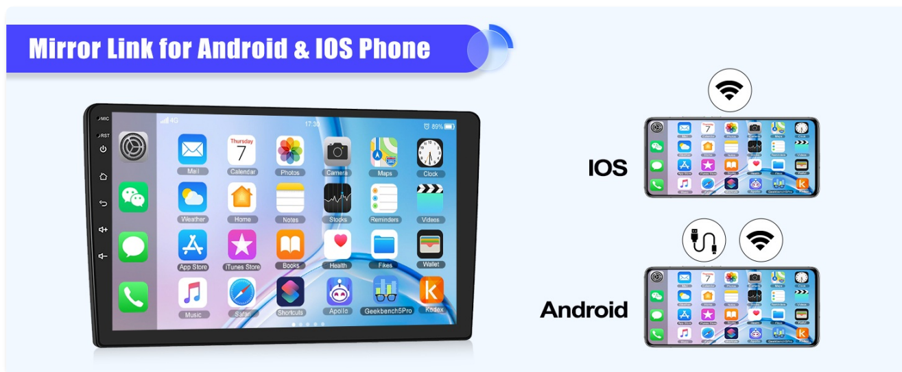
Figure 7: Mirror Link for Android and iOS devices.

Mirror Link allows you to display your smartphone's screen directly onto the car stereo. This feature supports both iOS and Android devices, though it is not compatible with Samsung phones.