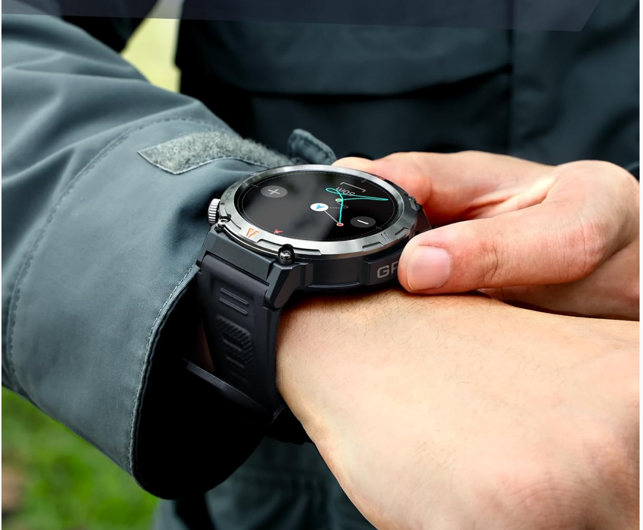
Image: A person wearing the smartwatch, displaying a GPS trail on the screen, indicating navigation capabilities.

GPS trail on watch, navigation on App. L1+L5 dual frequency high precision positioning. Support GPS, GLONASS, BDS, Galileo, NAVIC, QZSS and AGPS.