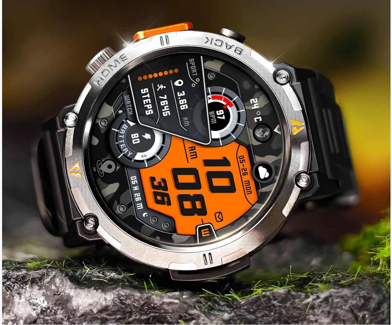
Image: Close-up of the smartwatch display, highlighting its 1.45-inch HD touchscreen.

The smartwatch features a 1.45-inch HD display for sharp visuals.