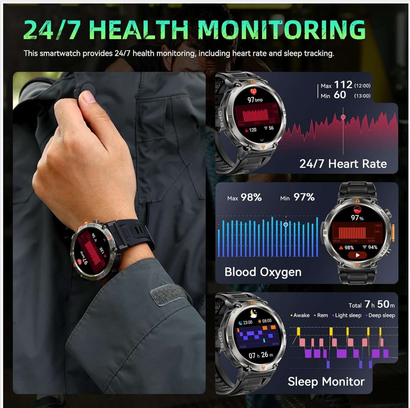
Image: Display of the smartwatch showing 24/7 health monitoring data, including heart rate, blood oxygen, and sleep tracking.

View detailed health data and analysis in the GloryFit app.