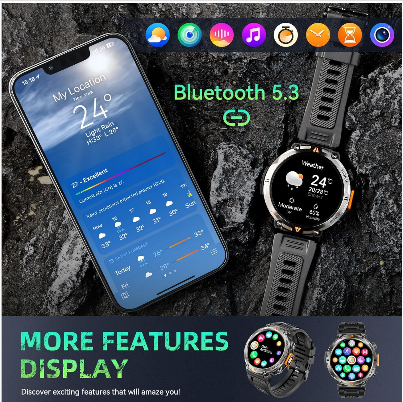
Image: The smartwatch displaying various additional features like weather, music control, and camera remote.