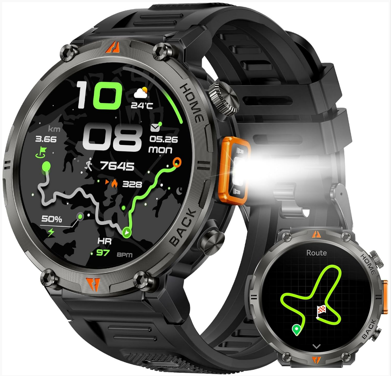
Image: The LaNikar KE3P Military Smart Watch, showcasing its robust design.