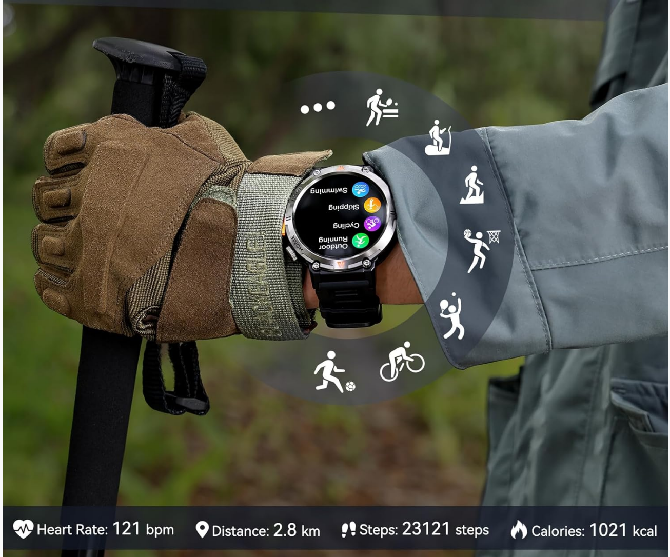
Image: The smartwatch displaying various sports mode icons, indicating support for over 110 activities.

This smartwatch supports 110+ Sports Modes, including running, swimming, and yoga.