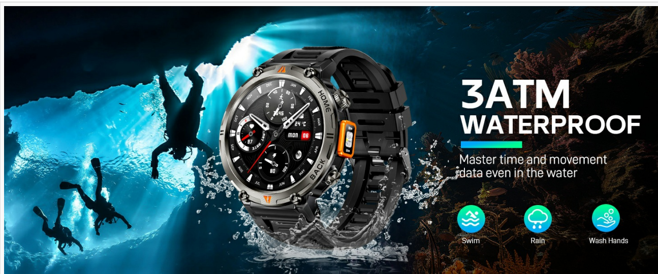
Image: The smartwatch highlighting its military-grade durability, anti-impact, anti-fluid corrosion, dust-proof, and 3ATM waterproof features.