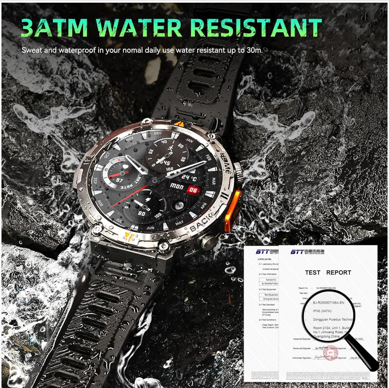
Image: The smartwatch submerged in water, demonstrating its 3ATM water resistance.

Sweat and waterproof in your normal daily use water resistant up to 30m.