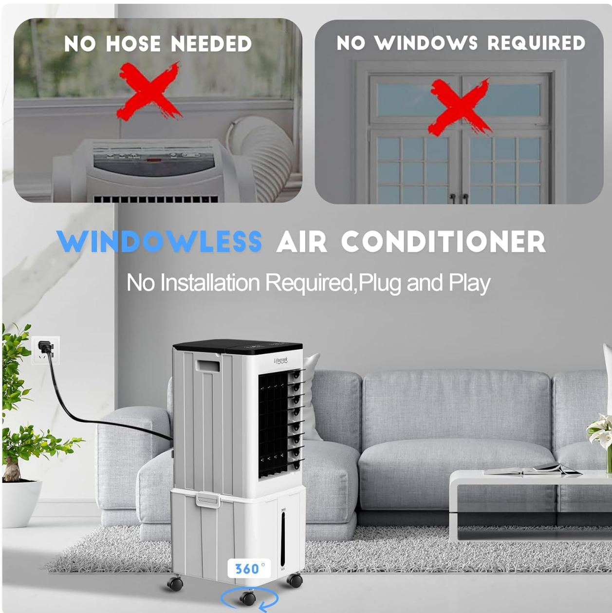
Image 3.3: The portable air conditioner in a room, illustrating its windowless design and no hose requirement for easy plug-and-play operation.