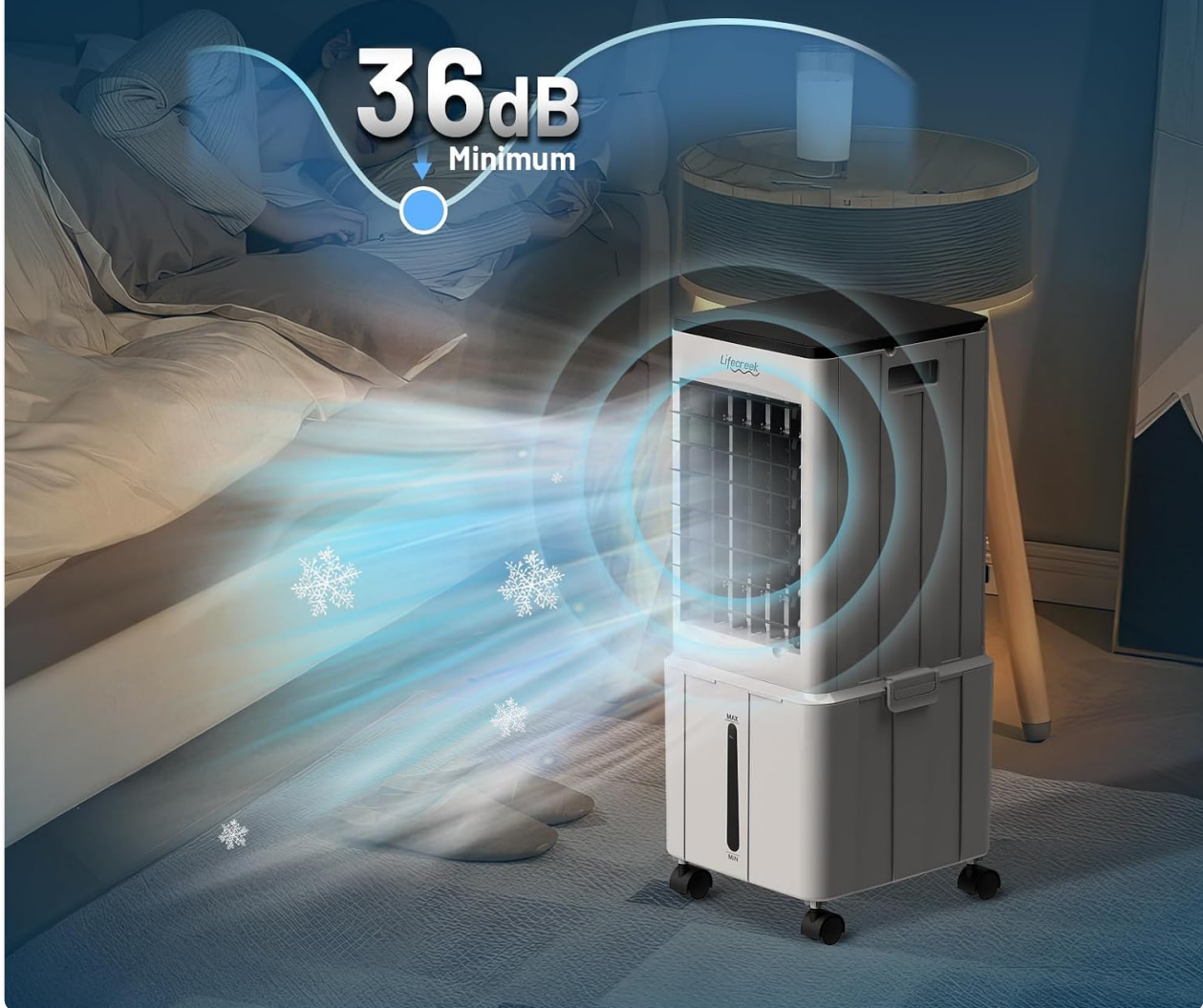
Image 4.5: The air cooler operating in Sleep Mode, demonstrating its low noise level (36dB minimum) for peaceful nights.