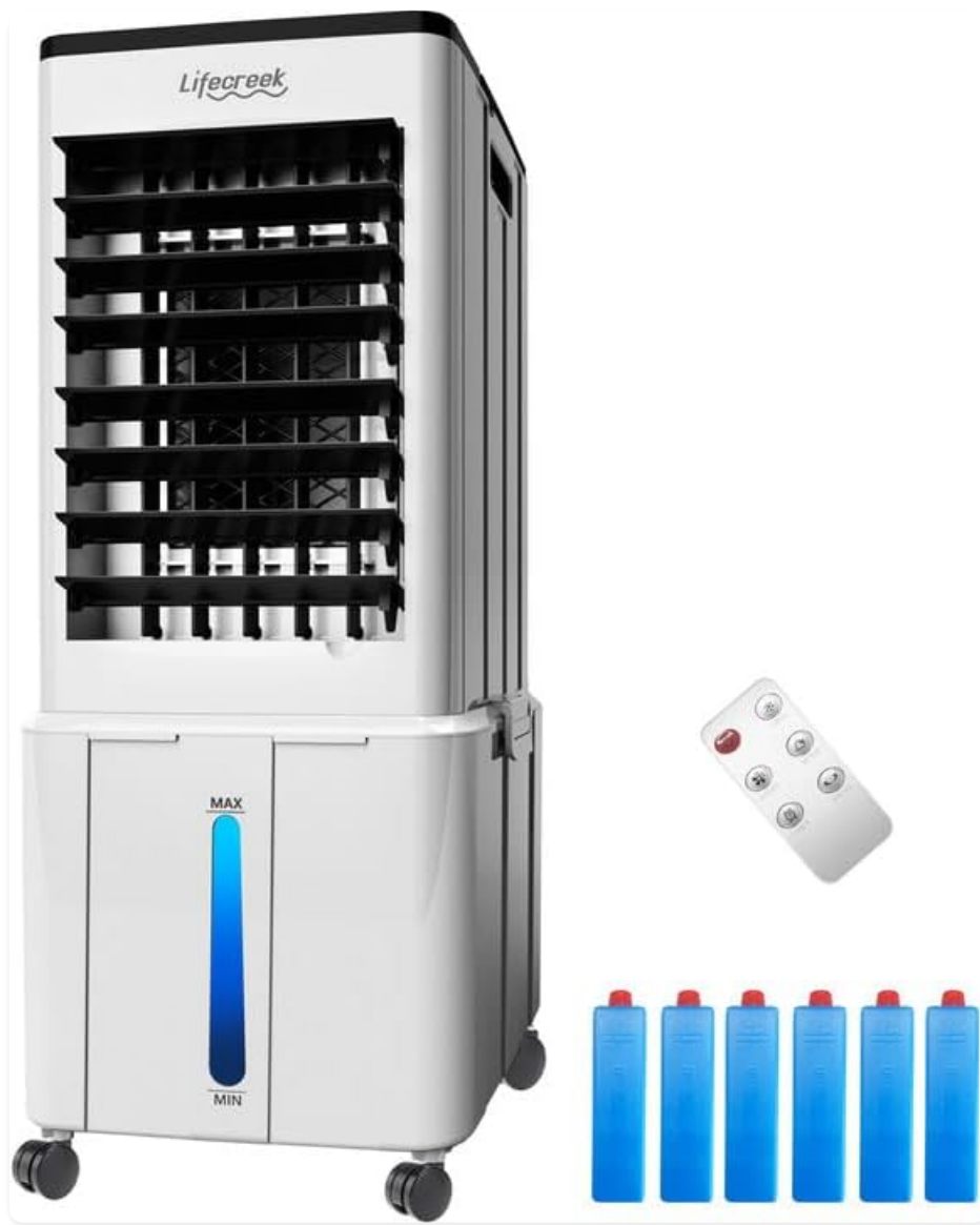
Image 1.1: The LIFECREEK Portable Air Conditioner unit, showing its compact design, included remote control, and six ice packs.