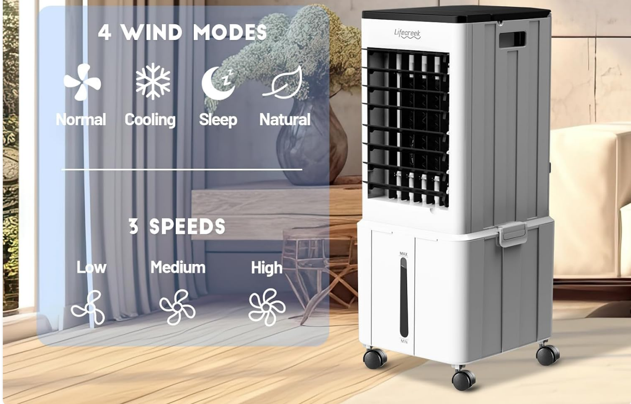
Image 4.2: Visual representation of the four wind modes (Normal, Cooling, Sleep, Natural) and three fan speeds (Low, Medium, High).