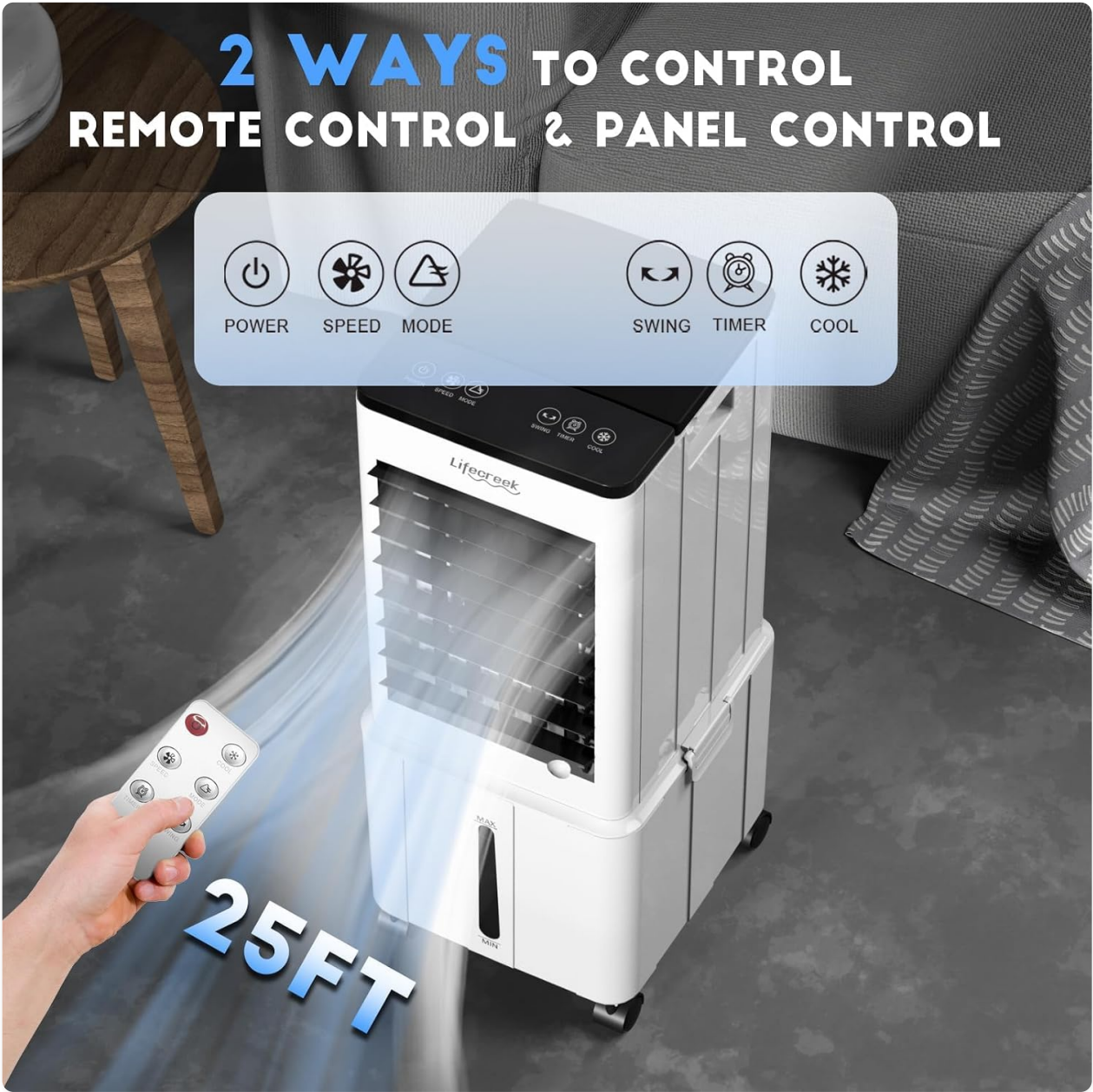
Image 4.1: The unit's control panel and remote control, showing accessible buttons for power, speed, mode, swing, timer, and cool functions.