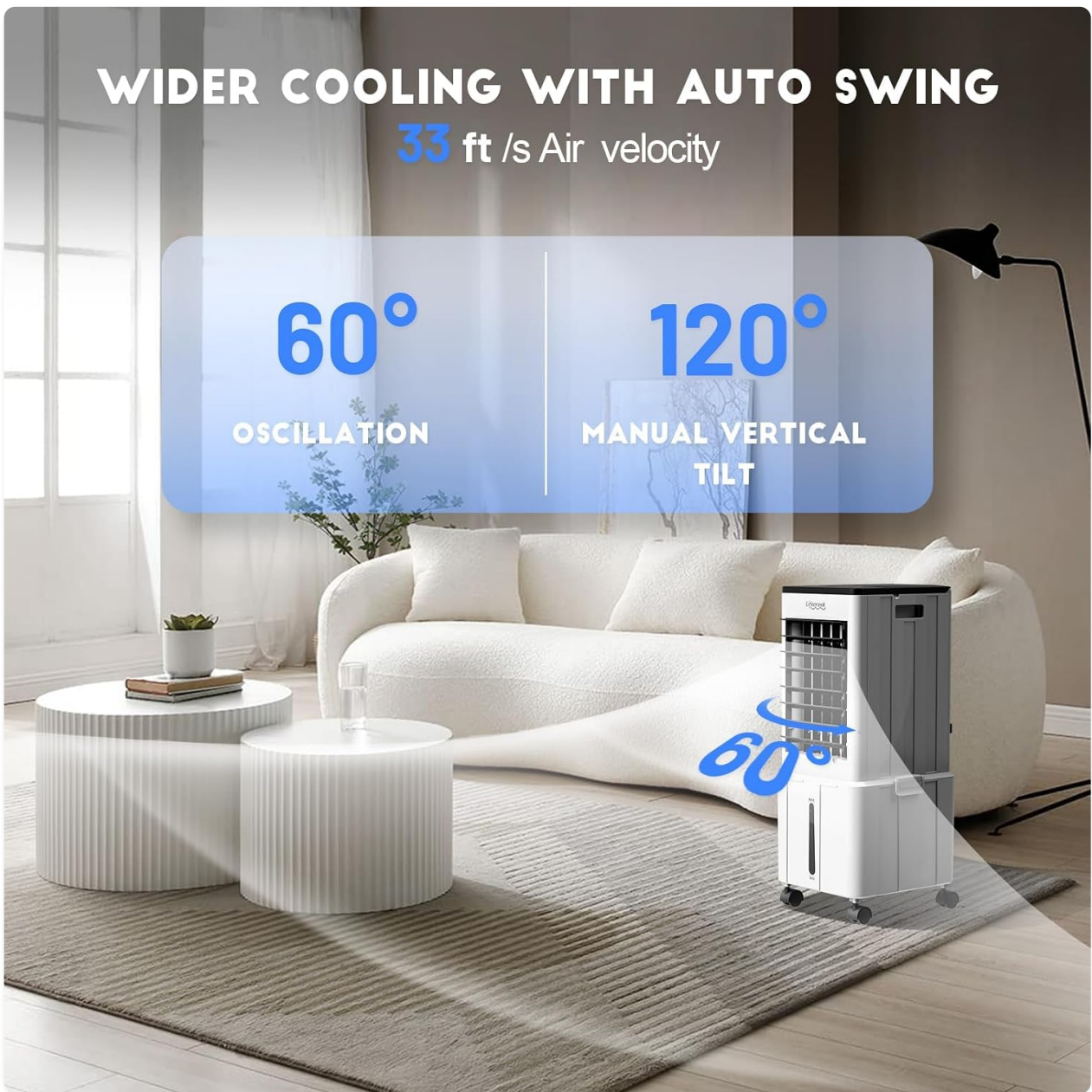
Image 4.4: The unit's oscillation feature providing 60° horizontal swing and a 120° manual vertical tilt for wider air distribution.