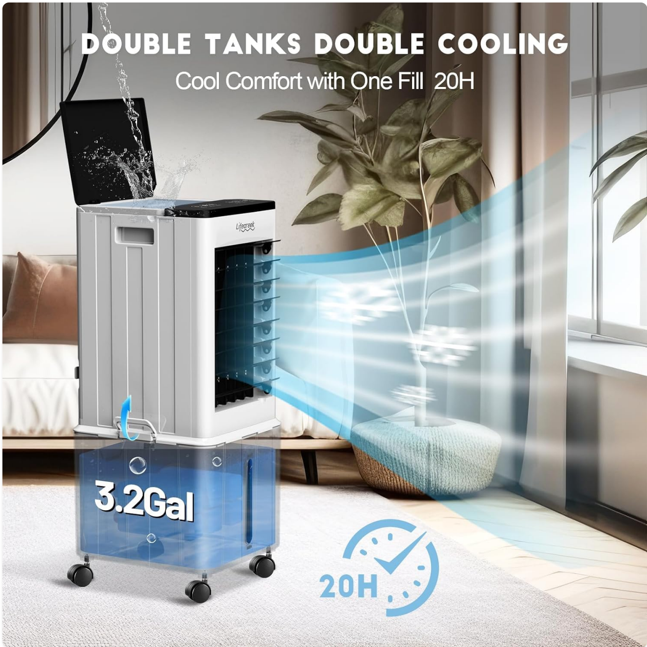
Image 3.1: Illustration of filling the 3.2-gallon water tank for extended cooling comfort.