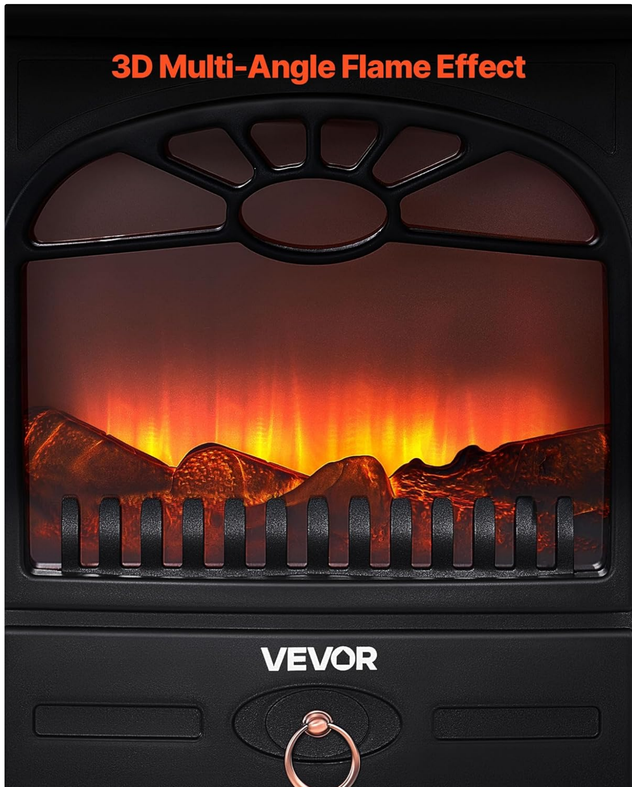
Figure 6: The realistic 3D rolling flame effect with glowing logs provides a comfortable visual experience, enhancing your decor.

To enjoy the visual ambiance without heat, simply turn on the flame effect switch. The realistic 3D flames and glowing logs will provide a cozy atmosphere.