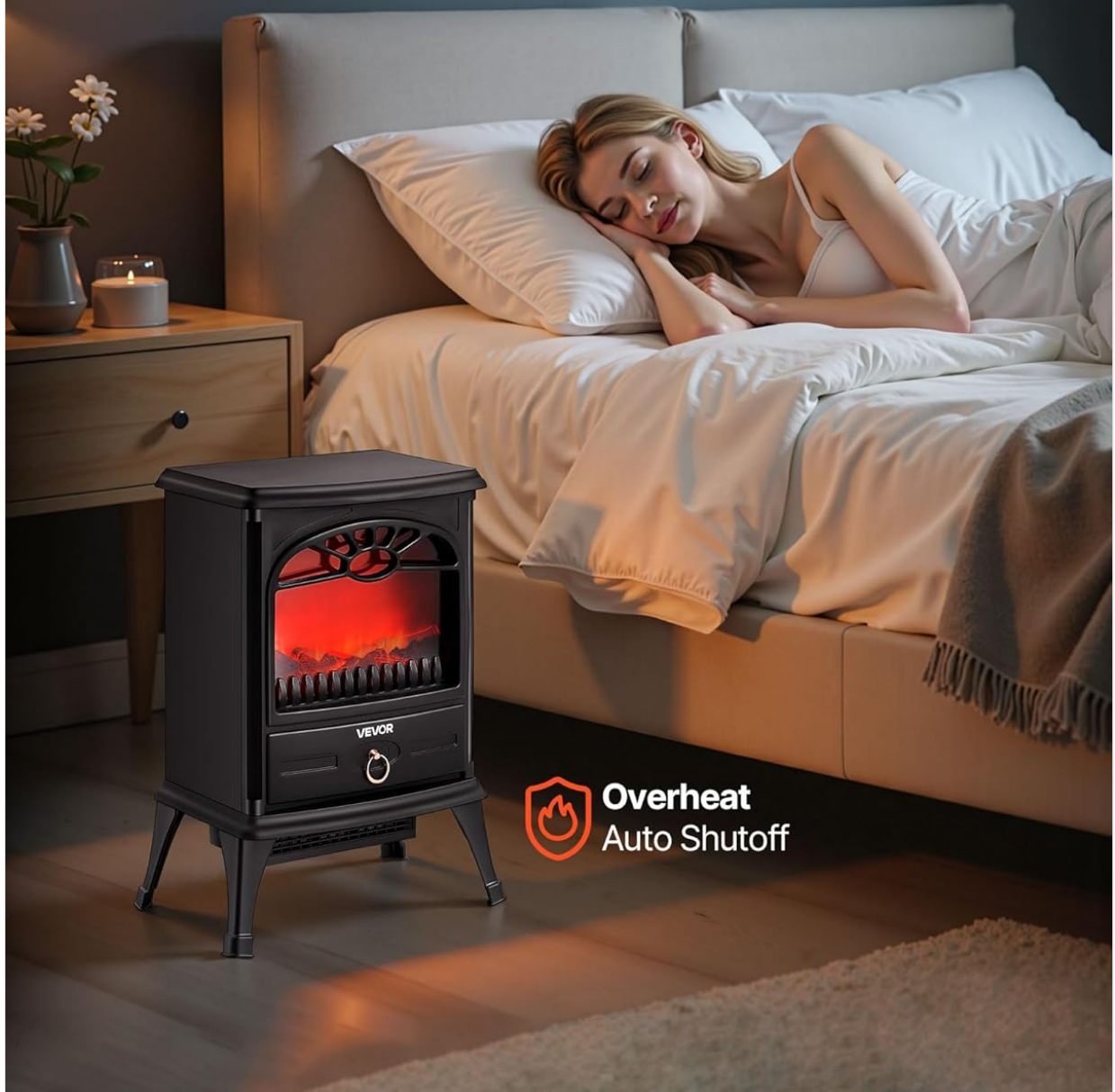
Figure 2: The electric fireplace features an overheating auto shutoff for enhanced safety and peace of mind, especially in bedrooms.