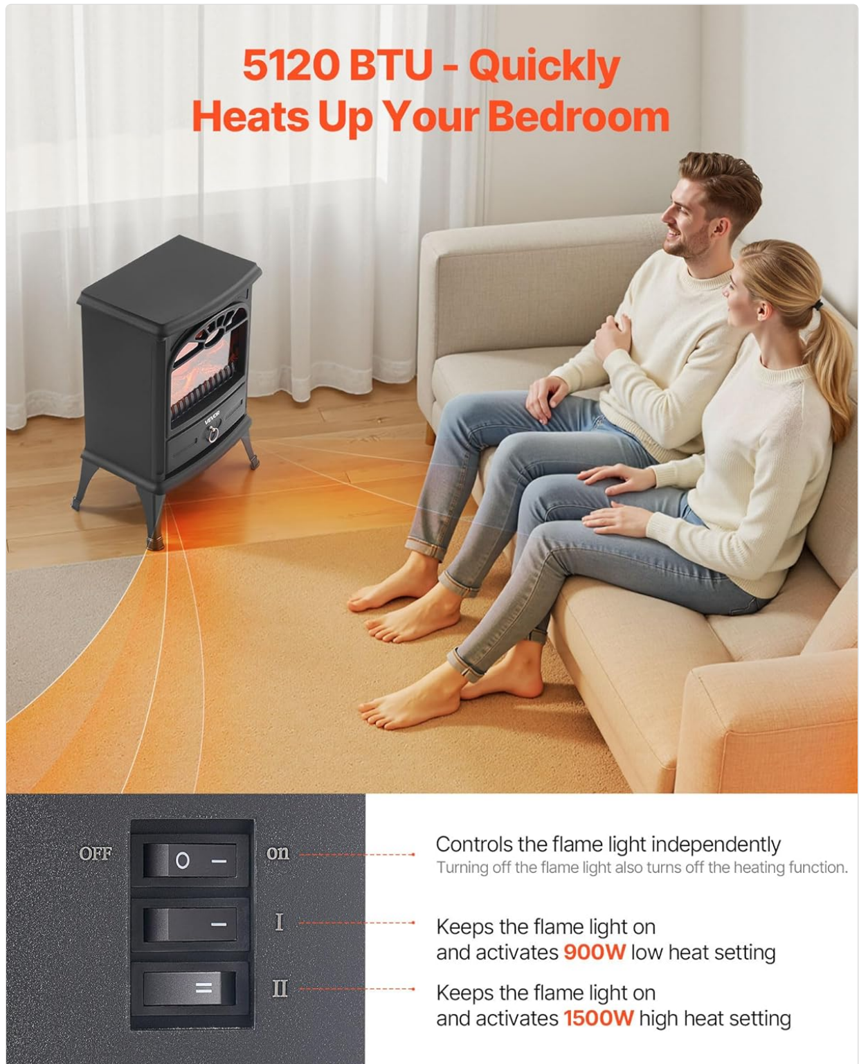
Figure 5: The intuitive control panel allows users to independently control the flame effect and select between 900W (low) and 1500W (high) heating modes.