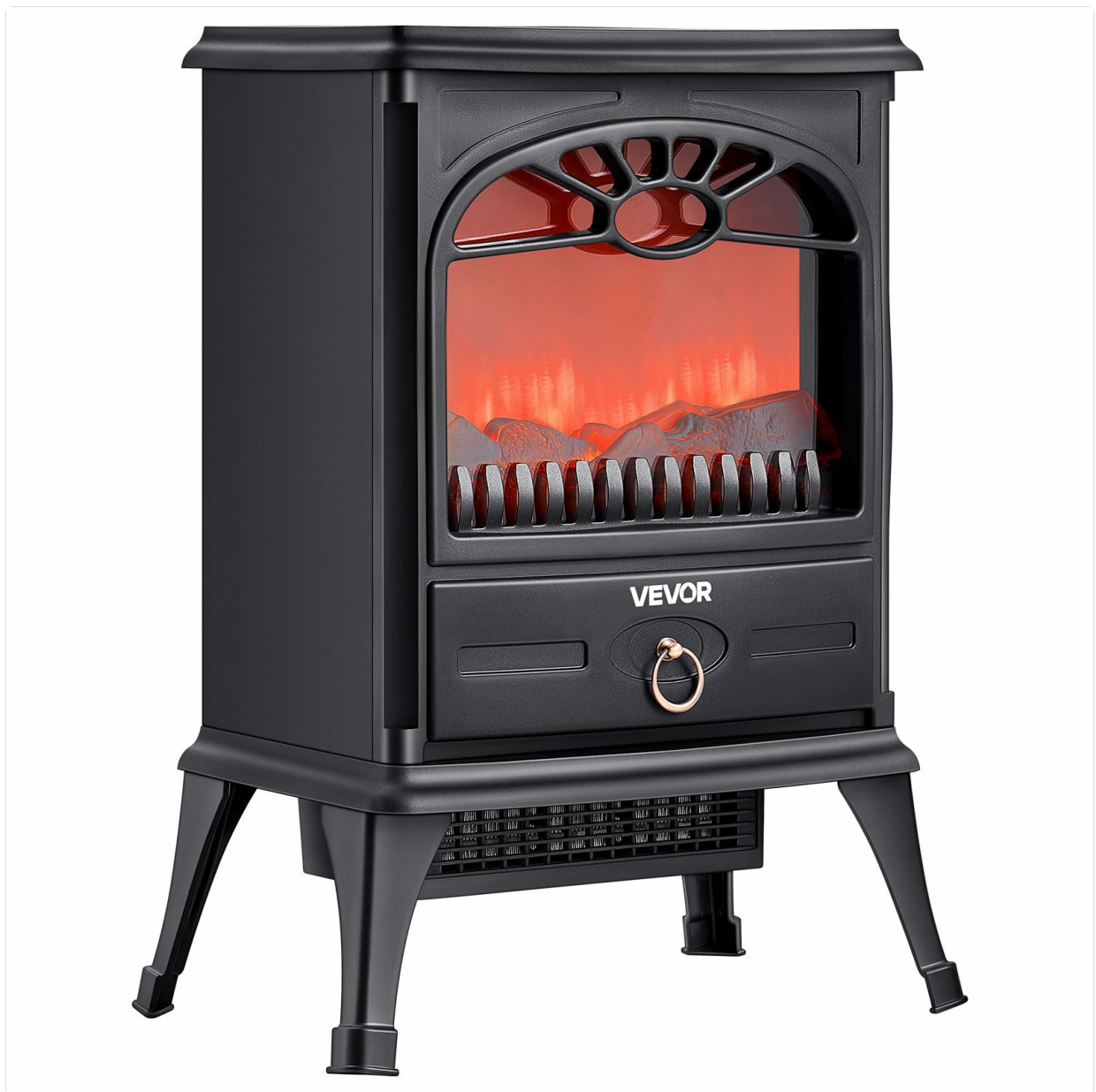
Figure 1: The VEVOR electric fireplace, ideal for adding warmth and ambiance to various rooms like living rooms, bedrooms, studies, and dining areas.