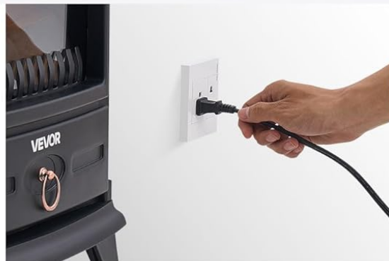
Figure 4: A visual guide illustrating the simple three-step assembly process: attaching the legs, securing them with screws, and plugging in the unit.

Video 1: This video demonstrates the unboxing, quick assembly of the legs, and basic operation of the electric fireplace, including turning on the flame effect and adjusting heat settings.