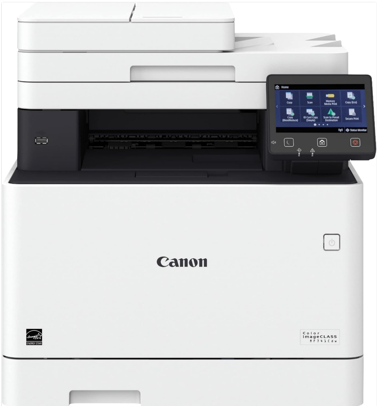
Image 1.1: Front view of the Canon Color imageCLASS MF741Cdw printer, highlighting its compact design and integrated touchscreen control panel.