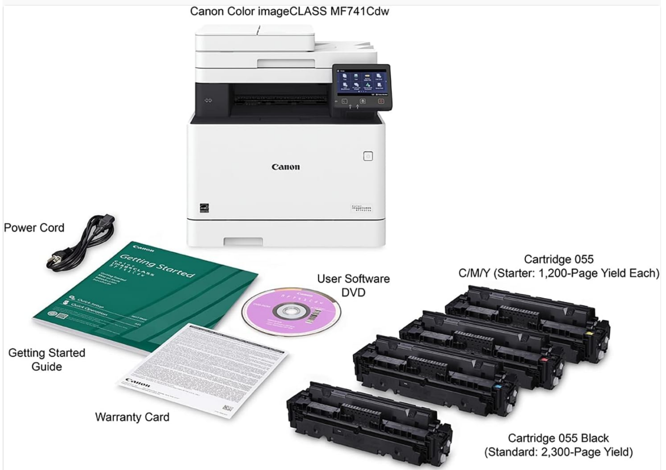
Image 2.1: All items included in the Canon imageCLASS MF741Cdw package, laid out for inspection.