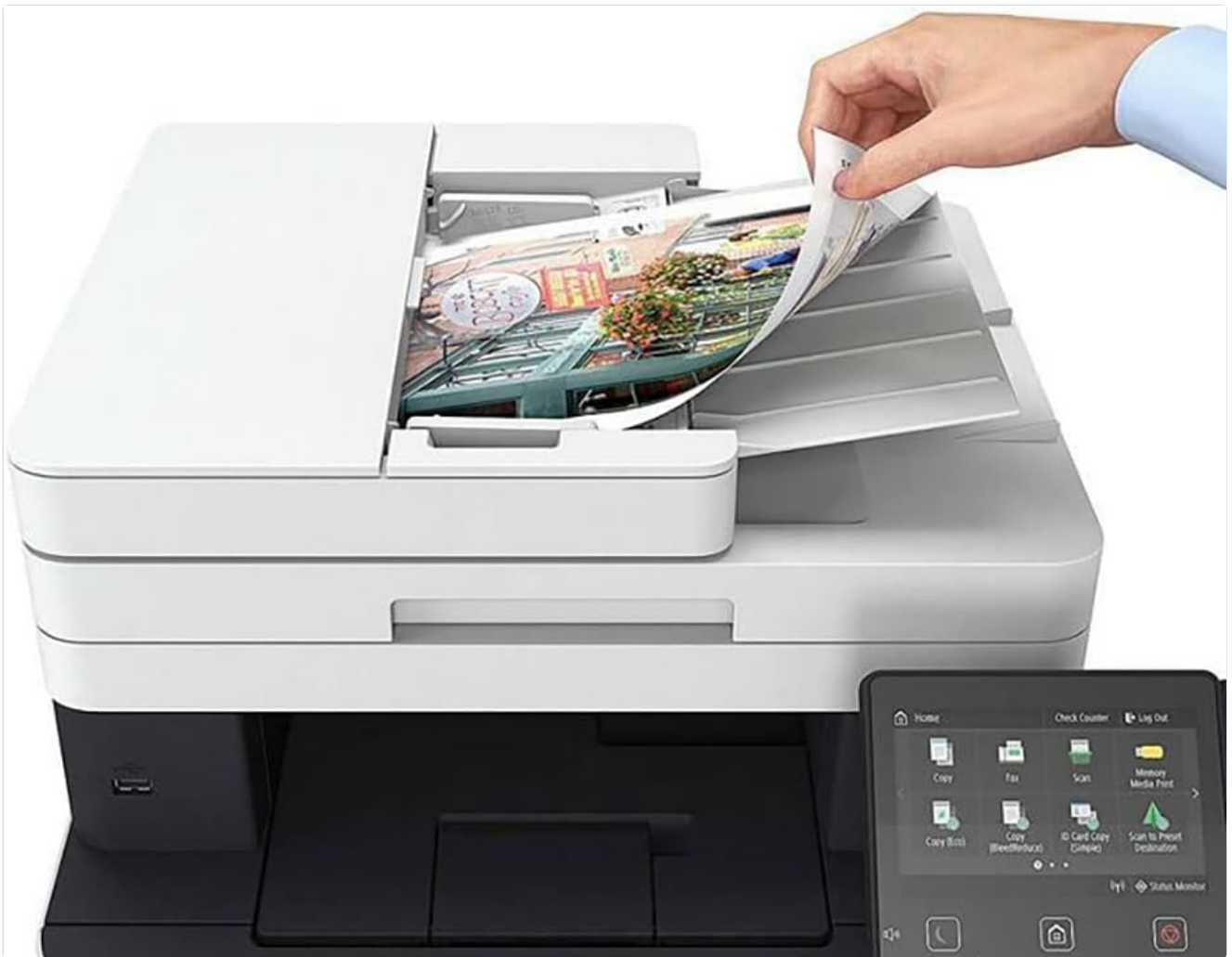
Image 6.1: Physical dimensions of the Canon MF741Cdw printer for space planning.