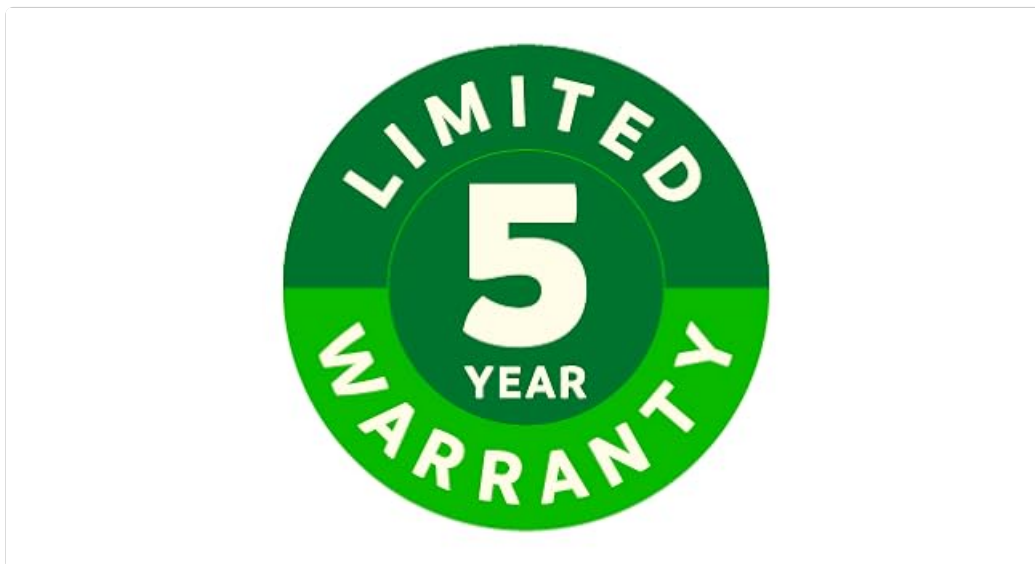
Image: Limited 5 Year Warranty badge.

The FoodSaver Mini Handheld Vacuum Sealer comes with a Limited 5-Year Warranty. For detailed terms and conditions, please refer to the warranty card included in your product packaging or visit the official FoodSaver website.