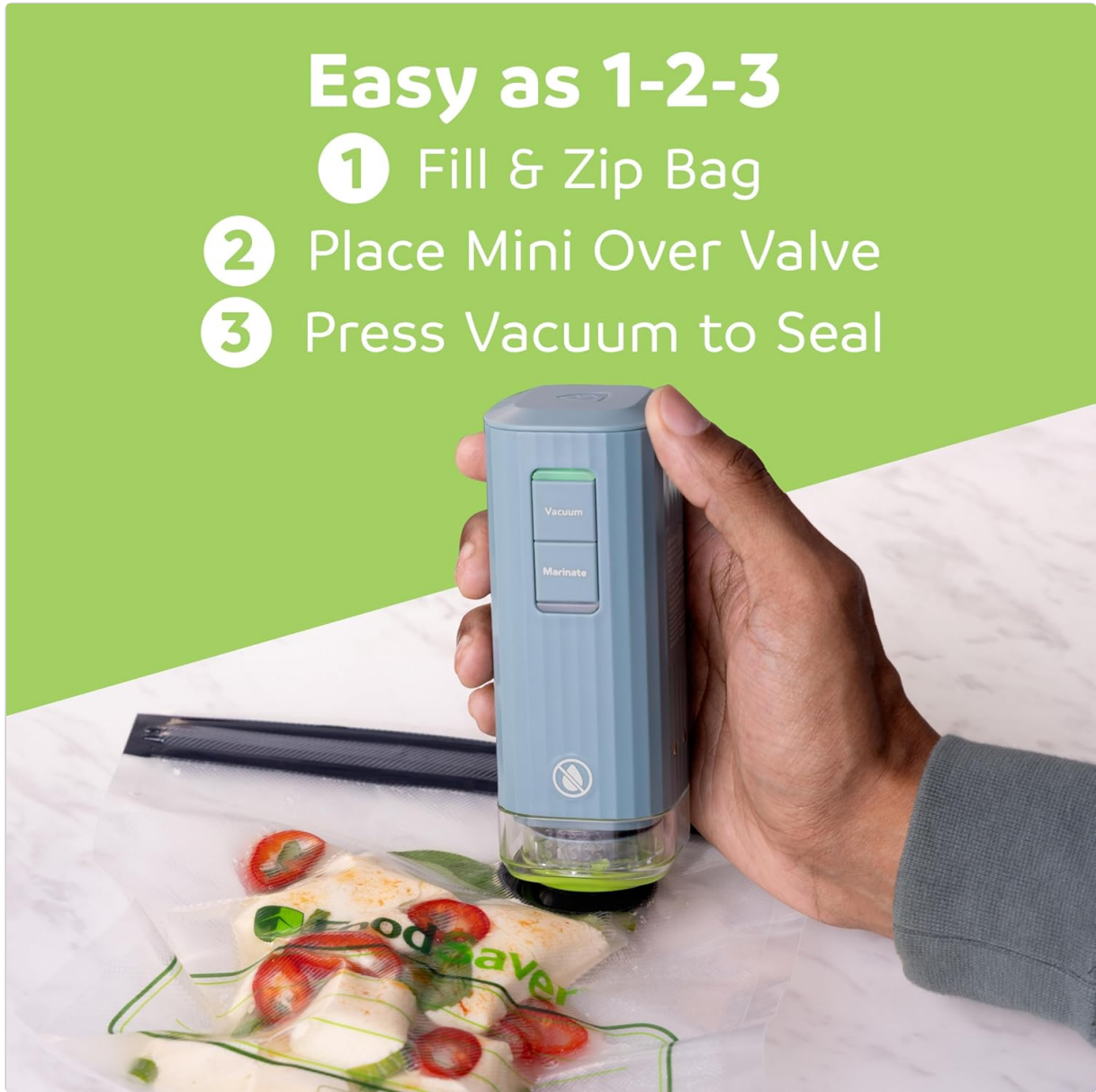
Image: Three-step guide for vacuum sealing with zipper bags.