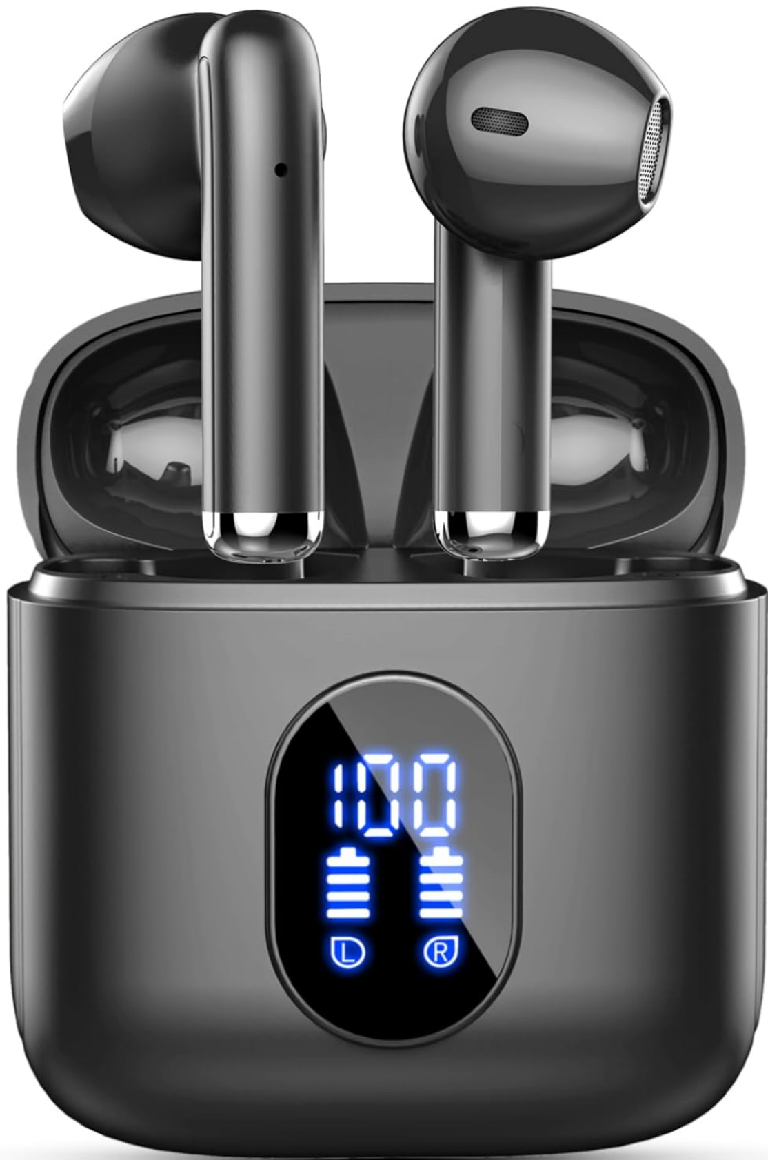
Image: The Rinsmola MD053 Wireless Earbuds resting in their graphite black charging case, which features a prominent LED digital display showing battery percentages for both earbuds and the case.