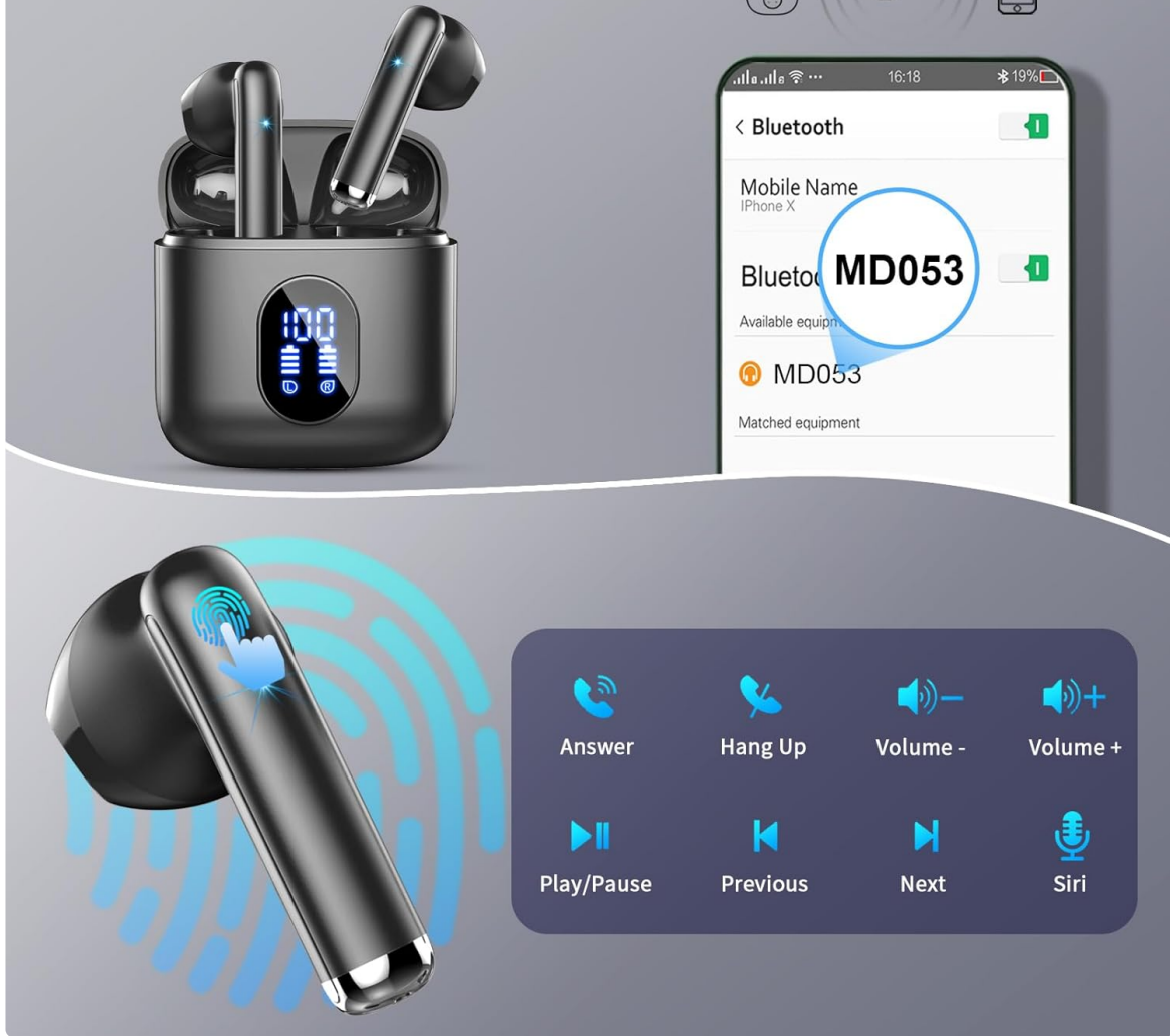
Image: A smartphone screen displaying the Bluetooth pairing menu, with "MD053" highlighted as an available device, demonstrating the one-step pairing process for the earbuds.