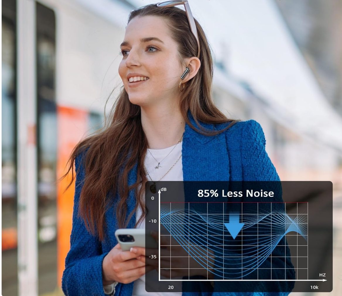
Image: A woman smiling while using the Rinsmola MD053 earbuds in a public setting, with a graph illustrating 85% less noise, demonstrating the clear call capability due to built-in MEMS microphones.

Built-in MEMS microphones, accurately capture your voice in real-time, ensure the other party can hear you more clearly.