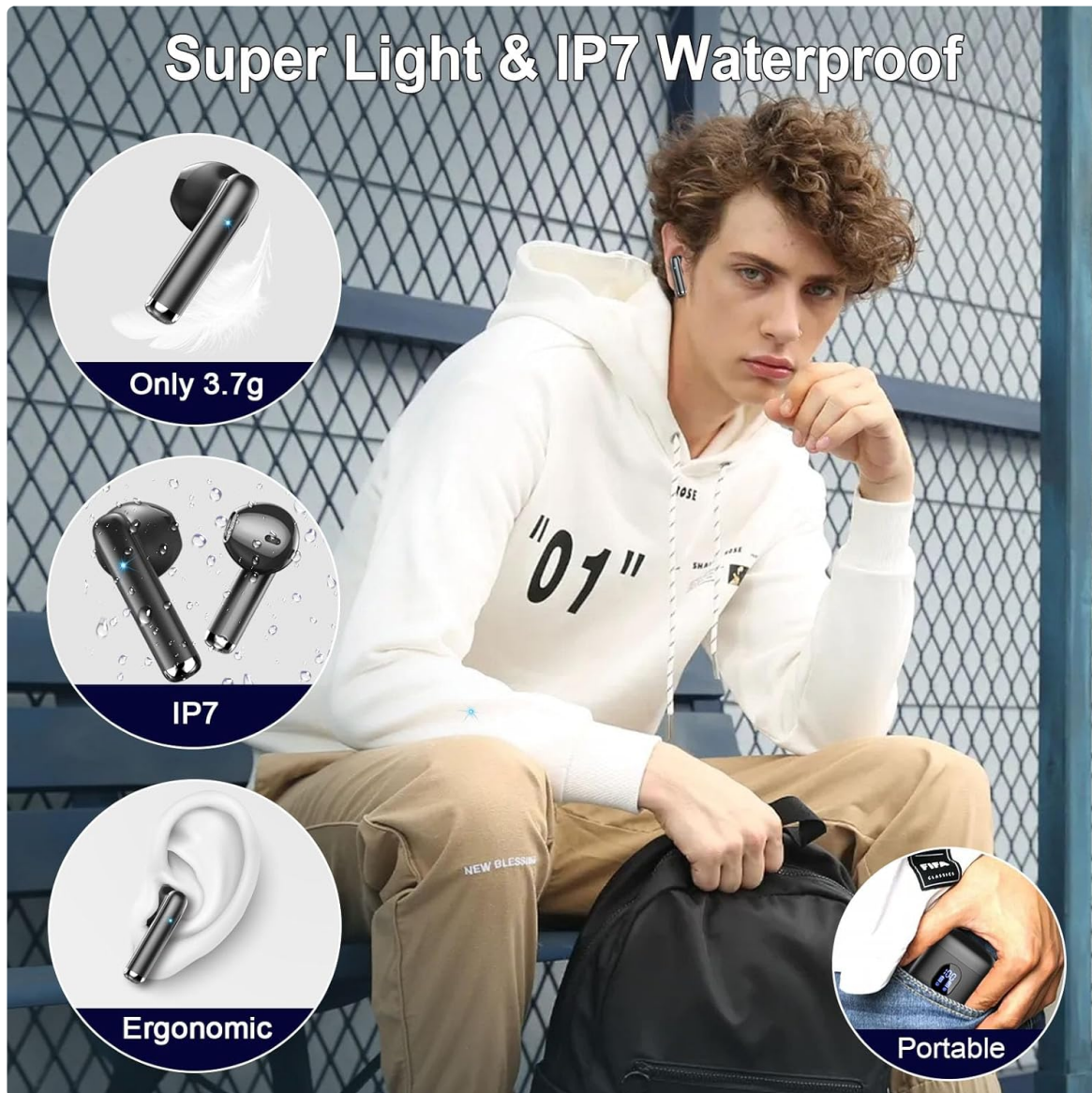
Image: A person wearing the Rinsmola MD053 earbud, highlighting its lightweight (3g) and ergonomic design for comfortable and secure fit, along with an icon indicating its IP7 waterproof rating.

Gently insert the earbuds into your ears, ensuring a snug and comfortable fit. The ergonomic design is crafted to conform to the contour of your ear for stability during various activities.