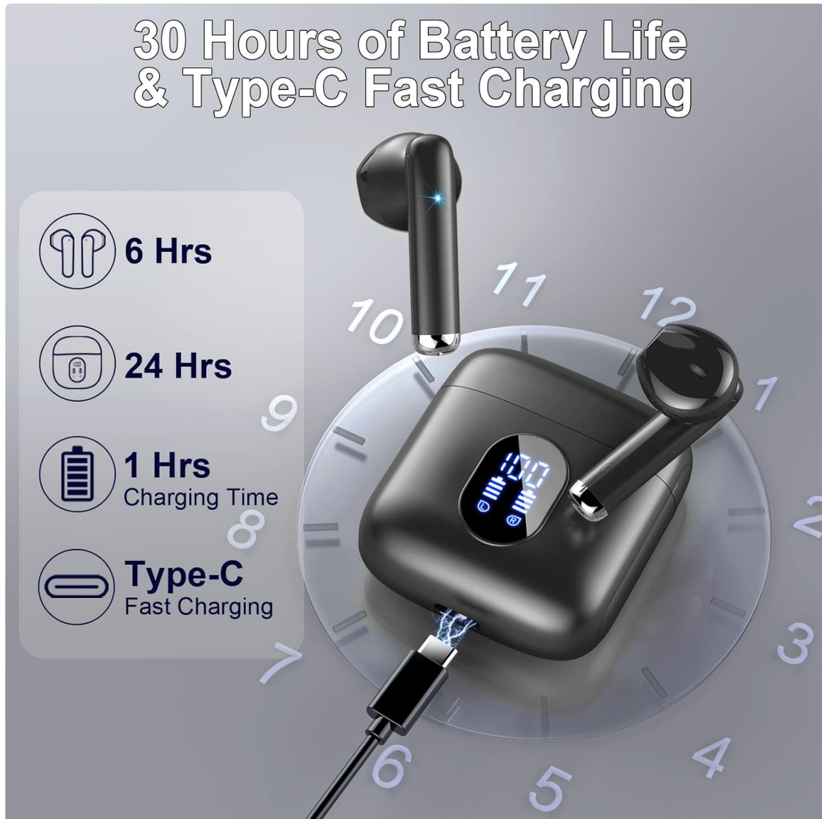
Image: The Rinsmola MD053 charging case with earbuds inside, connected via a USB-C cable for fast charging. The LED display indicates battery levels and charging status.

Before first use, fully charge the charging case and earbuds. Connect the provided USB-C cable to the charging port on the case and a power source. The LED display on the case will show the charging progress. The earbuds will charge automatically when placed inside the case.