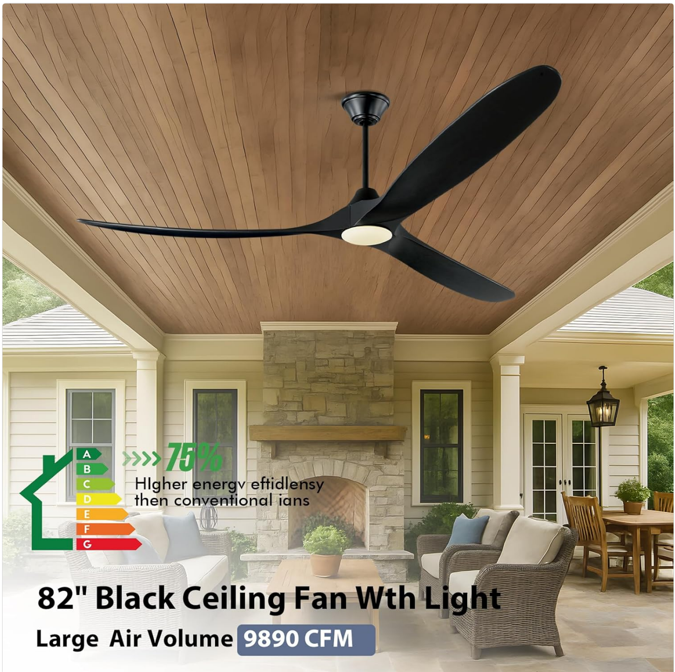
Image: The 82-inch Black Ceiling Fan with Light installed on a patio, emphasizing its high airflow (9890 CFM) and energy efficiency.