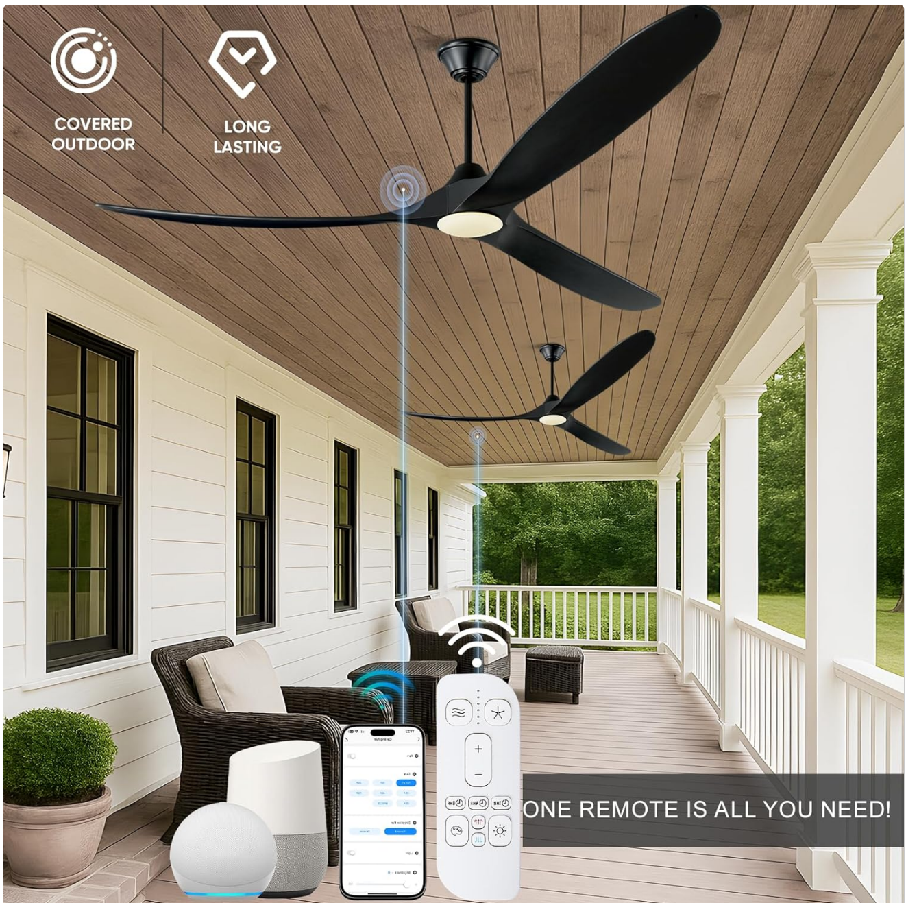
Image: The remote control and smart app interface for controlling the fan, alongside Google Assistant and Alexa devices.