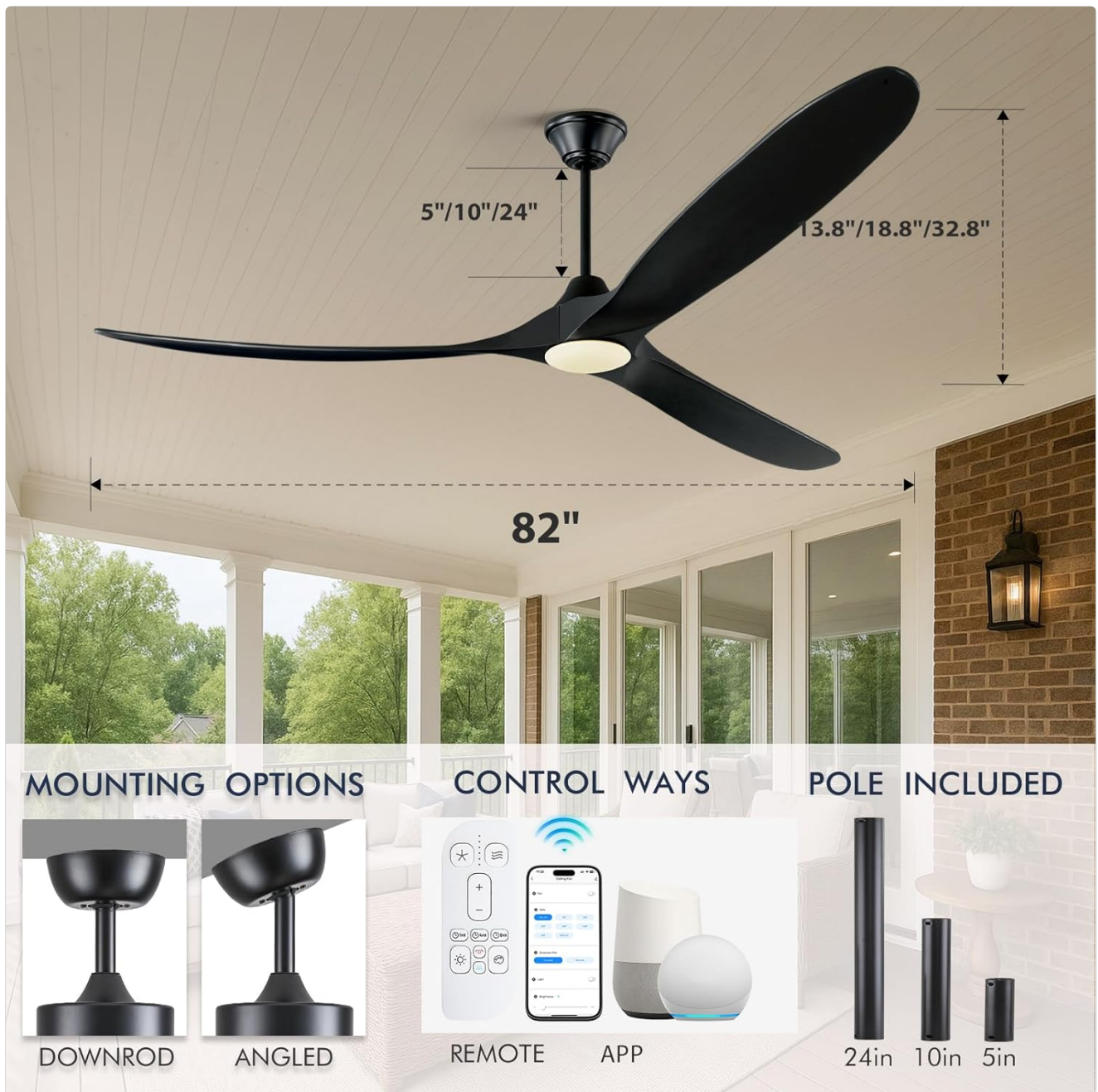
Image: Visual representation of the included downrod options (5-inch, 10-inch, 24-inch) and their impact on fan placement.