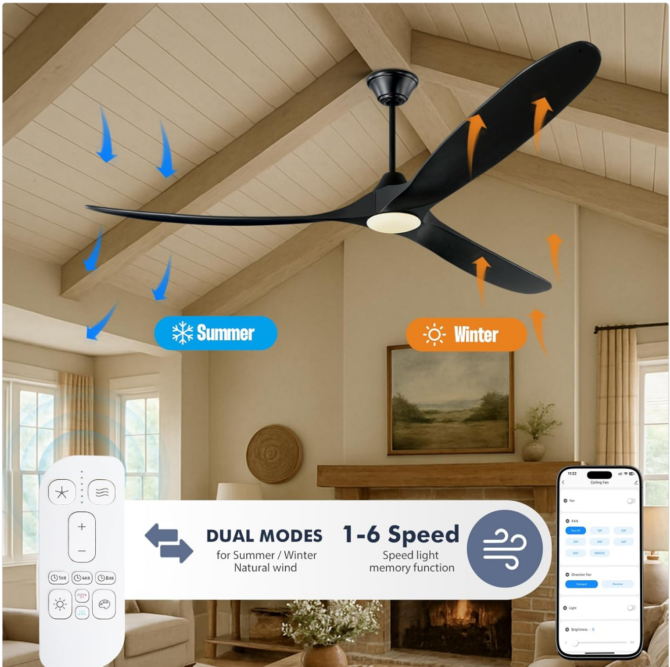
Image: Illustration of the fan's dual modes (Summer/Winter) and 1-6 speed settings, along with remote and app control.

Note on Downrods: Two downrods (10" and 24") are included. A 40-inch downrod is available separately if needed for higher ceilings or specific installations. The fan is suitable for sloped ceilings up to 20 degrees.