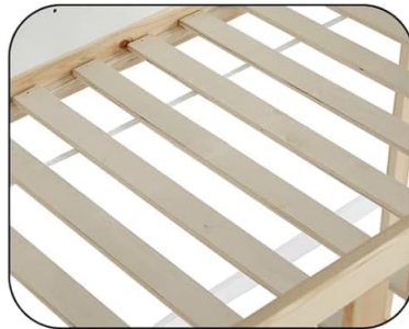
Liberté de conception sous le lit