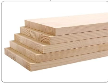
bois de pin