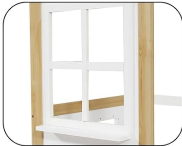
Lit cabane avec fenêtre

L'espace sous le lit peut être conçu librement