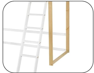
Échelle inclinée confortable et sûre

Image: A KOMHTOM Loft Bed set up in a child's room, showcasing its design with a house-shaped upper bunk, decorative windows, and an inclined ladder for easy access. Callouts point to the 'house bed with window', 'freedom of design under the bed', and 'comfortable and safe inclined ladder'.