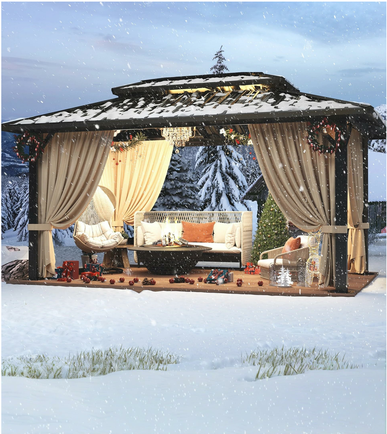
Figure 1: HOTEEL 10x12 Hardtop Gazebo, fully assembled.