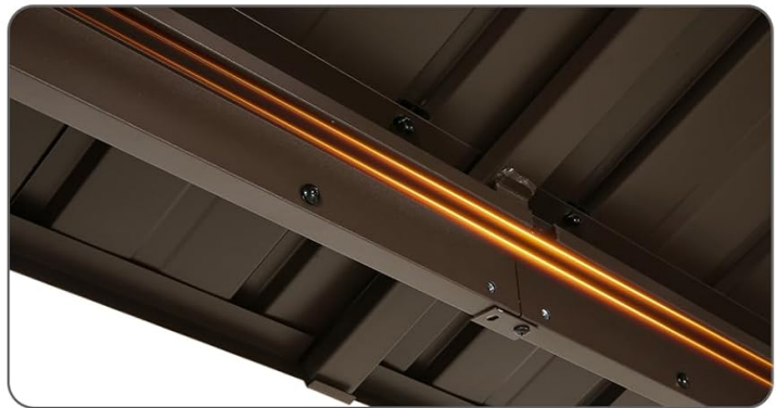
Figure 4: Mesh design, hanging hooks, and double-track system.

Equipped with double-track system, curtain and netting can be adjusted separately and conveniently.