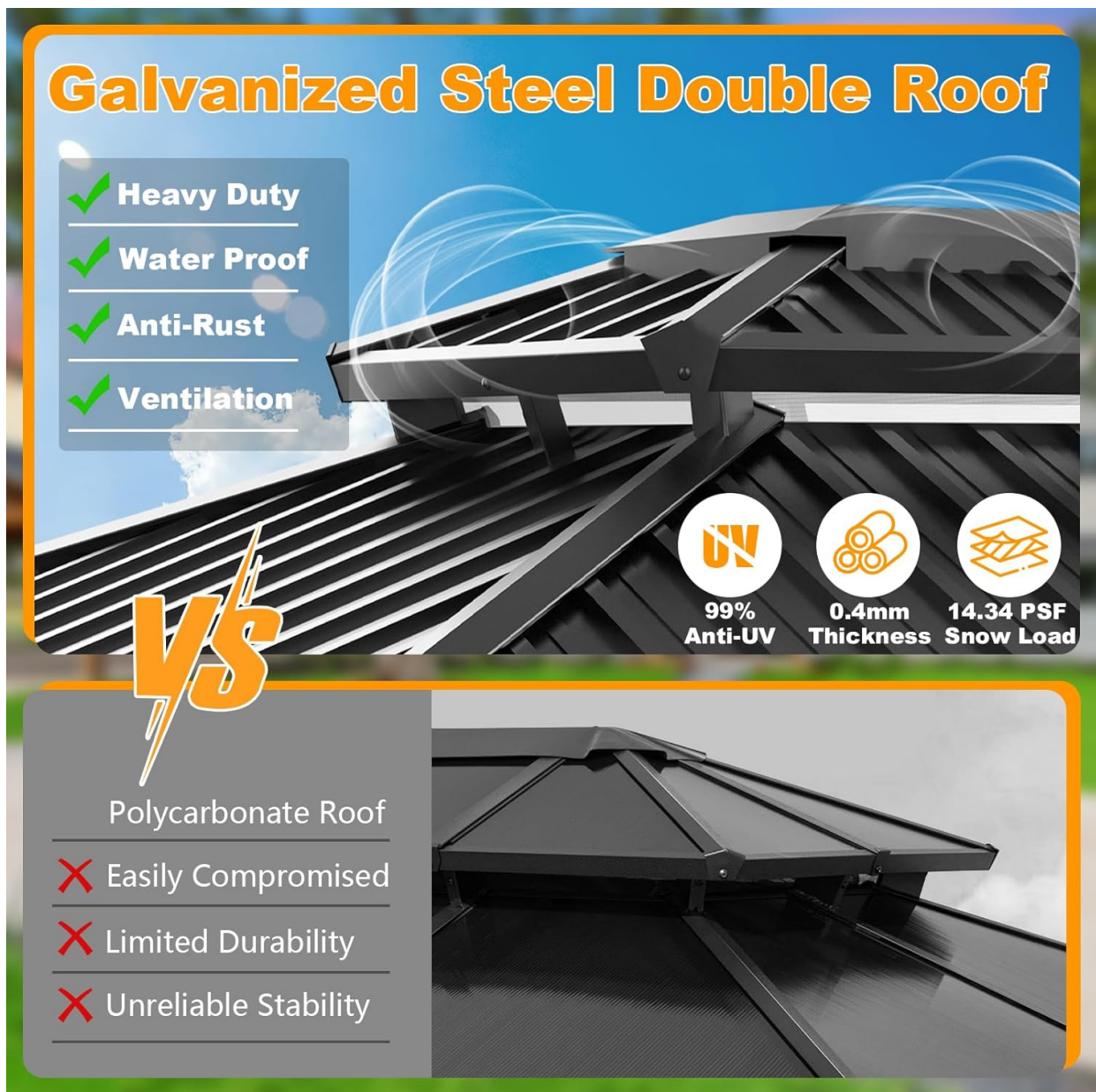
Figure 3: Galvanized steel double roof construction details.

For detailed roof assembly steps, please watch the video below: