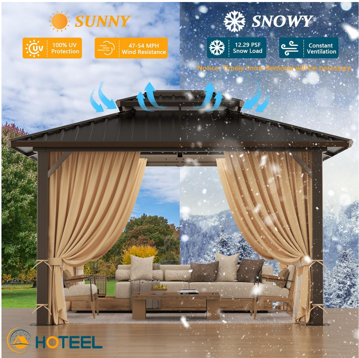
Figure 7: Gazebo performance in sunny and snowy conditions, with a reminder for snow removal.