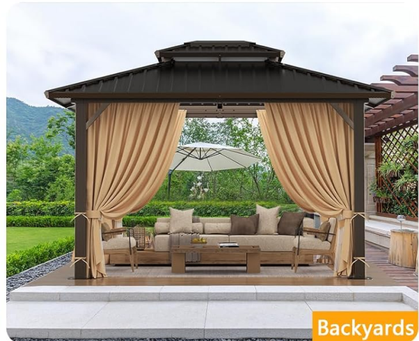
Figure 6: The gazebo is suitable for various outdoor environments.