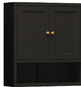
Bathroom Wall Cabinet