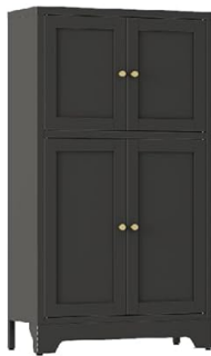
4 Doors Bathroom cabinet