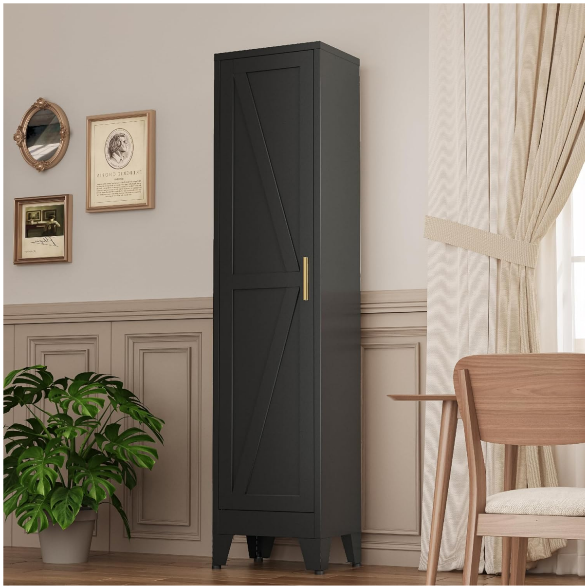
Image: A single YAUWOH Narrow Metal Cabinet with a barn door design, closed, positioned in a room next to a chair and plant, showcasing its sleek appearance.