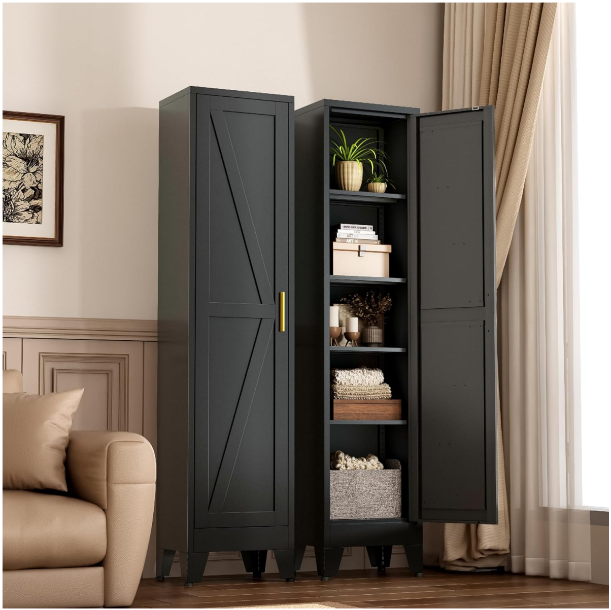
Image: Two YAUWOH Narrow Metal Cabinets, one closed with a barn door design and one open revealing adjustable shelves filled with various items. The cabinet is suitable for multiple room types.