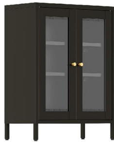
Bathroom Floor Cabinet