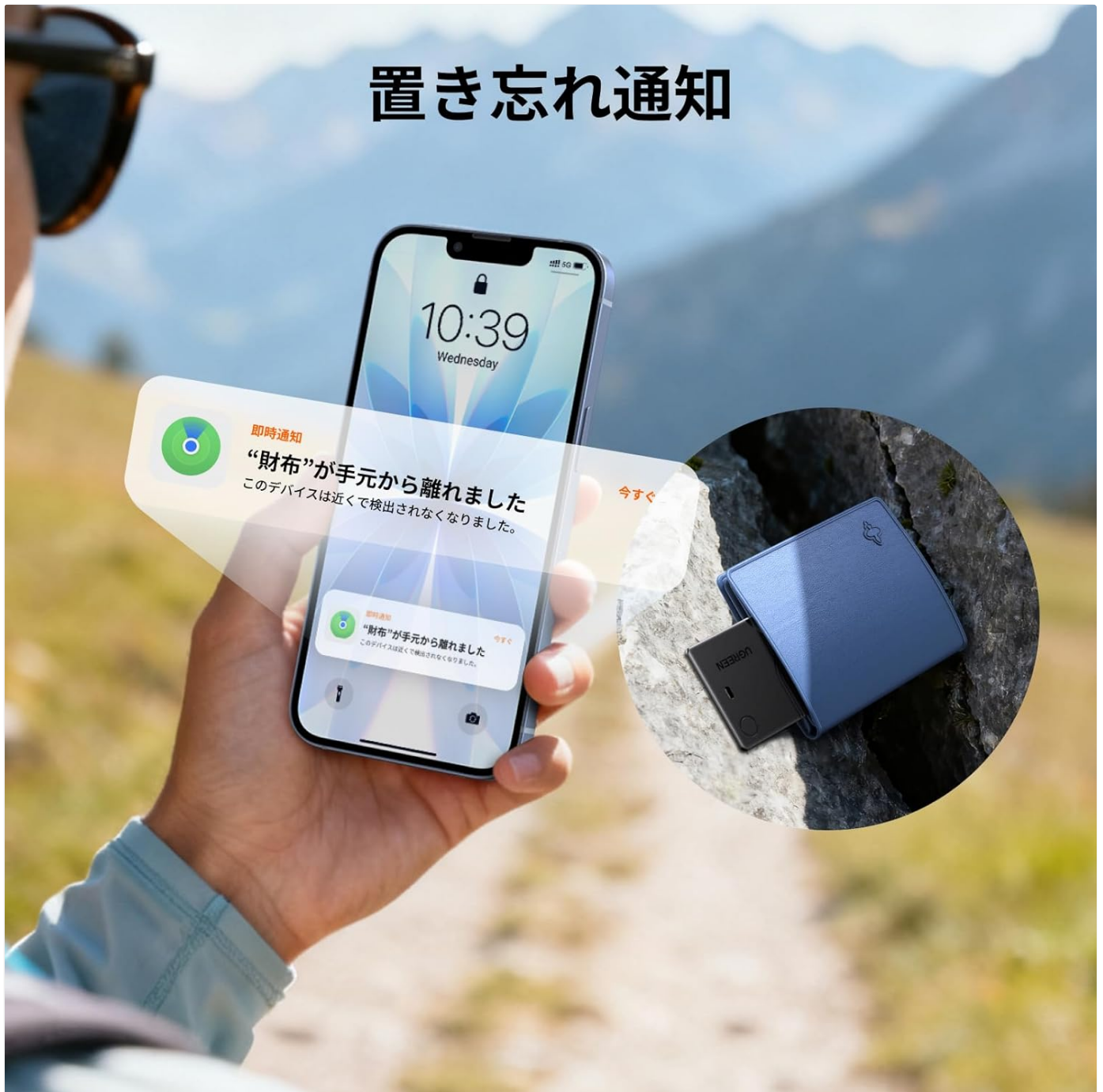
Image: An iPhone screen showing a notification indicating that the tracked item has been left behind, with the tracker visible next to a wallet.