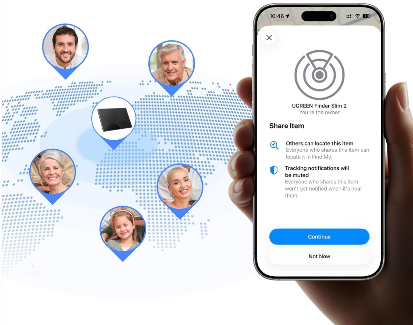
Image: An iPhone screen showing the Find My app interface for sharing the tracker's location with family and friends.