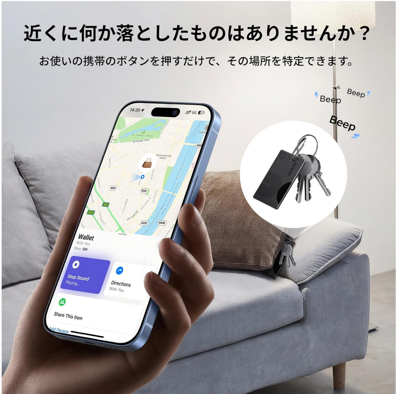
Image: An iPhone screen showing the 'Play Sound' option in the Find My app, with the tracker attached to keys hidden under a sofa cushion, indicating the sound helps locate it.

If your item is nearby, open the Find My app, select your UGREEN FineTrack Slim from the 'Items' tab, and tap 'Play Sound'. The tracker will emit a 100dB alarm, helping you quickly find it, even if it's hidden under cushions or in another room.