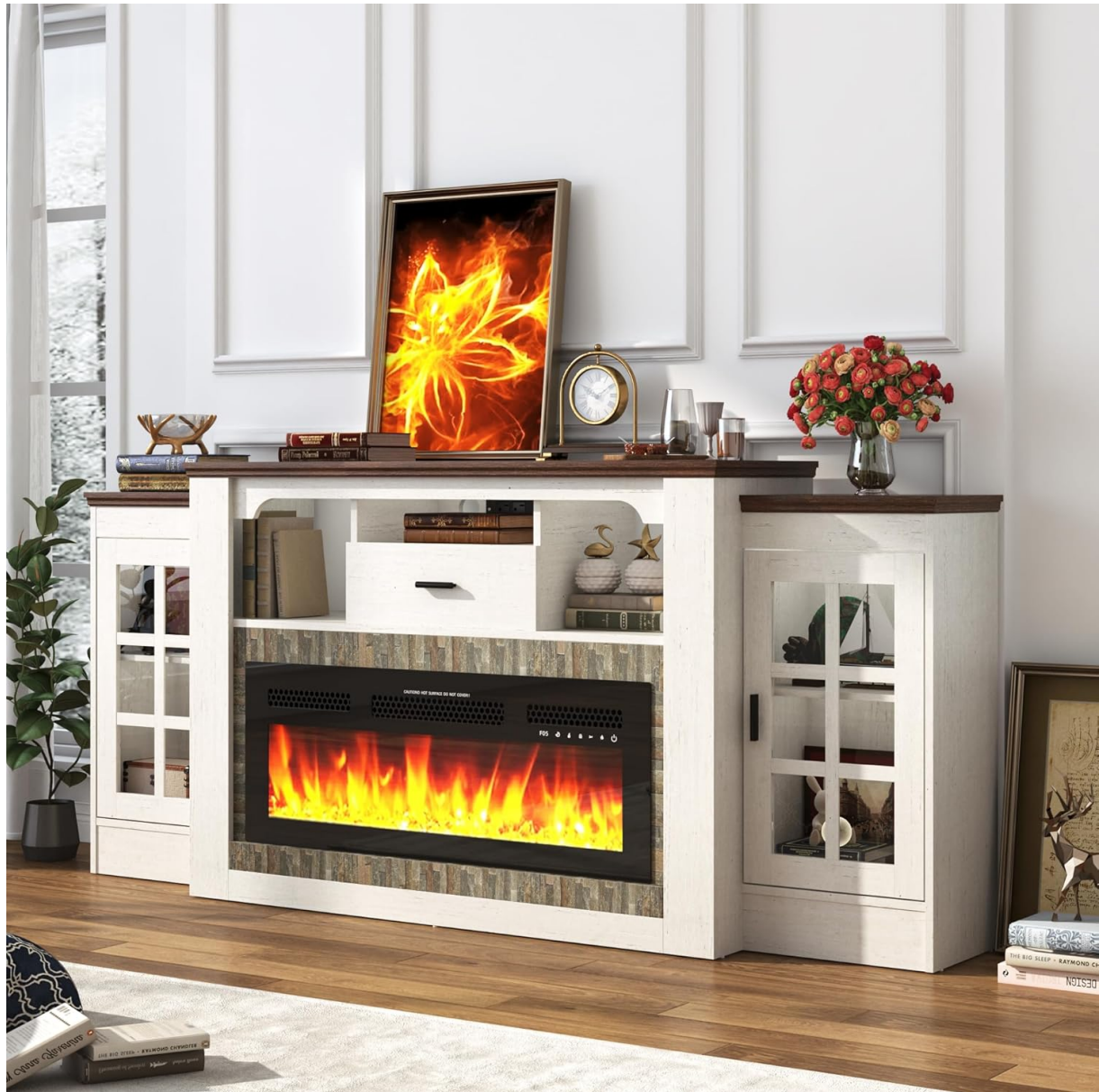
Image: Fully assembled Hiveloood 75-inch Electric Fireplace with Mantel and TV Stand.

For visual guidance, please refer to the assembly videos provided by the manufacturer or seller.