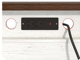
2 Cable Holes