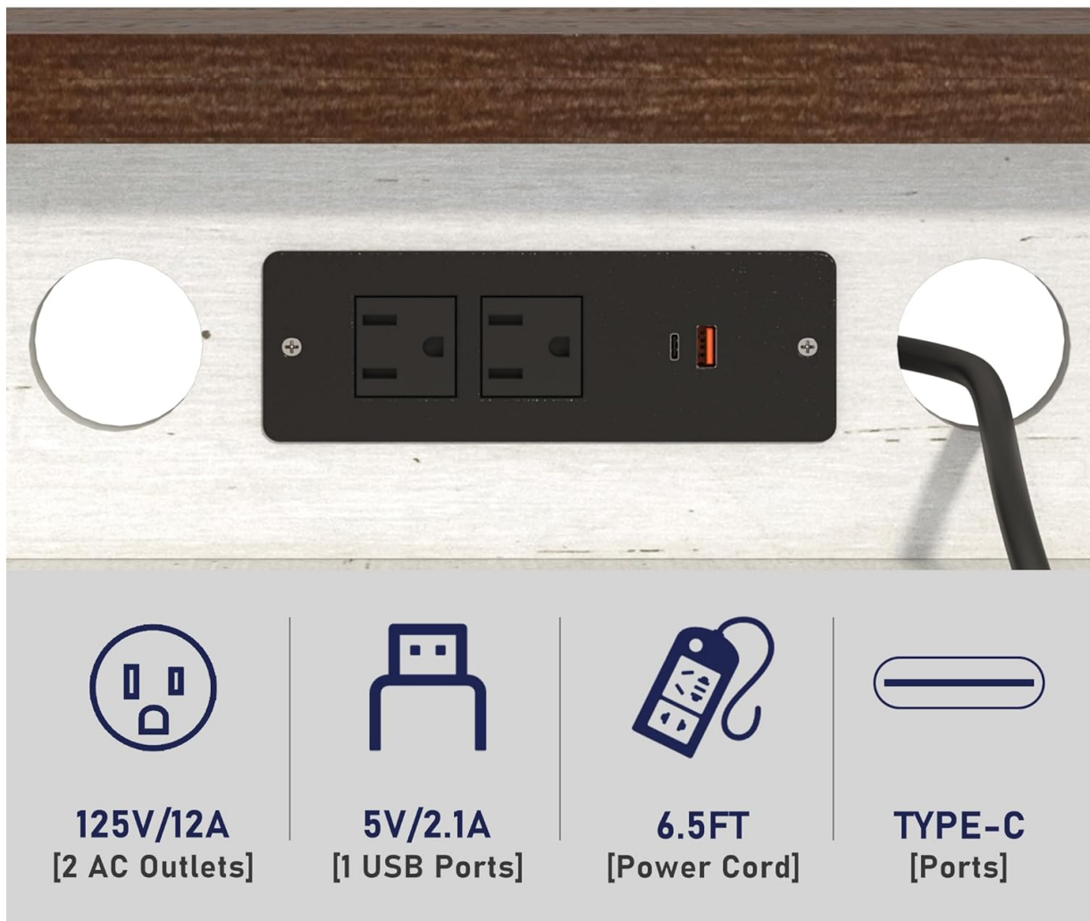
Image: Close-up of the integrated power outlets, including 2 AC outlets, 1 USB port, and a 6.5ft power cord.