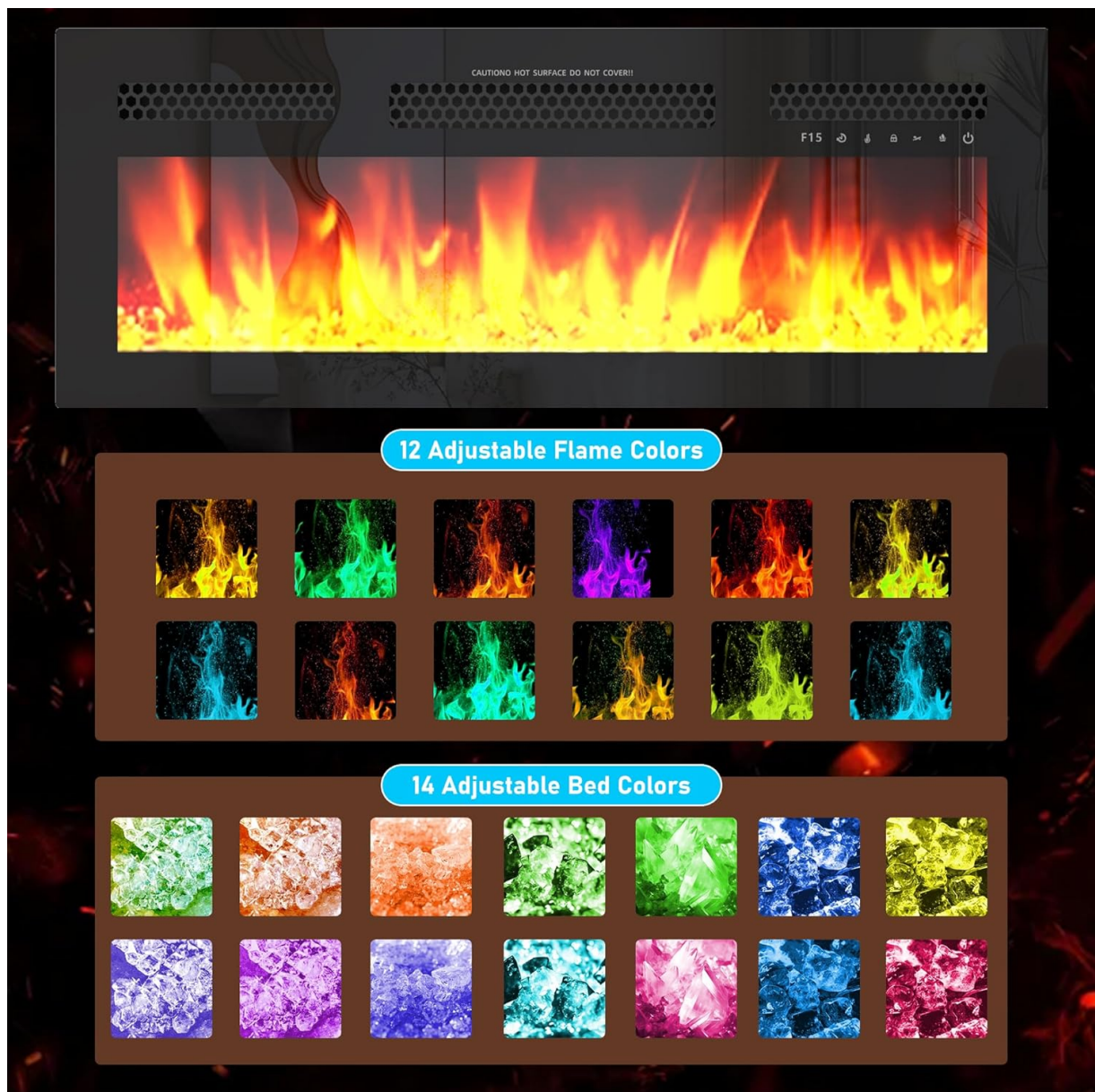
Image: Examples of 12 adjustable flame colors and 14 adjustable carbon bed effects.