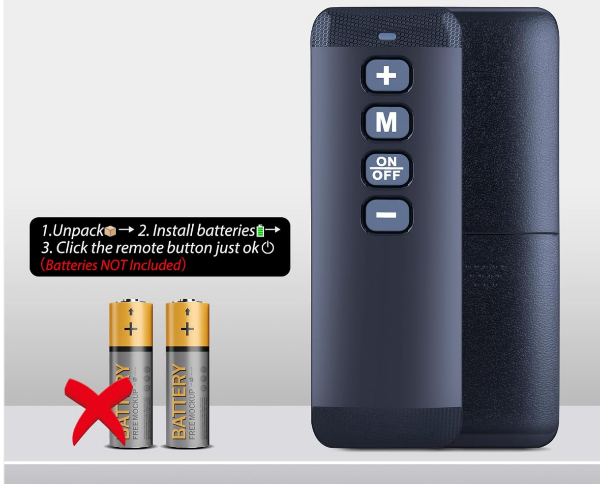
Image: An illustration demonstrating the process of installing two AAA batteries into the remote control, with a clear indication that batteries are not included.