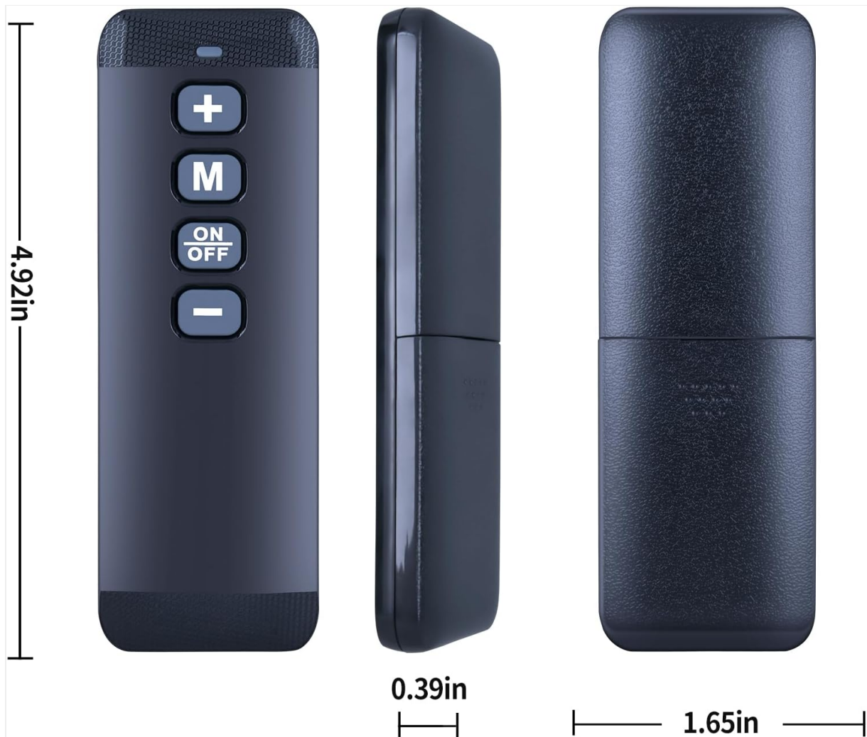
Image: A diagram illustrating the physical dimensions of the remote control (length, width, thickness).