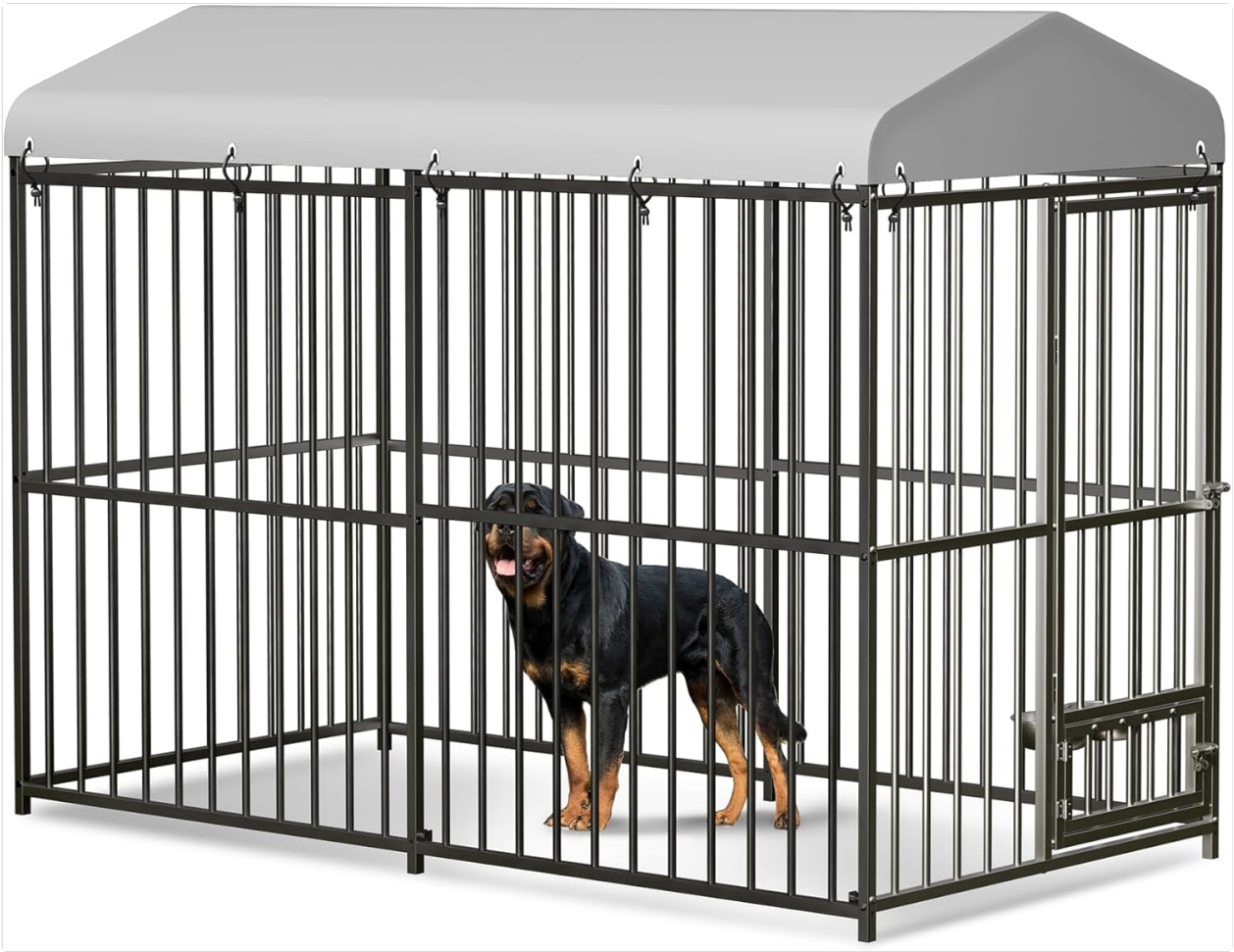
Figure 1: Fully assembled Gaderth Large Outdoor Dog Kennel with a dog inside.