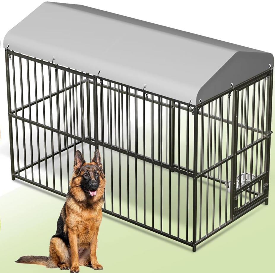
Figure 4: The kennel's versatile design allows it to be used for various pets, including dogs, ducks, chickens, and rabbits.