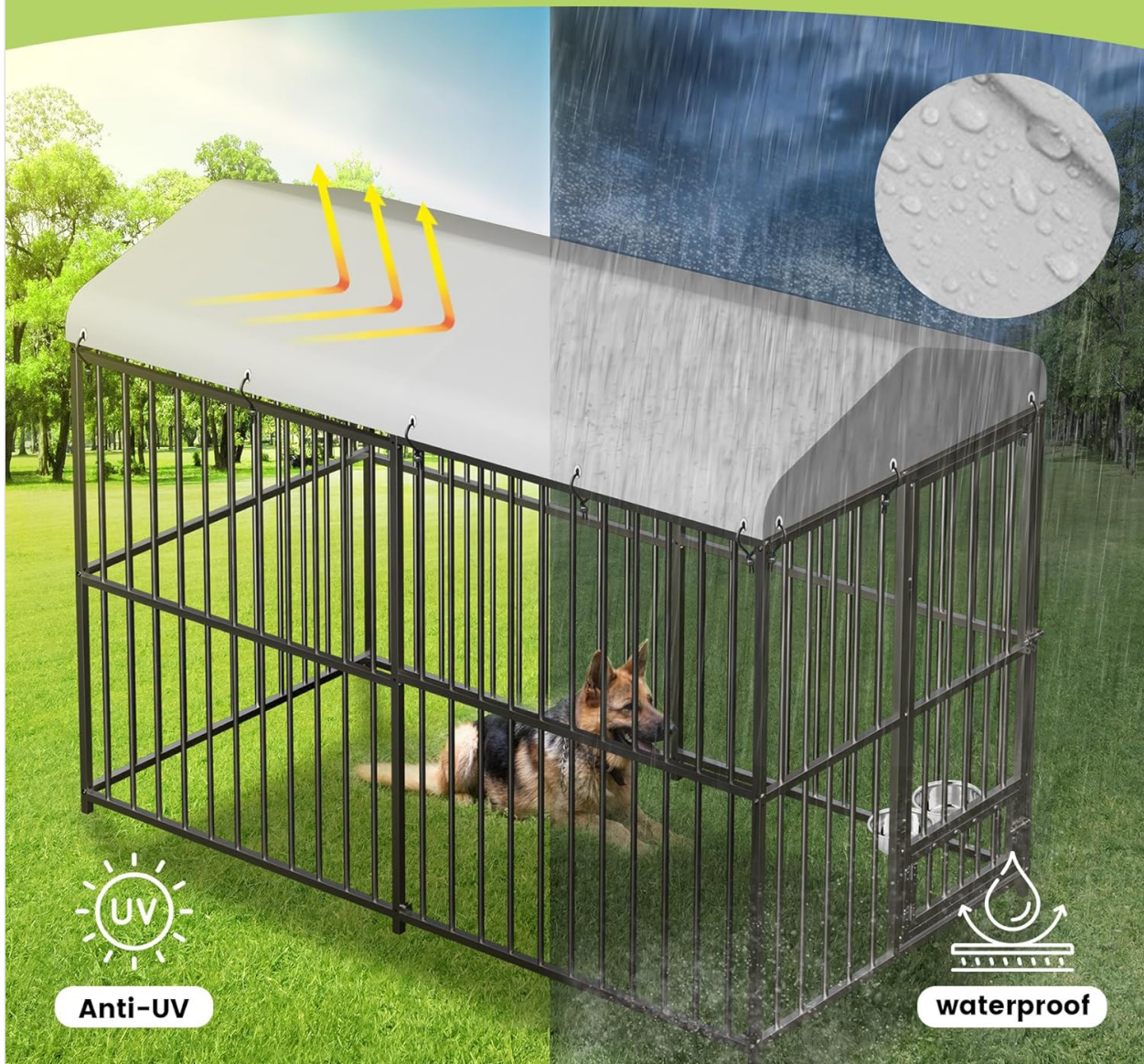
Figure 3: The waterproof and anti-UV canopy provides essential protection from sun and rain for pets inside the kennel.