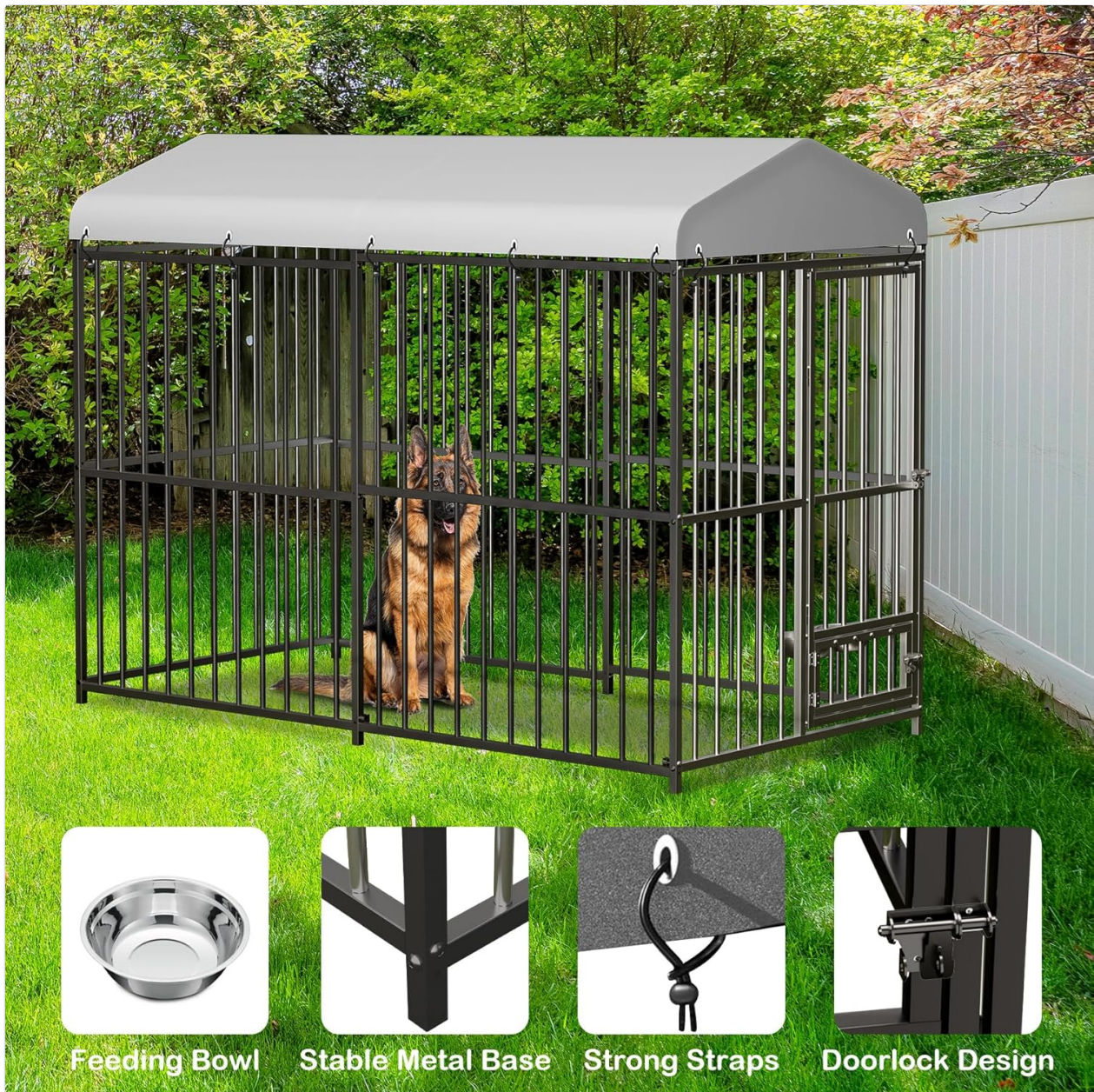
Figure 2: Key features of the kennel, including the feeding bowl, stable metal base, strong straps for the canopy, and the secure doorlock design.