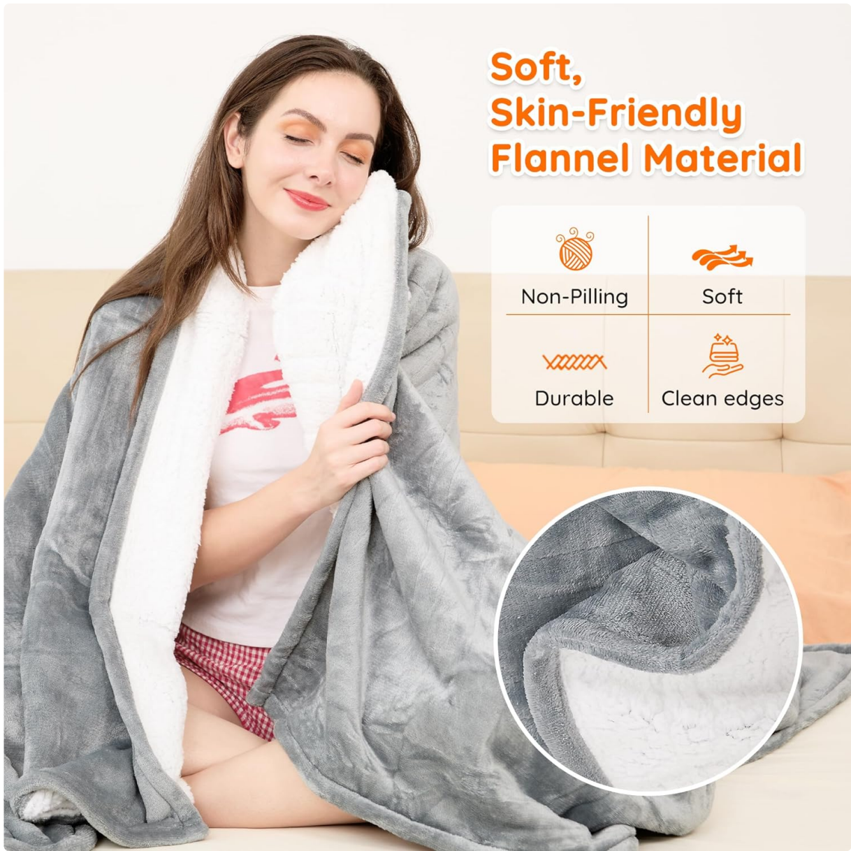
Image: Close-up of the soft, skin-friendly flannel material of the Mia&Coco heated blanket.