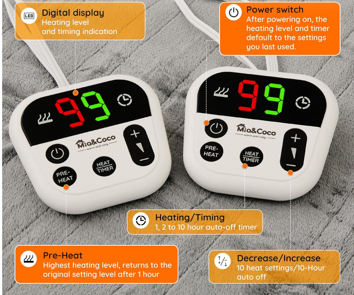
Image: Close-up of the two intuitive and user-friendly controllers with digital displays for heating level and timing indication, power switch, pre-heat, heat timer, and increase/decrease buttons.